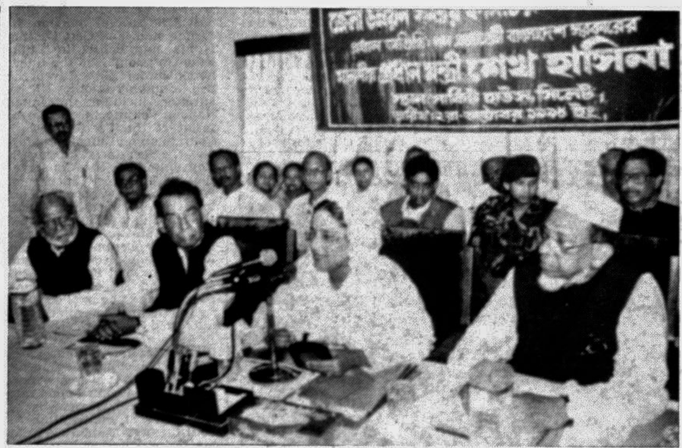
Prime Minister Sheikh Hasina presiding over a meeting of development coordination committee of Sylhet division at Circuit House yesterday.