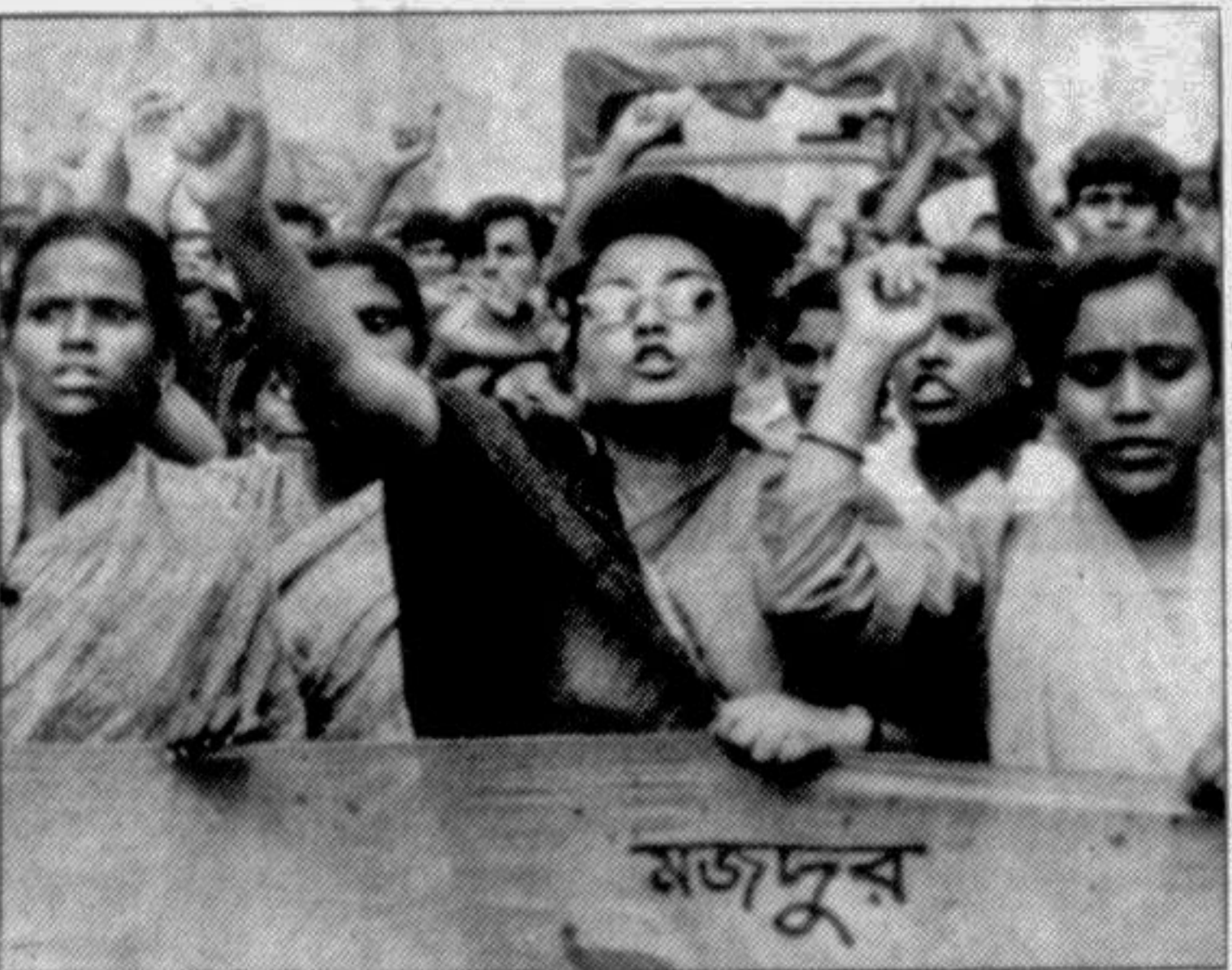
Employees and workers of Windmill Sweater Company brought out a procession in the city yesterday demanding arrear wages.

President, PM greet German leaders President Shahabuddin Ahmed yesterday felicitated the President of the Federal Republic of Germany (FRG) Dr Roman Herzog on the occasion of the Day of German Unity, reports BSS. In a message on the eve of day Shahabuddin said, "I am confident that the friendly relations and close cooperations between our two countries will be further developed in the years ahead." He wished good health and happiness of Herzog and prosperity of the friendly people of the FRG. In another message Prime Minister Sheikh Hasina yesterday conveyed her cordial greetings and felicitations to the government and the people of the Federal Republic of Germany (FRG) on the occasion of the Day of German Unity. In a message to her German counterpart Chancellor Helmut Kohl, Sheikh Hasina said, "On the auspicious occasion of the Day of German Unity, the government and the people of Bangladesh join me in conveying to you and through you to the government and the people of the Federal Republic of Germany our cordial greetings and felicitations." She wished Kohl's good health, happiness and long life and continued peace and prosperity of the friendly German people. Sheikh Hasina also hoped that the bonds of friendship, understanding and cooperation developed over the years would be further strengthened and consolidated in future for the mutual benefit of the two countries.