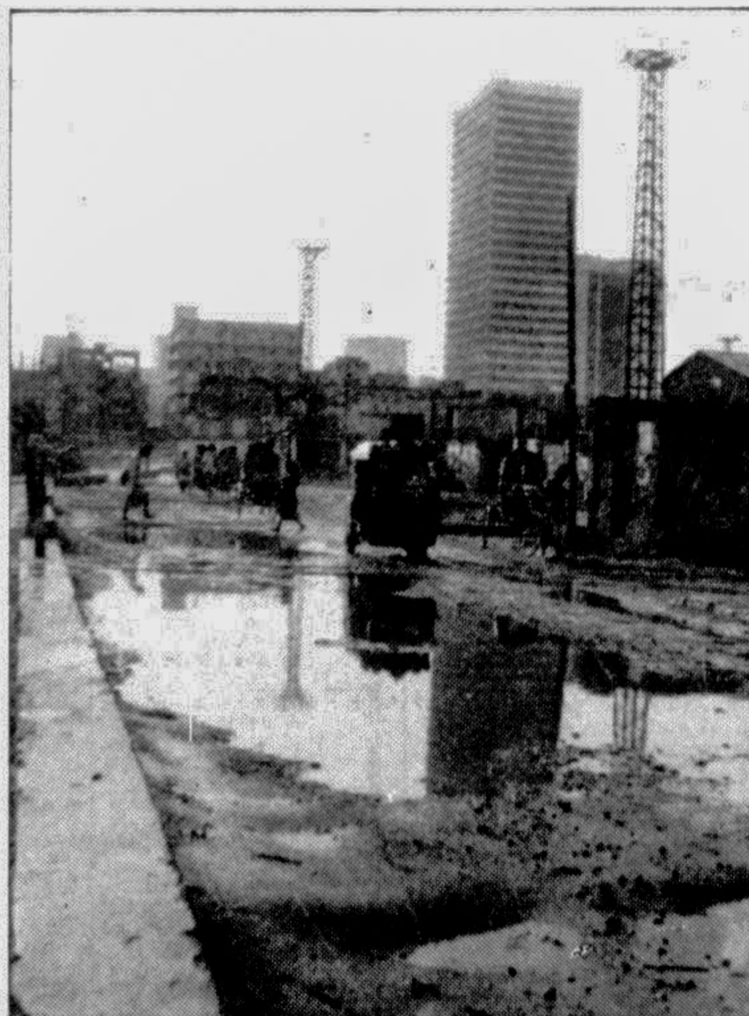
The only road connecting Mugdapara, Sabujbagh and Ahmedbagh areas of the city with Motijheel Commercial Area is in a deplorable condition.