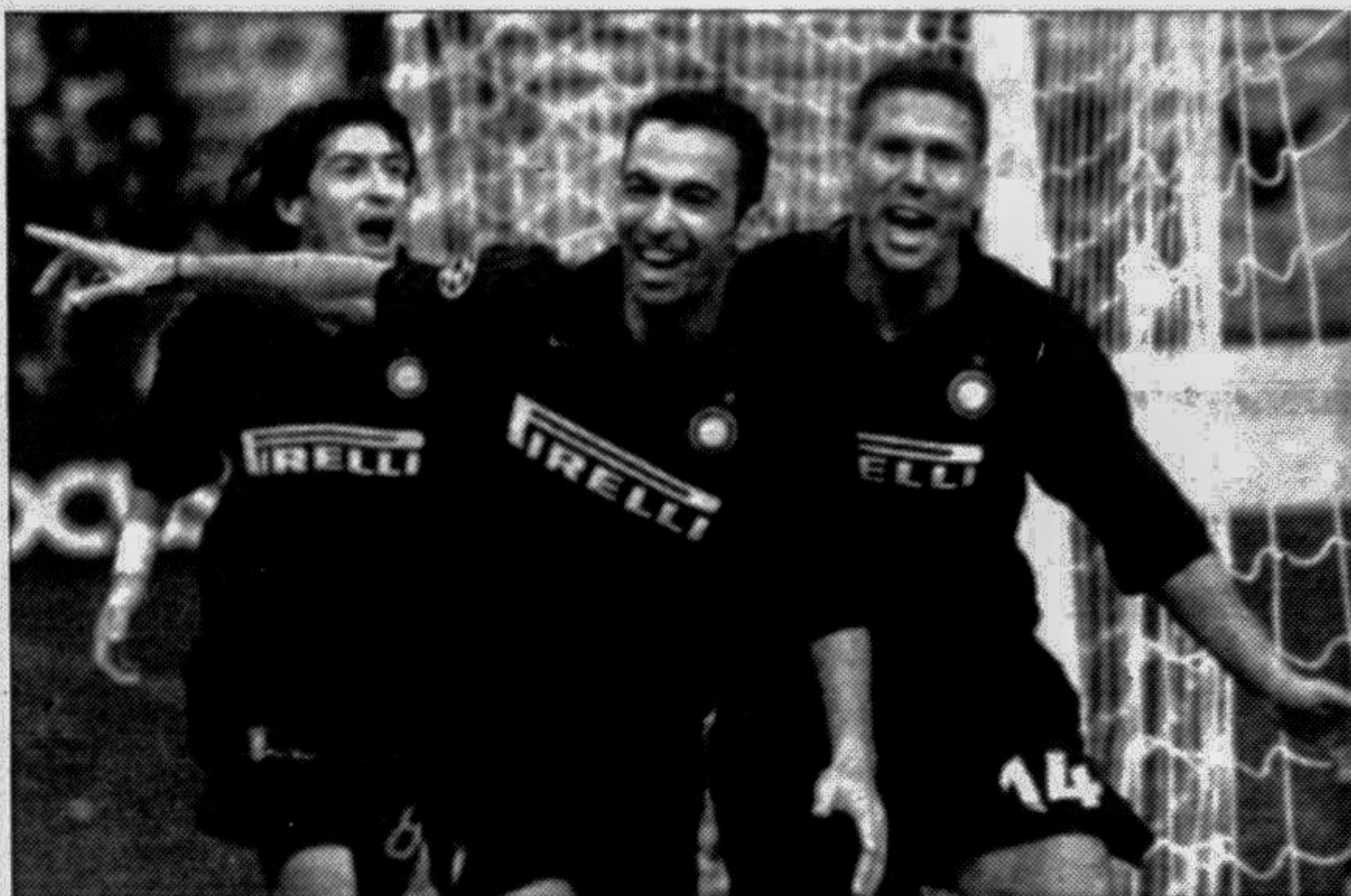
HIP HIP YOURI! Inter Milan's French international Youri Djorkaeff (C) being chased by ecstatic teammates Chile's Ivan Zamorano (L) and Argentina's Diego Simeone after he has scored a last minute winner against Austrian side Sturm Graz in a Champions League fixture at Milan on September 30.

But just when it appeared United had got the points, up popped Elber.