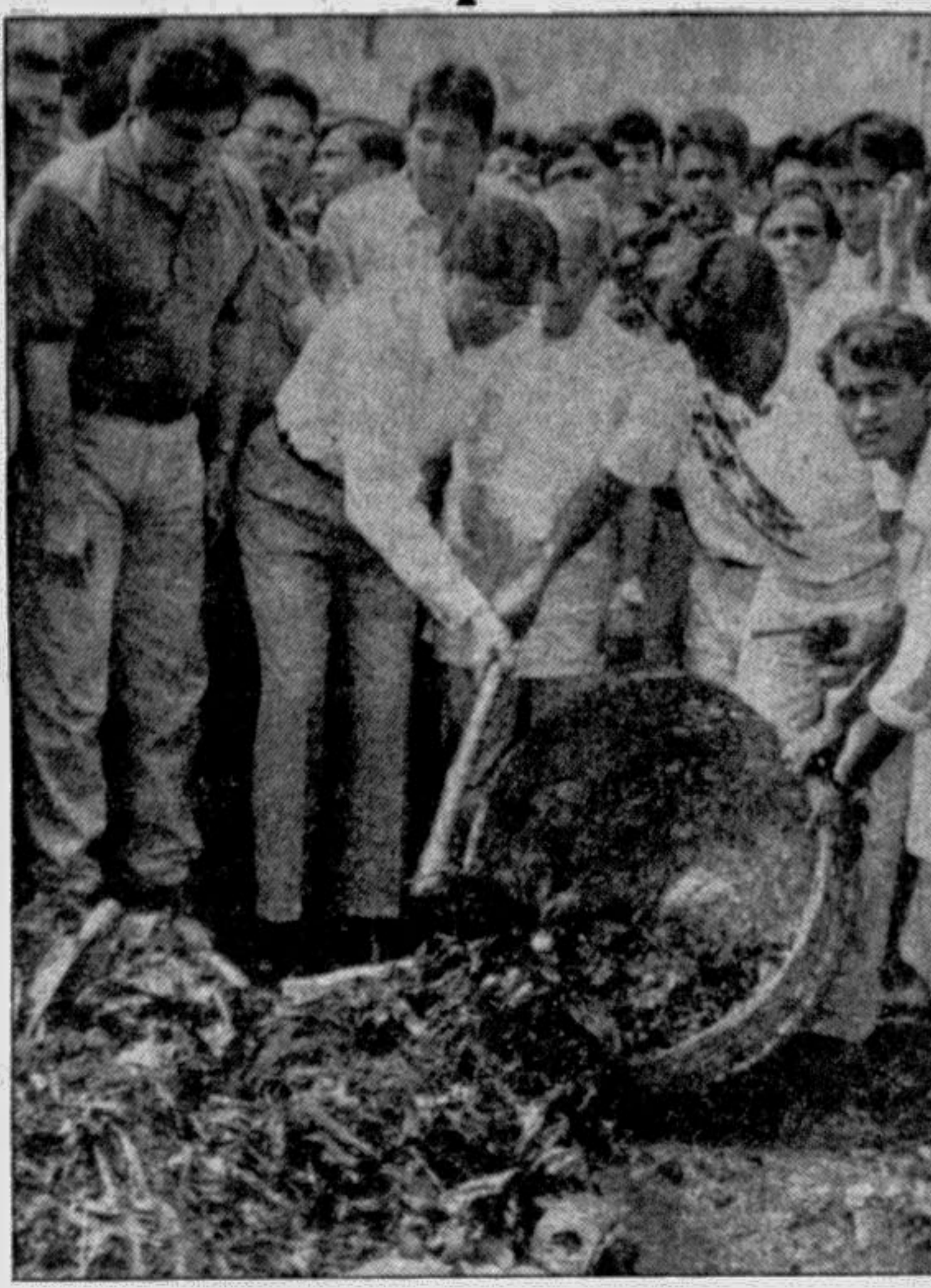
DCC Mayor Mohammad Hanif giving a hand with the post-flood cleaning-up drive in the city yesterday.

The new web site, at http://www.dfat-maeci.gc.ca/dhaka/ , contains an array of useful information covering Canadian trade, commerce, culture, education, tourism and immigration, as well as information on the activities of the Canadian International Development Agency (CIDA).