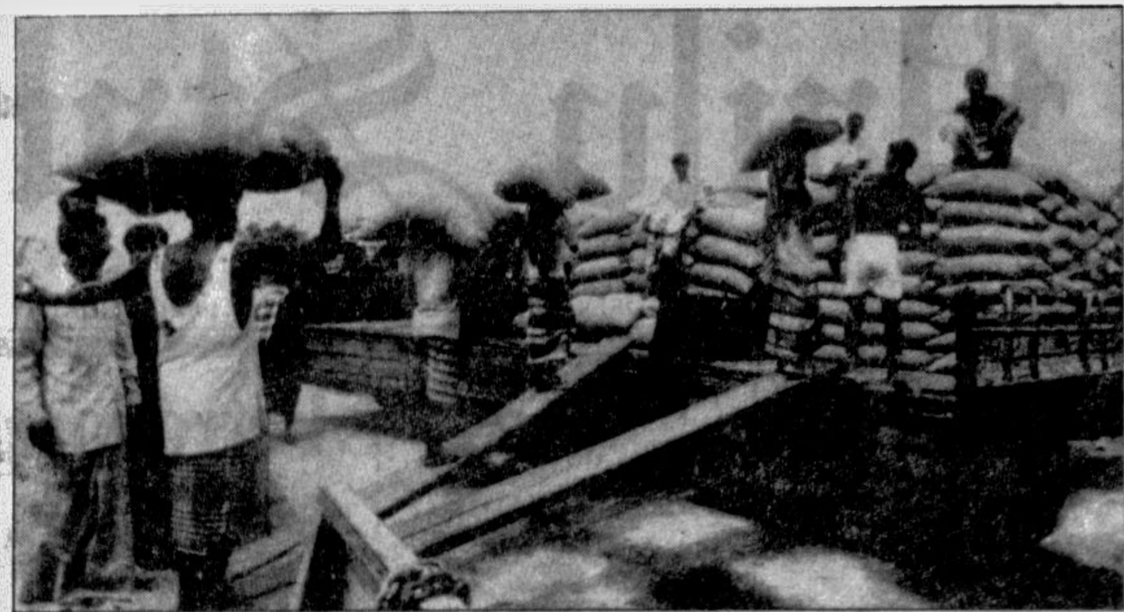
Rice imported from India on emergency basis being carried to godown at Mill Barrack yesterday.