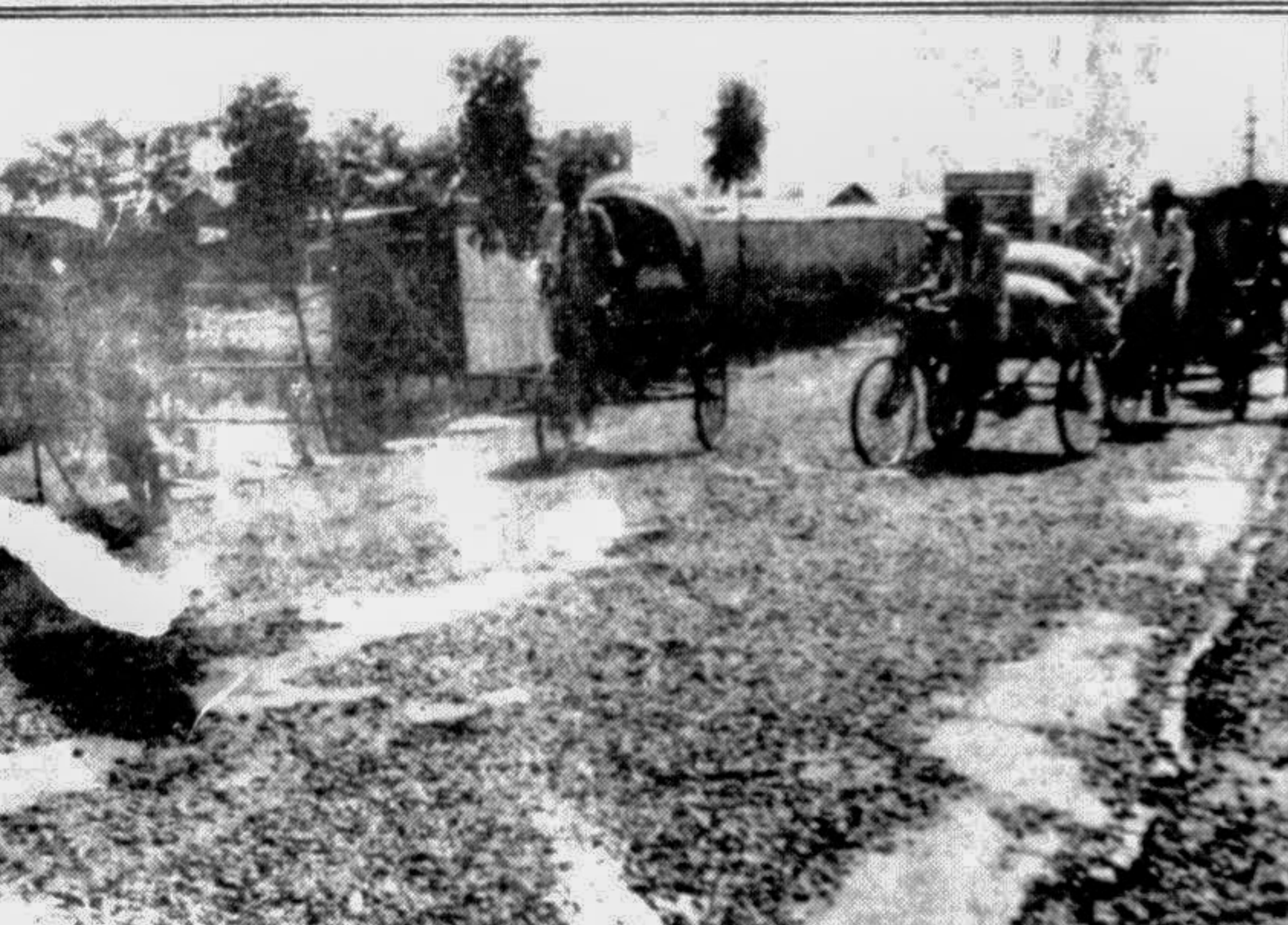
GOPALGANJ: Dilapidated Dhaka-Khulna highway near Gopalganj Natun Bazar. Flood has damaged the highway very badly. The highway is now unfit for use.

fall short of target by 1.278 metric tons, but seeds of high yielding variety was sold to recover the loss. Besides, the production target for next 'Rabi' season has been fixed at 42,000 mts more to overcome the food deficit. A local agriculture expert informed that more lands will be brought under HYV crops, pulse and wheat cultivation and diversified crop cultivation programme. Moreover, the growers will be motivated to use compost fertilisers on their lands for yielding maximum production. A report from Sunamganj says: A total of 4,53,659 people of 83 unions here have been affected by the recent devastating flood. Local administration sources said, some 6044 dwelling houses have so far been damaged completely and 30,289 partially. Standing crops on 4,256 hectares of land damaged completely and crops on 9,499 hectares damaged partially. Forty kms road damaged completely and 1,319-km partially, 19-km dam damaged completely and 294-km damaged partially. Besides, some 195 bridges-culverts, 699 educational institutions, 146 mosques and temples have been affected by the prolonged flood in the district.