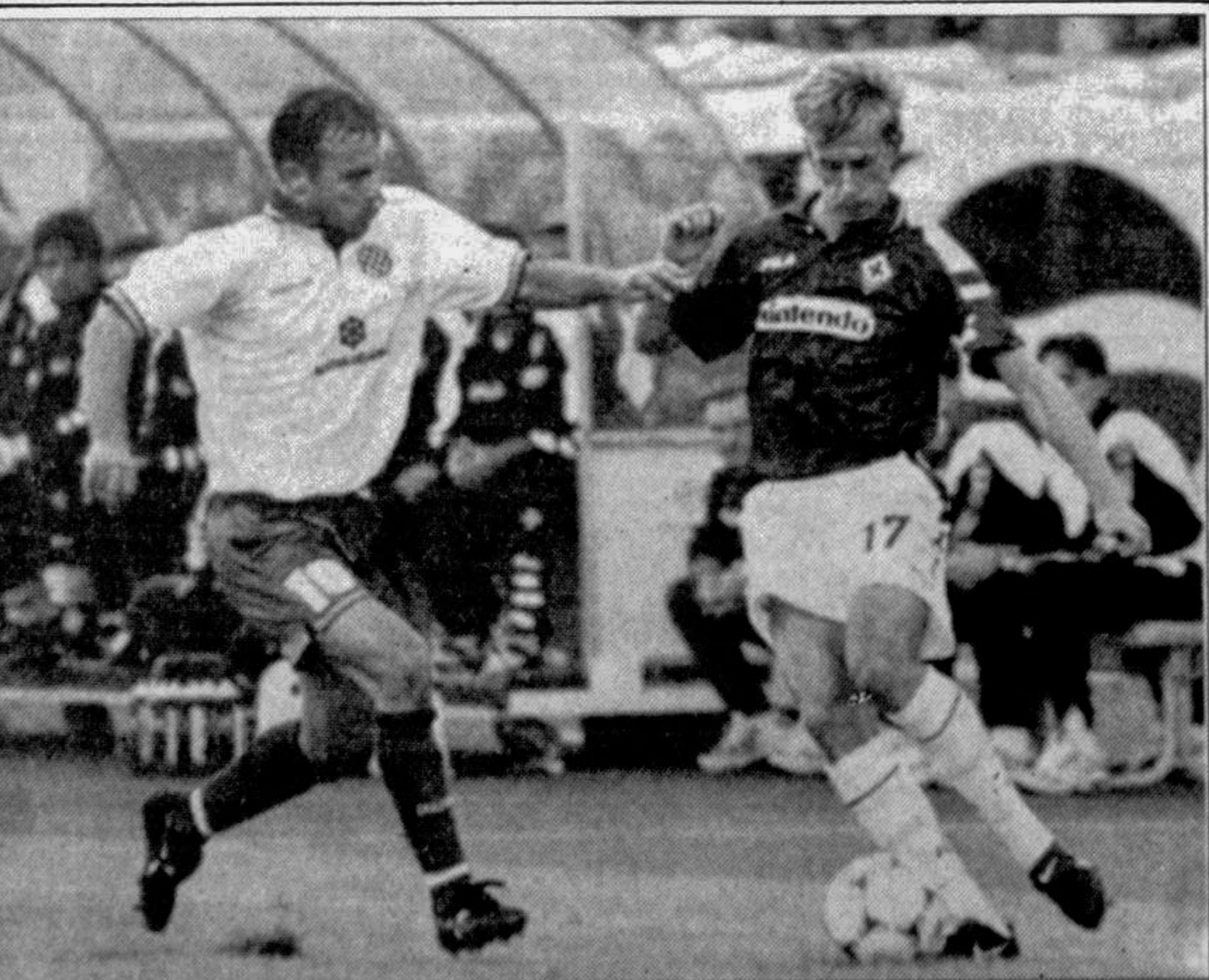
Fiorentina's German international Joerg Heinrich (R) tries to keep possession while a Hajduk Split player prepares to challenge during their UEFA Cup first round second leg encounter at Split on September 29. The game ended 0-0 giving Fiorentina a 2-1 aggregate win.

On artificial 1 Club by South, partner's response showed 0-6 HCP. East intervened with 2 Diamonds, and South bid 2 No Trumps. Under the system followed he could not bid 4-card suit although he held 4 cards in Spades and Clubs.