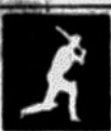
RAWALPINDI, Pakistan, Sept 30 (Reuters/Internet): Australian captain Mark Taylor will be hoping to rewrite his personal record book and Test match history when he leads his team out in the first of a three-match series against Pakistan starting on Thursday.

Taylor is bidding to be the first Australian captain to win a Test series in Pakistan in 39 years and erase memories of the pair he scored on his side's last visit here in 1994/95.