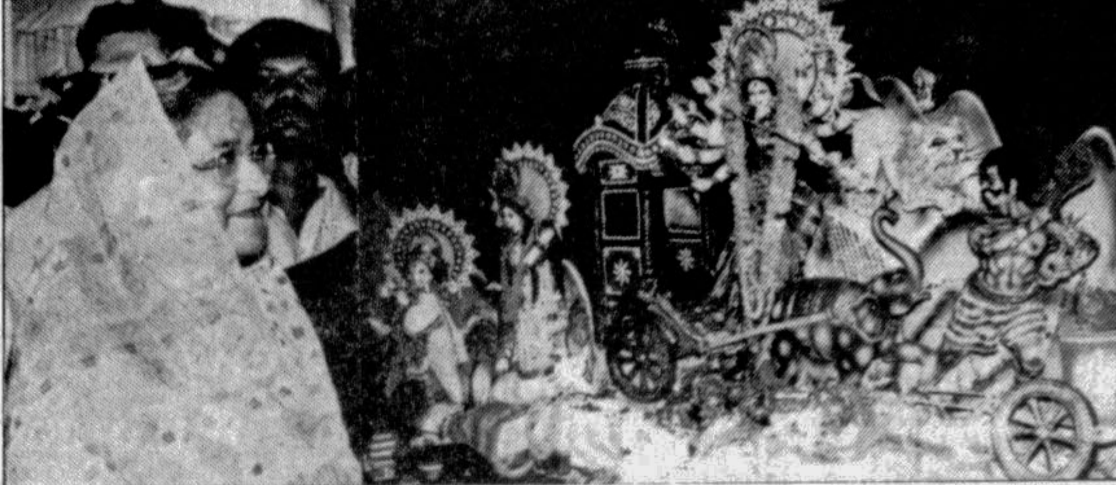
Prime Minister Sheikh Hasina visited puja mandap at Dhakeswari Mandir in the city yesterday.