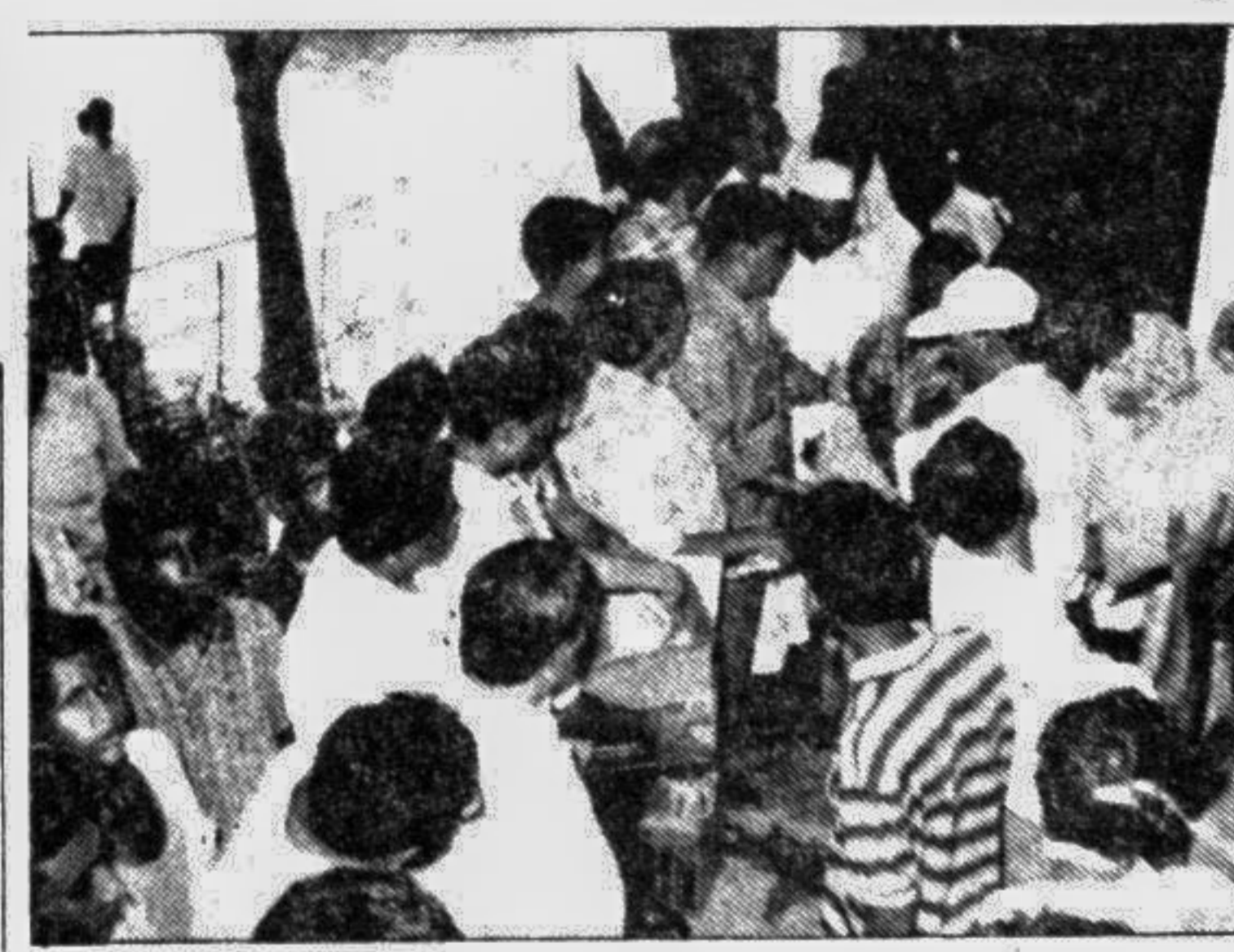
Bangladesh Scouts Dhaka Metropolitan distributed 250 kg of rice, 1000 pieces of clothes, and 300 packets of oral saline among the flood victims at Kachkura High School shelter yesterday.