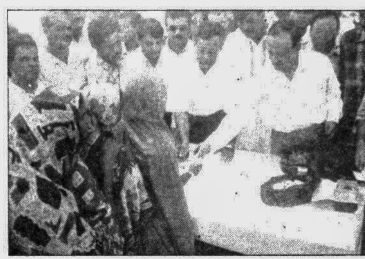
DAB organised a medical camp for flood victims in Savar recently.