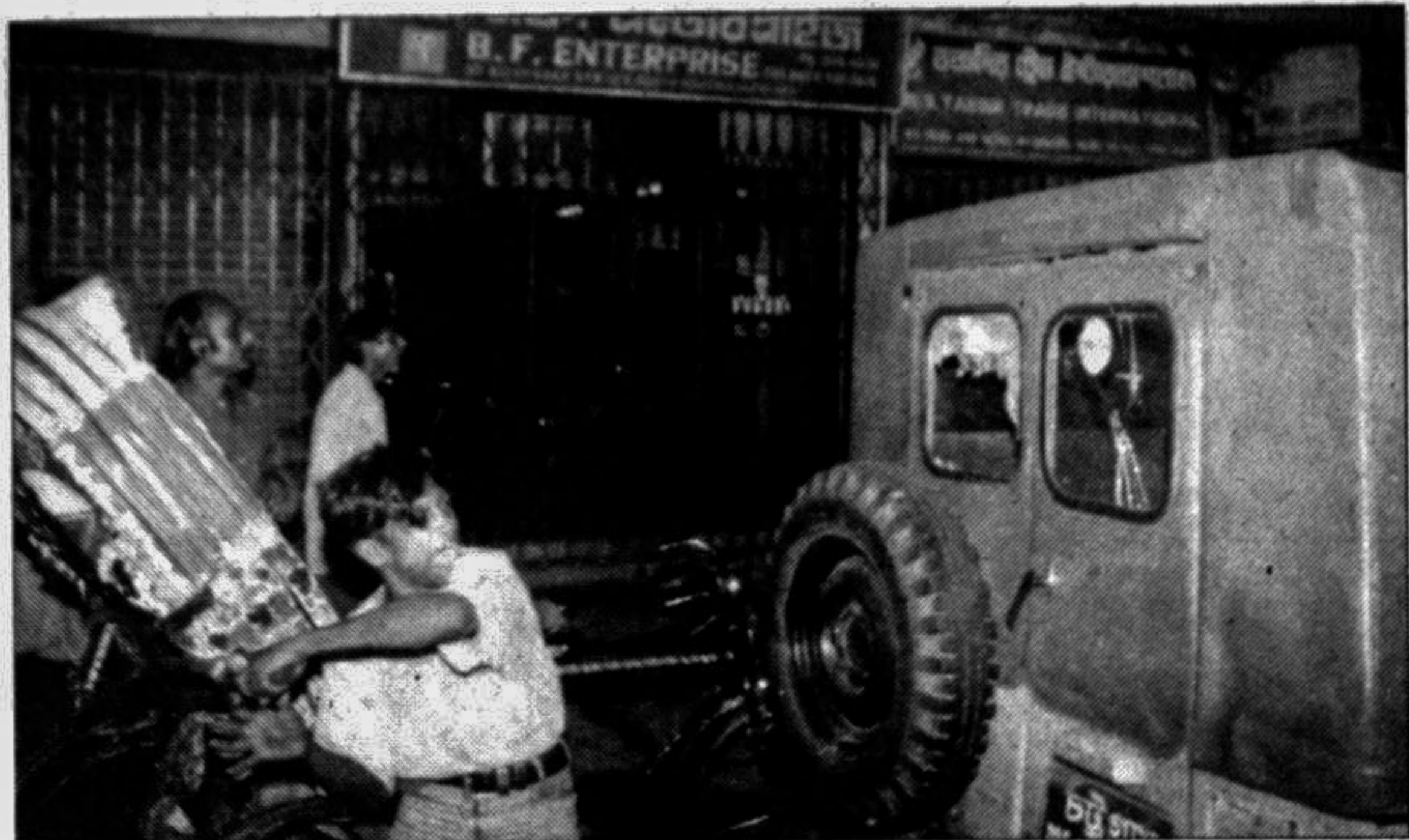
An activist seen attacking a police van after police resorted to lathi charge on a BNP procession in the city's Purana Paltan area yesterday.