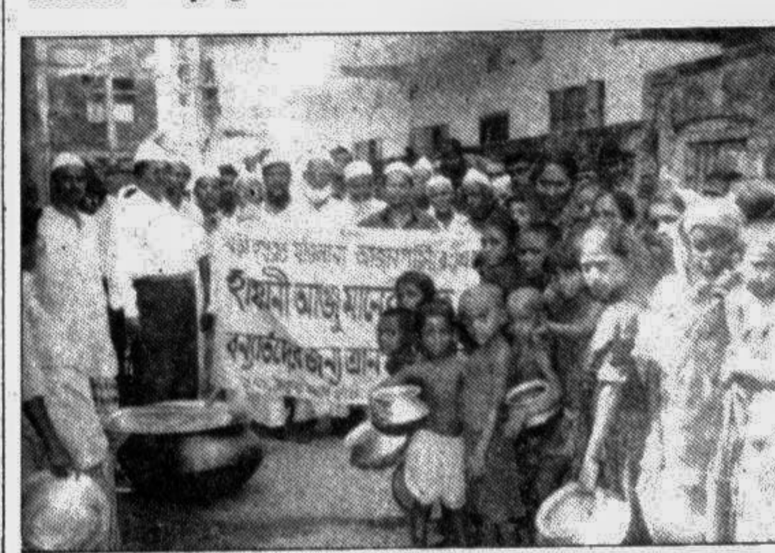
Revival of Islamic Heritage Society, Bangladesh office, organised a medical camp for flood affected people of Bhasanek recently. The relief operation was funded by the 'Patients Helping Fund-Kuwait'.