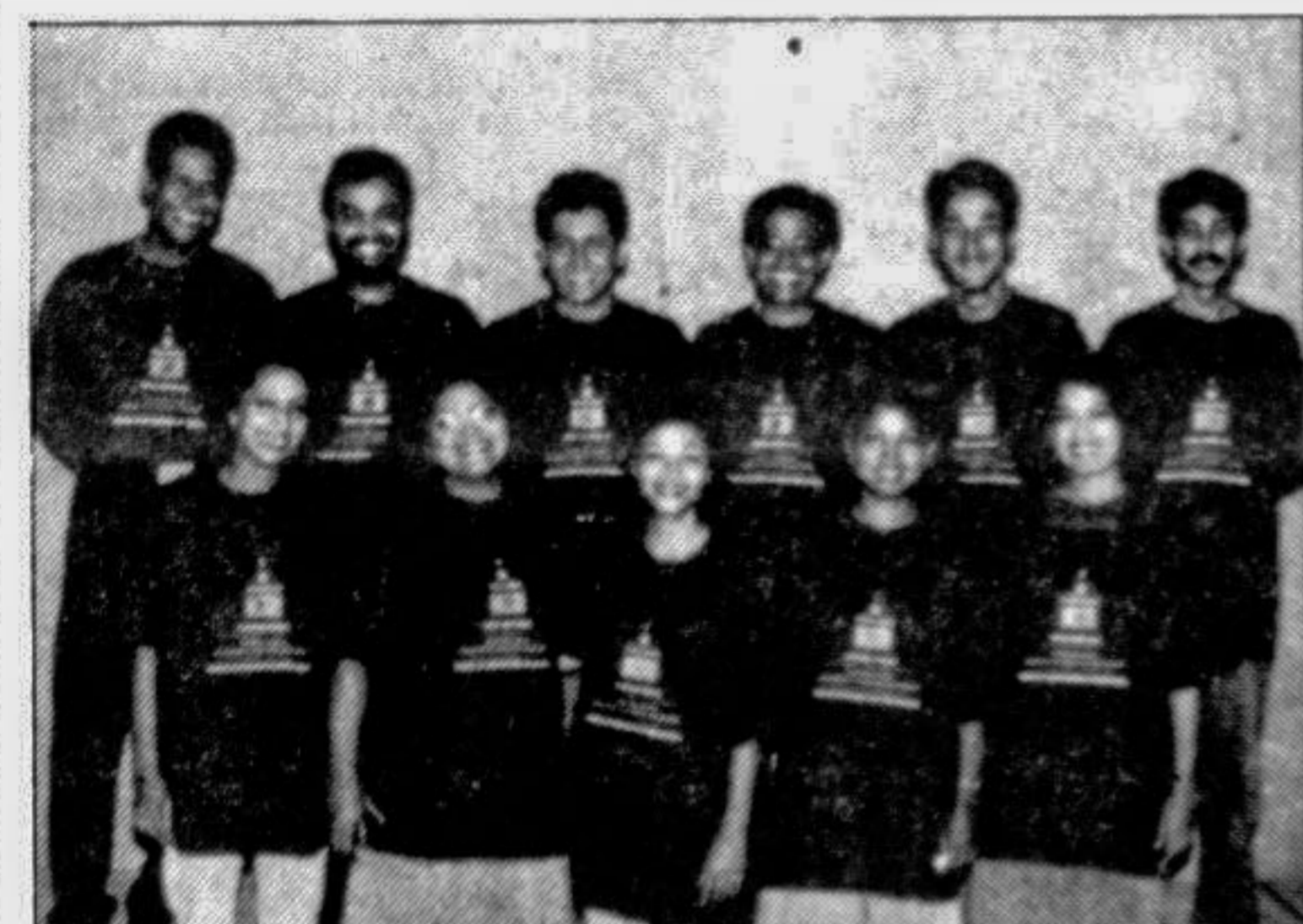
The team members of Loko natyadal, a theatre group, who will take part in the international drama festival in Cuttack, India.