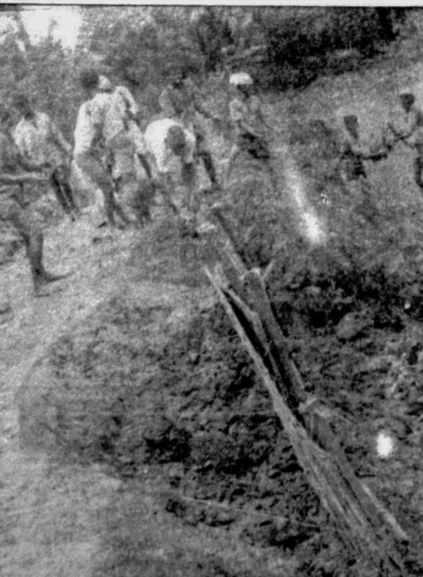
NOAKHALI: Local villagers recently worked round-the-clock to repair the dam of Kaluai Multipurpose Rupali Irrigation project which was affected by flood. The project covers 300 acres of land at village Kaluai in Number 2 Nadona union of Begumganj thana.