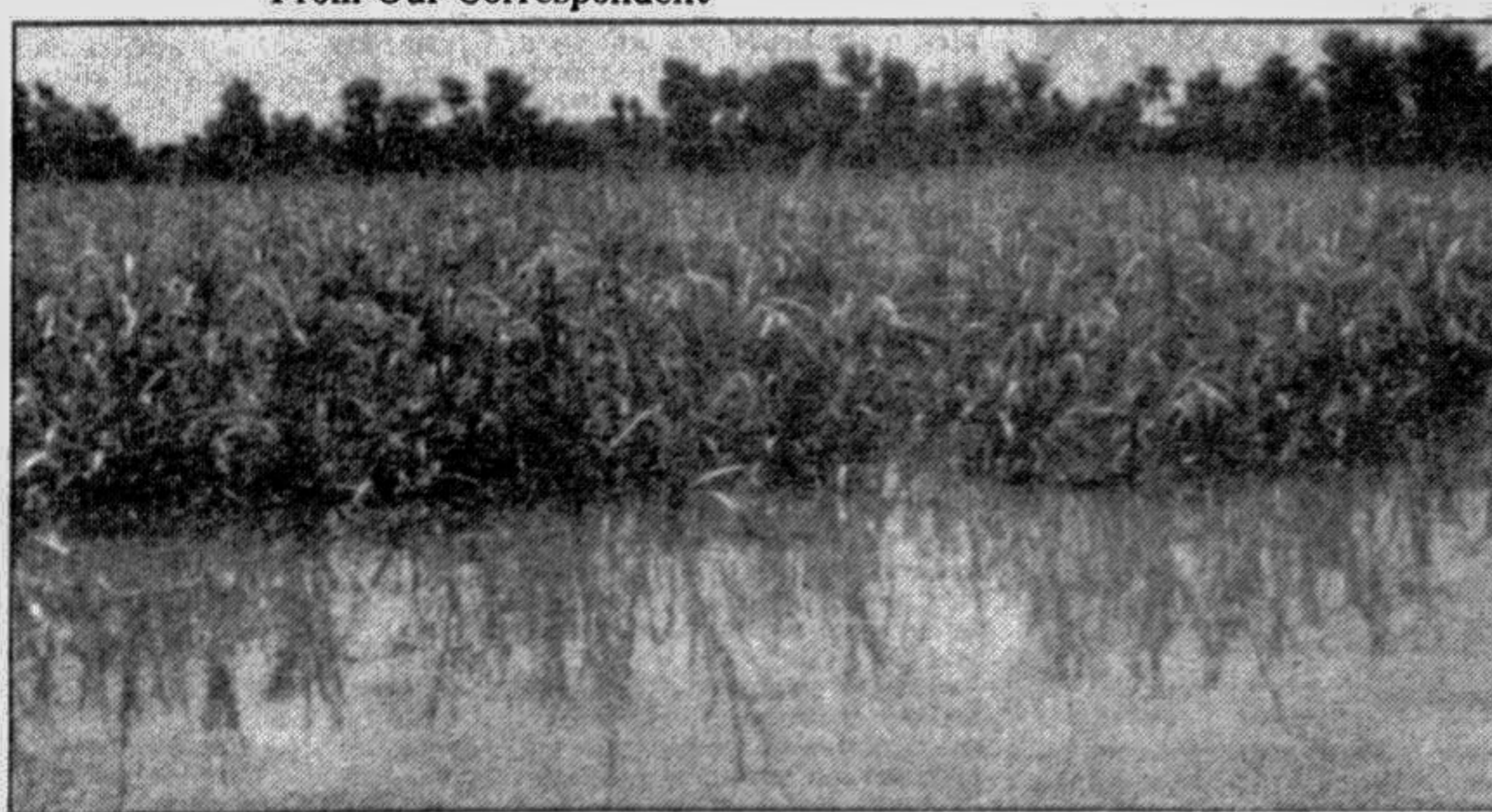
NATORE: A sugarcane field in Ektala area in the town is still under flood water.

An official of Nature Sugar Mills told this correspondent that the producers were making profit by selling crops to the molasses producers. But the mills would suffer very badly due to shortage of cane when the mill starts crushing in late October this season, he added. As a result, the official said, the mills may not recover the crop loan of Tk 15 lakh given to the