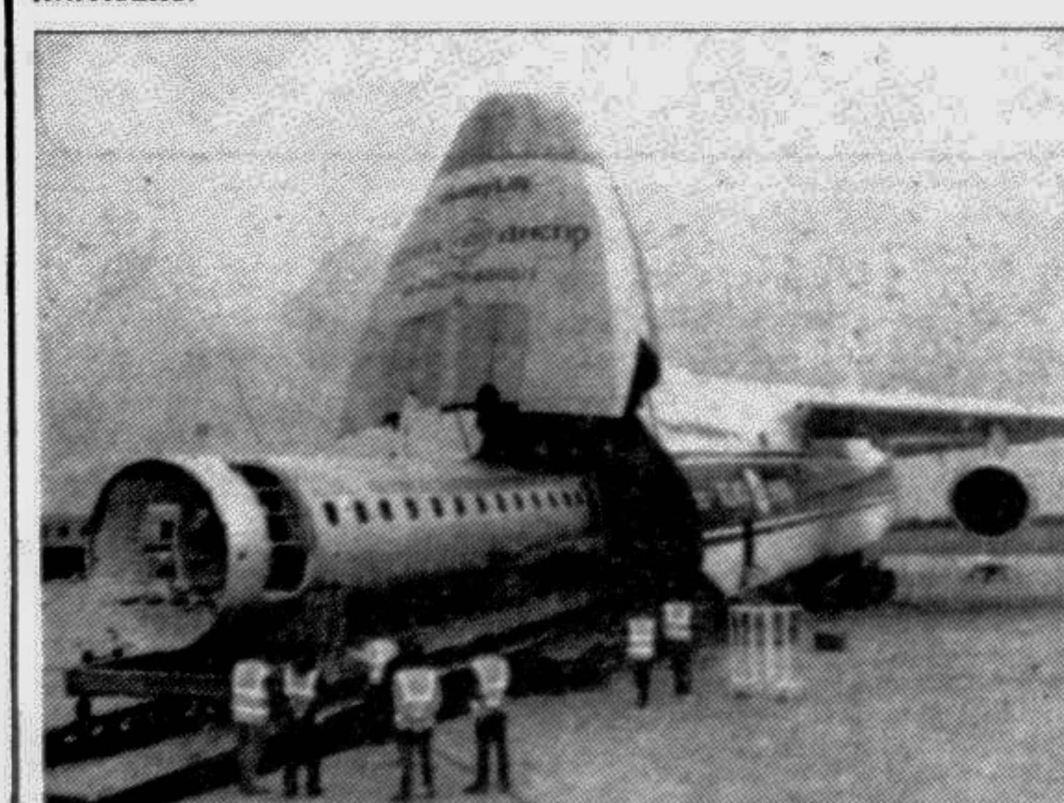
The first fuselage for the new Bombardier Aerospace CRJ Series 700 aircraft leaves Belfast Monday for Montreal, where it will join the aircraft's final assembly line. The 17.9 metre-long fuselage is being transported in an Antonov aircraft.

The declaration means federal funding will be available to individuals and local government in the areas devastated by the hurricane.