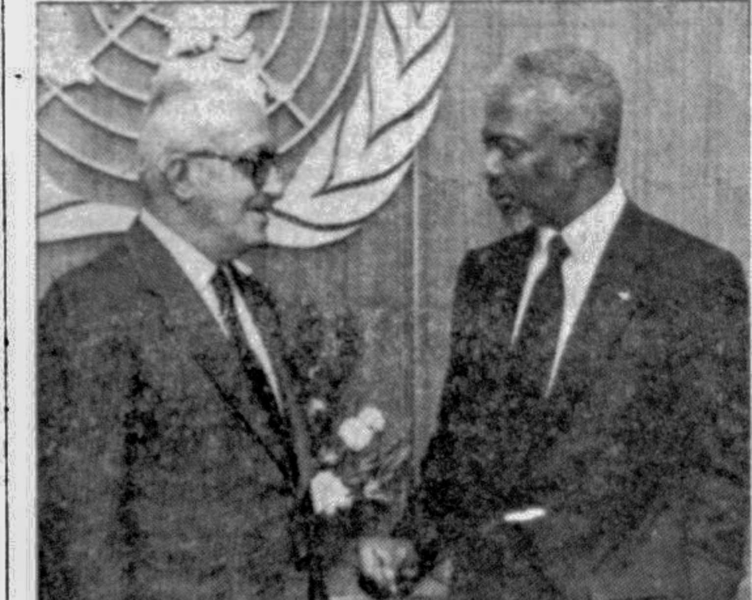
Iraq's Deputy Prime Minister Tariq Aziz, left, talks with United Nations Secretary-General Kofi Annan, at UN headquarters, Monday. The Secretary-General met today with an Iraqi delegation led by Aziz to discuss the 7-week-old stalemate with Baghdad over arms inspections.

Police said he was an influential figure in Al Qaeda, the organization of Bin Laden, the Saudi exile wanted by US authorities for allegedly coordinating simultaneous attacks on American embassies in Nairobi, Kenya, and Dar-es-Salaam, Tanzania.