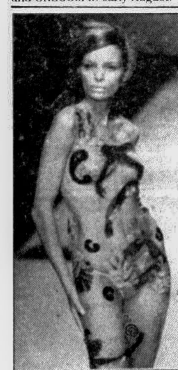
A model wears a sheer see-through dress by British designer Bella Freud during her fashion show in London Monday. Freud's show was part of London Fashion Week, where designers are showing their Spring/Summer 1999 collections.

The standoff between Iraq and the United Nations came when Iraq announced to suspend its cooperation with the UN weapons inspectors after talks collapsed between Iraq and UNSCOM in early August.