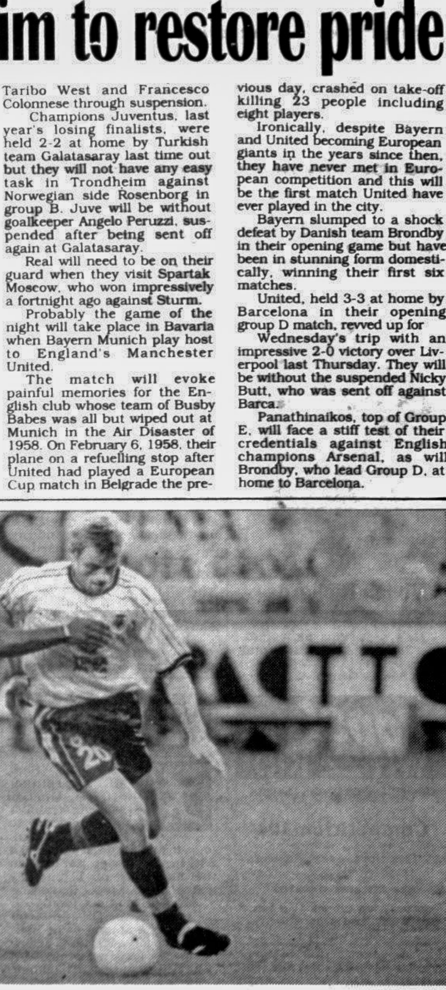
Action from the Spanish Premier league match between Salamanca and Villarreal on September 27. The locals thrashed Salamanca 5-0.

Panathinaikos, top of Group E, will face a stiff test of their credentials against English champions Arsenal, as will Brondby, who lead Group D, at home to Barcelona.