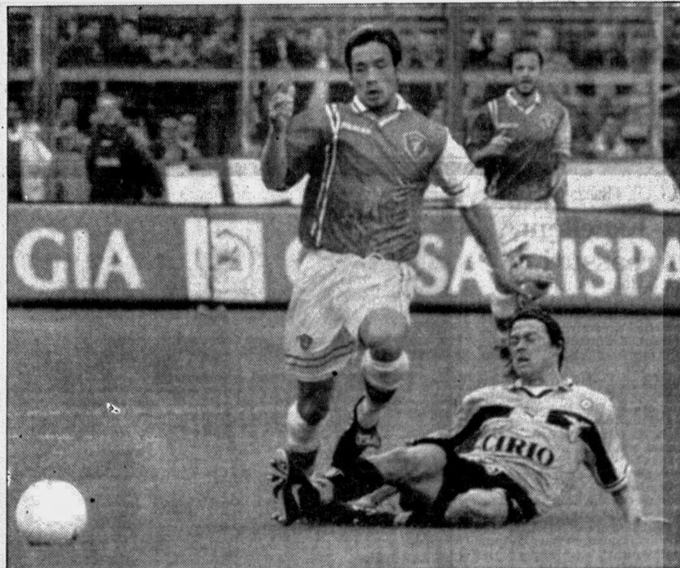
ASIA'S TORCHBEARER: Perugia's Japanese international Hidetoshi Nakata in full cry against Lazio during a Serie A fixture on Sunday. The game ended 2-2.

Wi Bok-Sun followed her with a 21-10, 21-15 win over Elmira Zainabudinova and Tu Jong-Sil completed a 3-0 victory in the best-of-five battle beating Valentina Uspanova 21-12, 21-11.