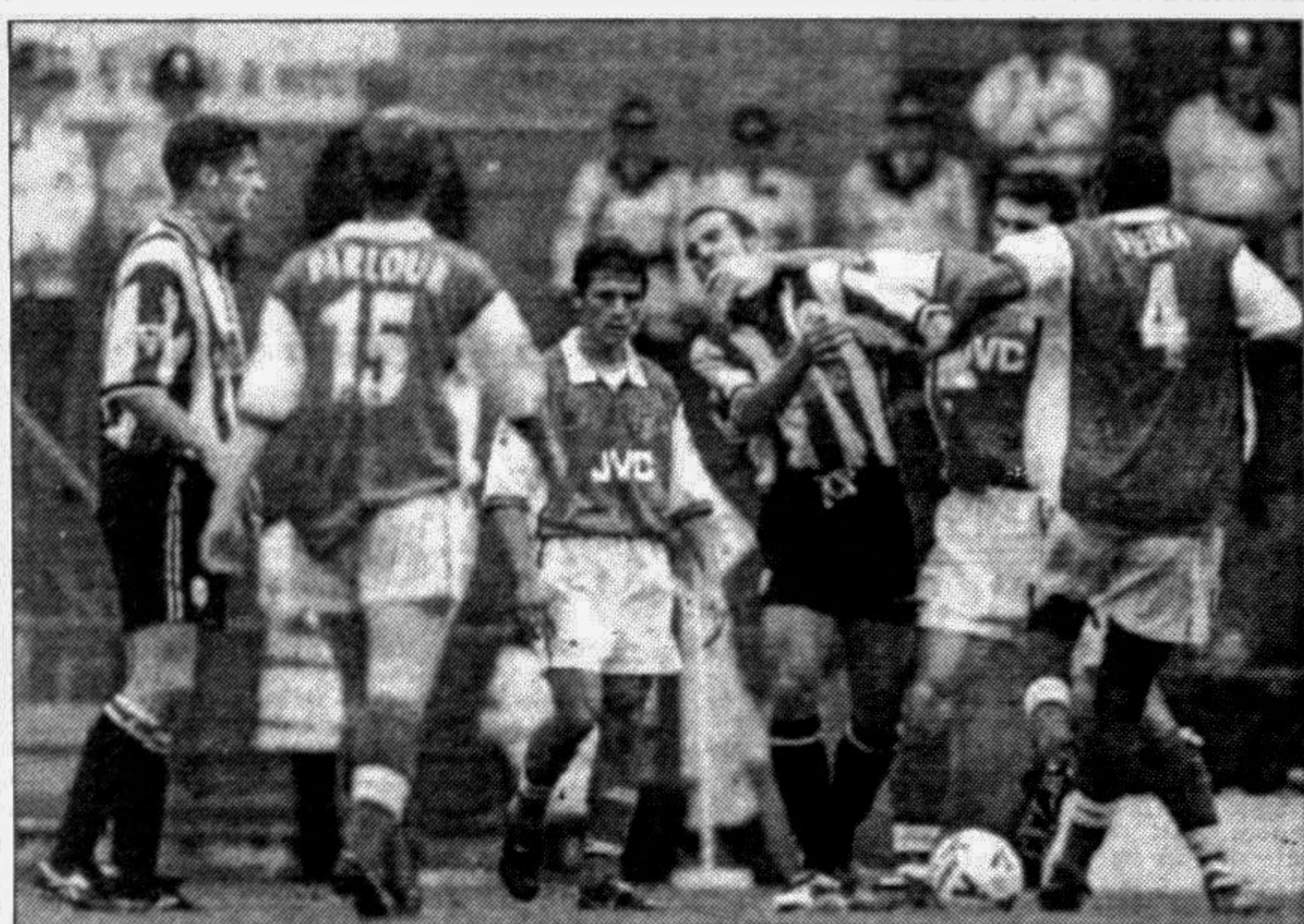
Arsenal's Martin Keown (2nd from right) clashes with Paolo di Canio of Sheffield Wednesday during their Premiership match yesterday.

But his condition has deteriorated, and Hodgson said: "Kevin has gone into hospital. It's a throat infection of some sort or other, but he is not well at all. We will wait to see what the medical people say."