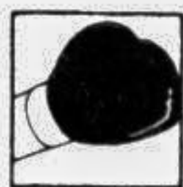
beat Lennox Lewis. Yet he wishes the WBC champion wasn't fighting Zeljko Mavrovic.

"Stylistically this is the worst fight for Lennox," Steward said. "Mavrovic is a very technical fighter."