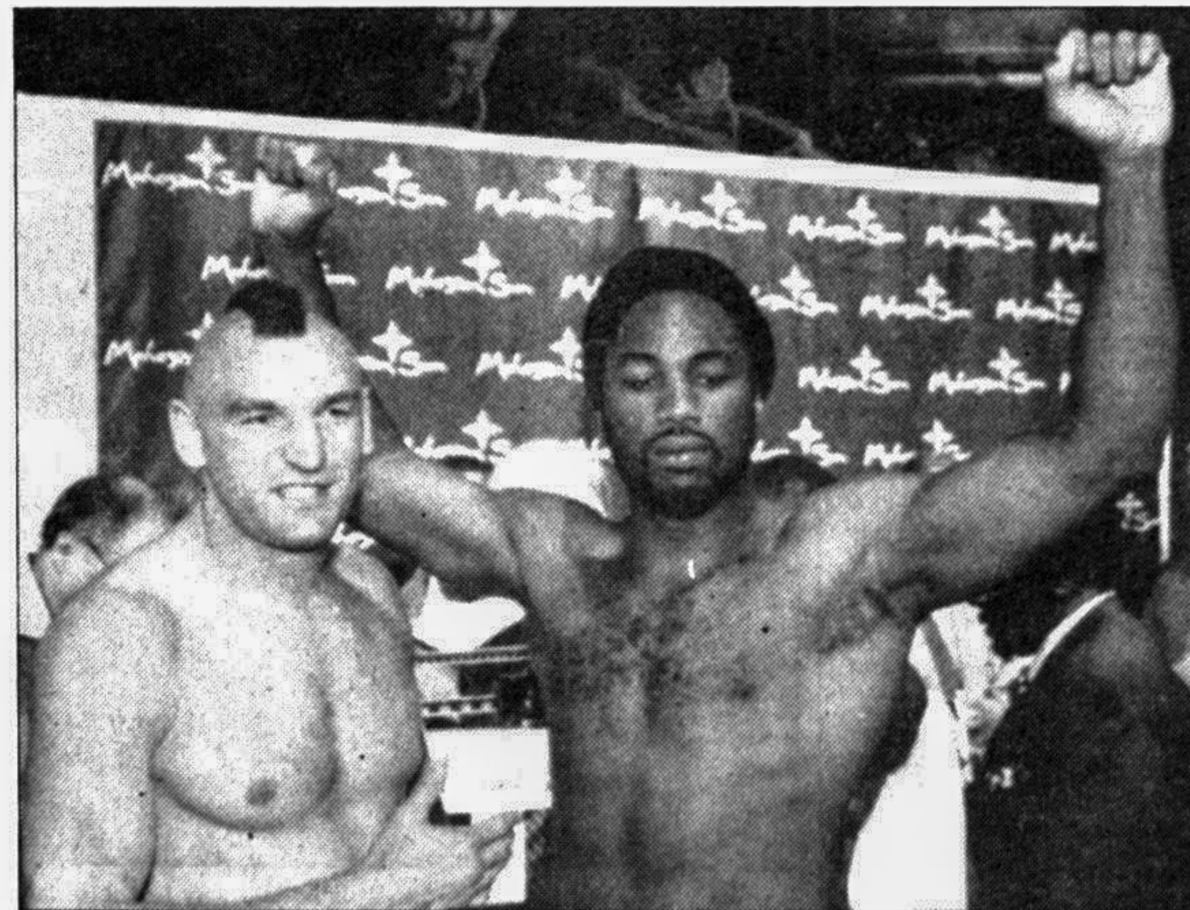
Lennox Lewis (R) and his challenger Zeljko Mavrovic pose after the weigh-in at Mohegan Sun Casino in Connecticut on September 25.

My main goal is not to allow him to capitalise on any mistakes I make," said the 6-foot-5 (2.88-metre) Lewis, who weighed in Friday at 243 pounds (109.4 kilograms). Mavrovic, 6-4 (2.84-metre), weighed 214 1-4 pounds (96.5 kilograms).