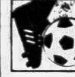
ZURICH, Sept 26: The 2002 World Cup might begin earlier and feature a significant rule change designed to reduce the number of shootouts, reports AP.

FIFA, soccer's world governing body, said Friday the 2002 event, with Japan and South Korea serving as hosts, would remain in the customary period of June and July, but may open earlier in June.