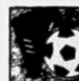
UNDATED, Set 26: Bordeaux swept to their sixth win in seven games Friday.

Leading Rennes 4-0 to extend their lead at the top of the French First Division to four points, reports AP.