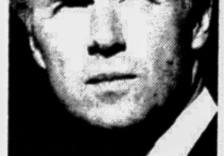
FRANZ BECKENBAUER has his priority, Stielike said. "As long as everybody's responsibilities are clearly defined it can only be a good thing."

Beckenbauer said he would let Ribbeck work in peace but the coach's assistant, former German international Uli Stielike, predicted the 1974 World Cup hero would soon turn his attention to the national side. "I guess the team will be