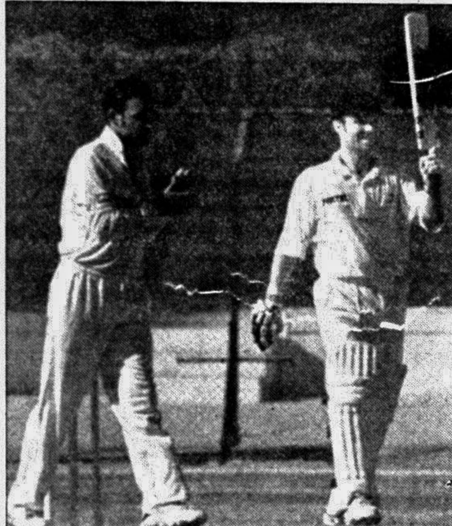
Australian opener Michael Slater is applauded by Karachi captain Aamir Sohail after the batsman reached a double century. Slater went on to make a career best 221.