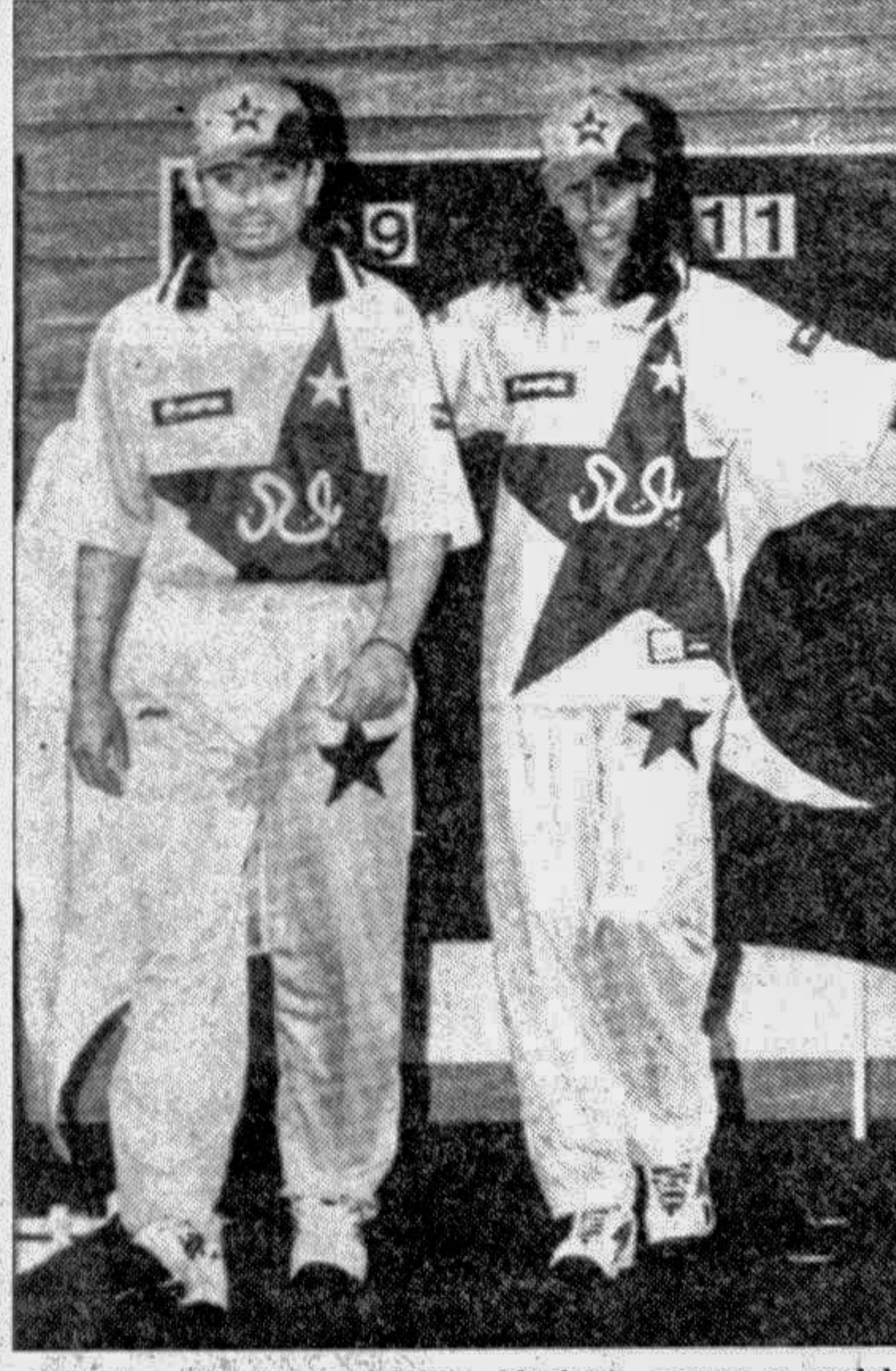
Pakistan off-spinner Saqlain Mushtaq escorts a model down the catwalk during a fashion show in London on Sept 24. The model is attired in a uniform to be worn by Pakistan at next year's cricket World Cup.

The World Cup starts in May next year and will be played in England, Wales and the Netherlands.