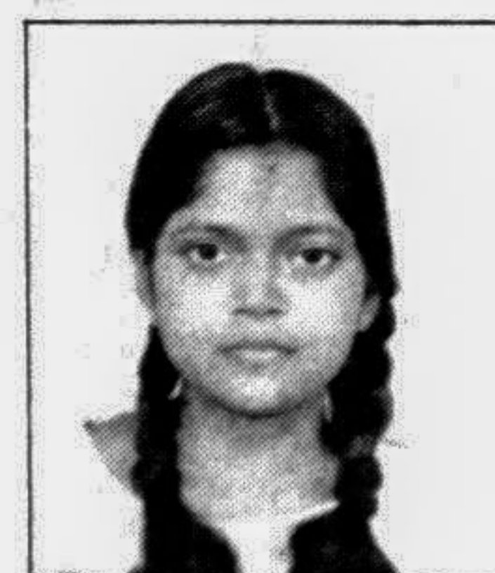
Esha Boost WHIZZ KID-101 winner