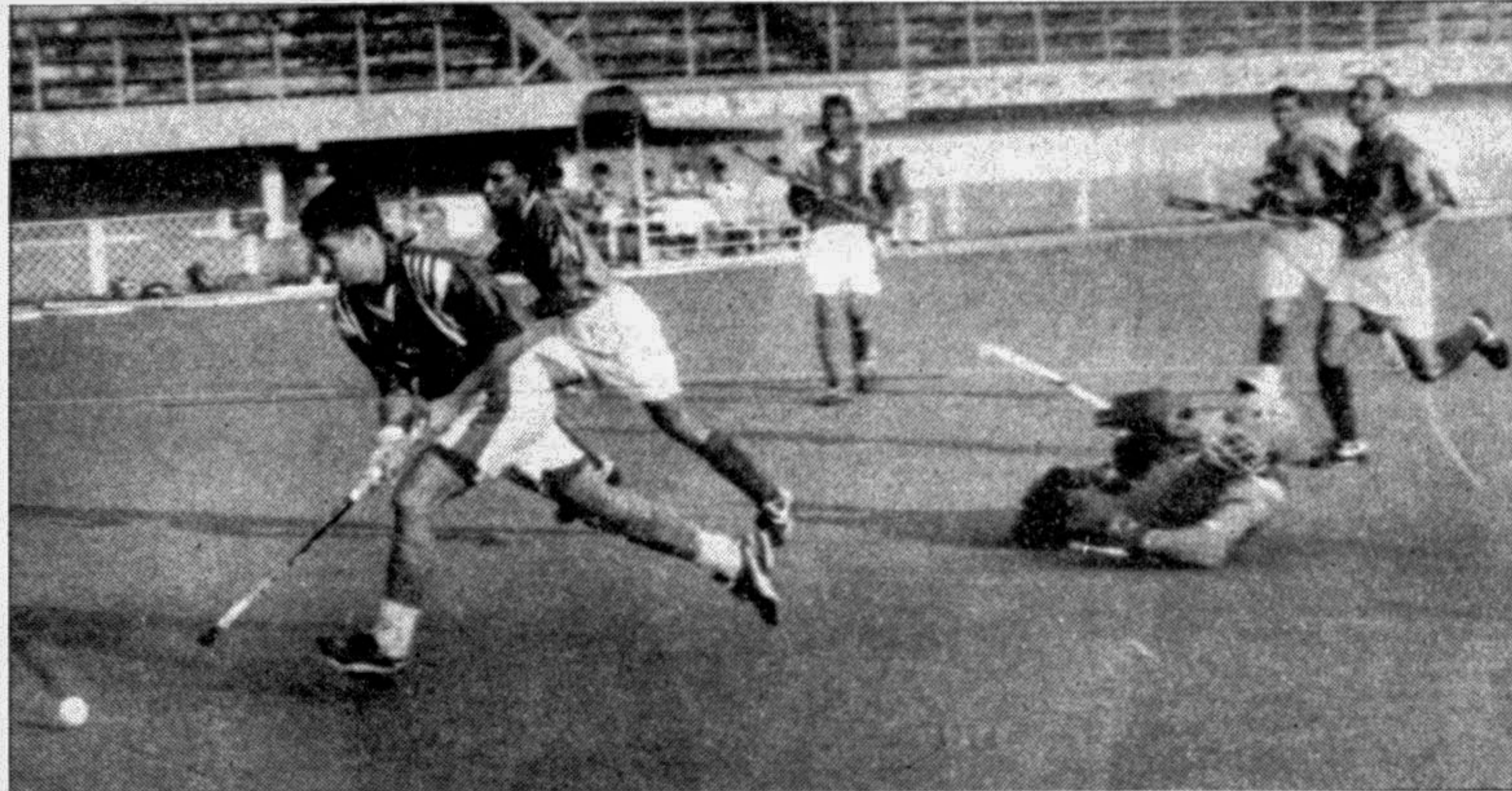
Action from yesterday's Green Delta First Division encounter between Bangladesh Ansars and Sonali Bank at the Moulana Bhasani National Hockey Stadium.