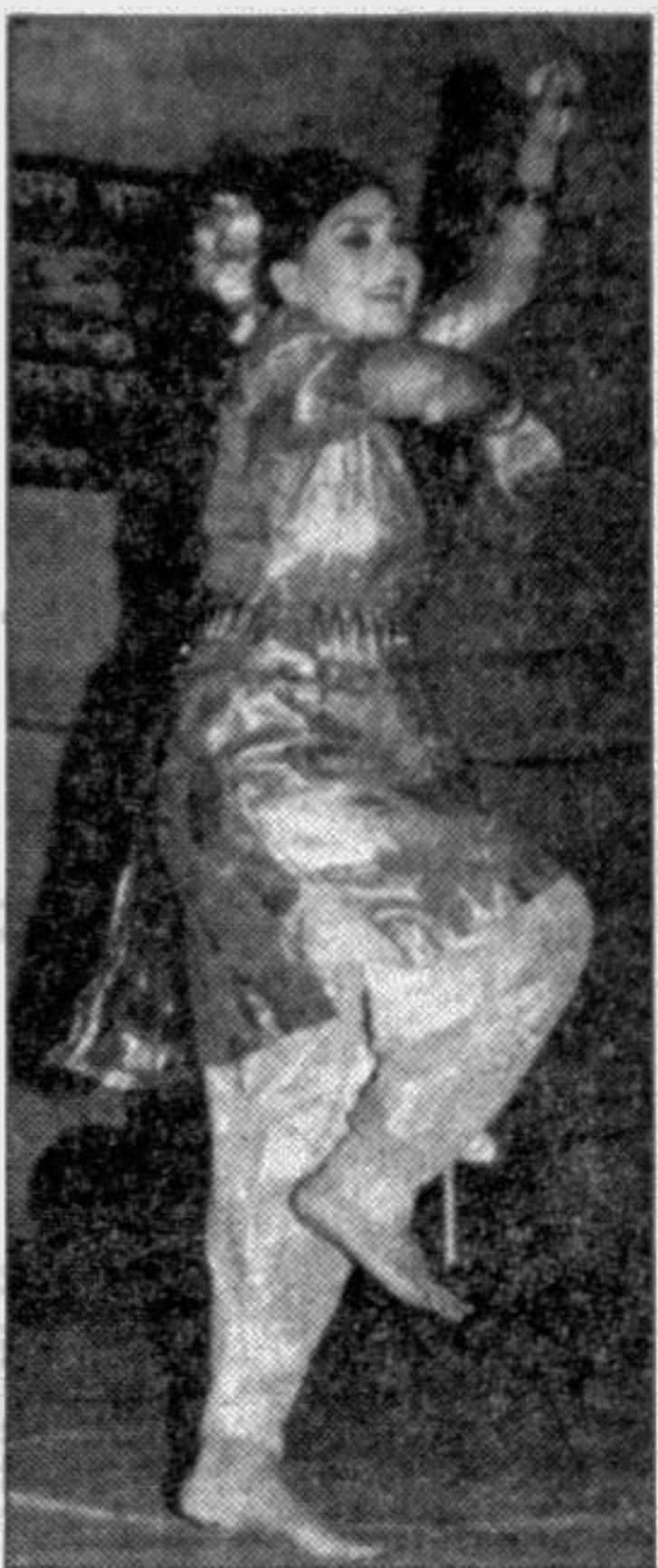
'Amra Baul' organised a cultural programme in the city in aid of flood victims yesterday.

The BHA leaders further urged the BCSIC authorities to expand the area of hosiery estate at Panchabati so that more hosiery units could be set up.