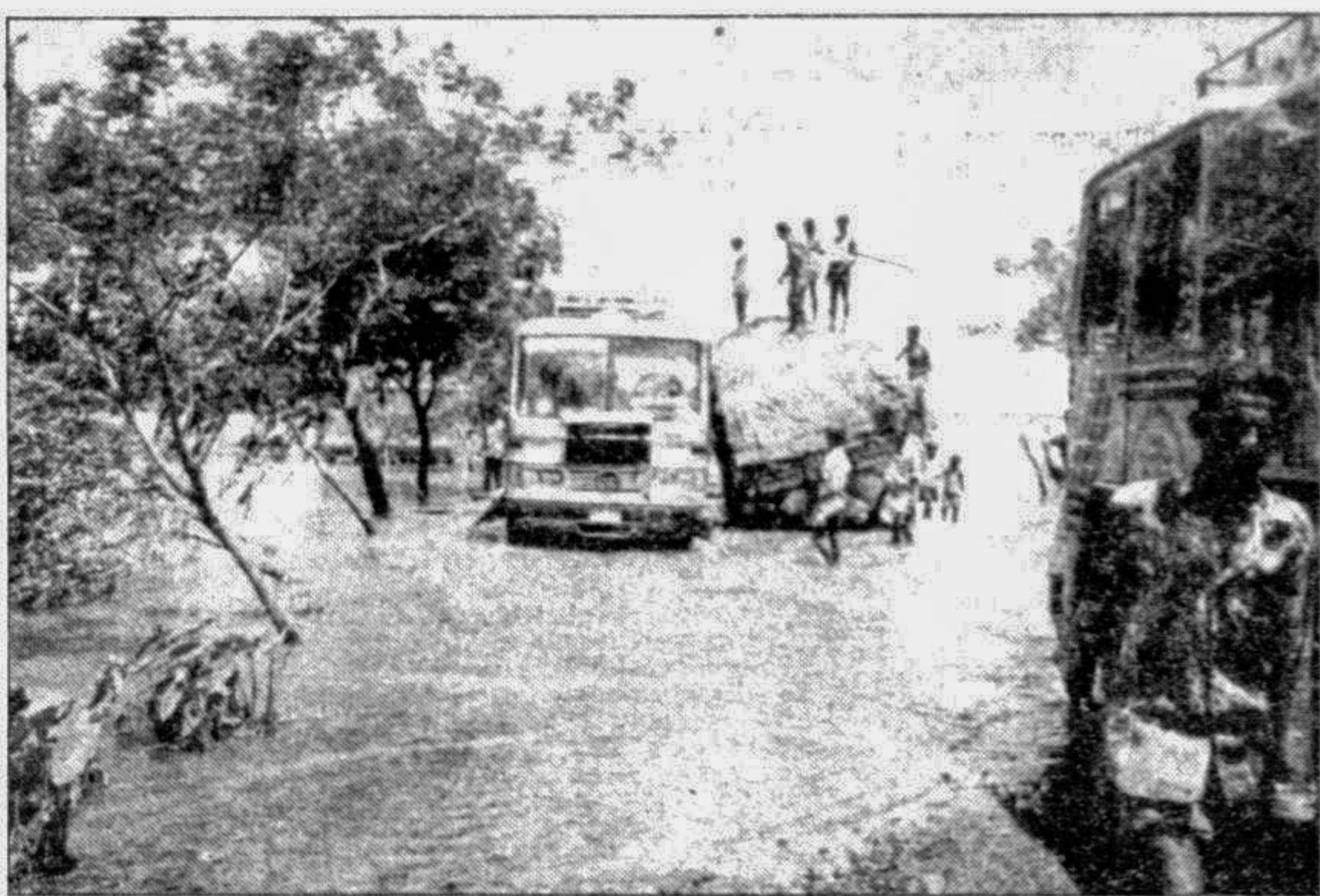
BRAHMANBARIA: Road communication between Brahmanbaria and Sylhet has been restored on Friday. Road link along this route remained snapped for about a month due to flood. About 8 km long distance from Shahbazpur to Chandura has been damaged very badly. Transport vehicles are now plying at a great risk along this damaged portion on Brahmanbaria-Sylhet highway.

Witnesses said Shambhu, 25, and Ajit, 23, of Bethali village in Shyamnagar thana came under attack of the man-eater while they were returning home after collecting shrimp prawn from a tributary of a river near the Sundarbans.