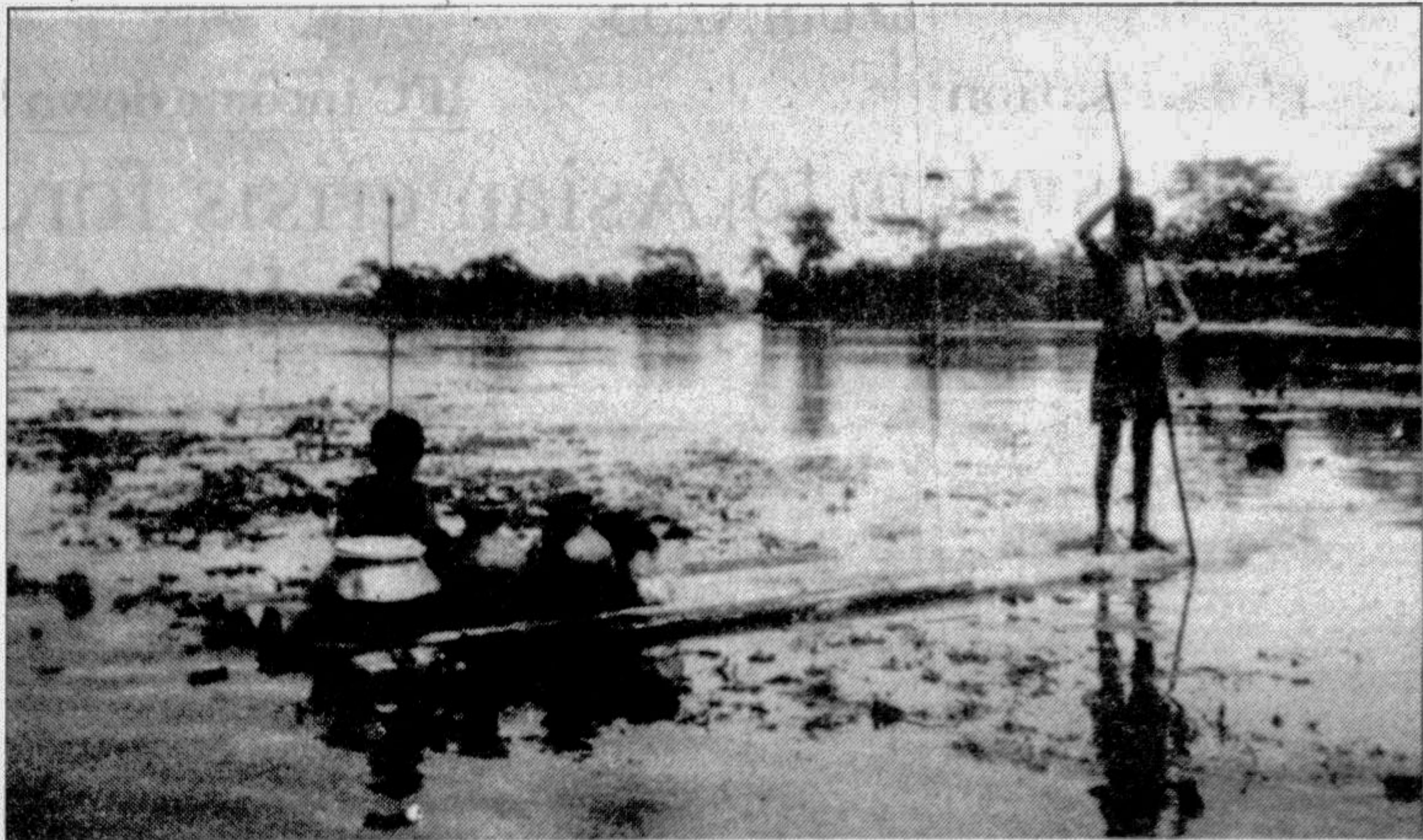
BARISAL: Flood waters have already started receding from the affected areas of the district. In some areas flood waters have remained stagnant. Recession of water from these places will take more time. In such an area two children on board a raft have set for bringing drinking water.

Official sources said, Taka three lakh, 2700 pieces of saree, 700 pieces of lungis and 1,000 pieces of used clothes have been received from Prime Minister's Relief and Welfare Fund. The ministry of relief and rehabilitation allocated 100 tonnes of rice, 200 tins of biscuit and a cash of Taka 75,000.