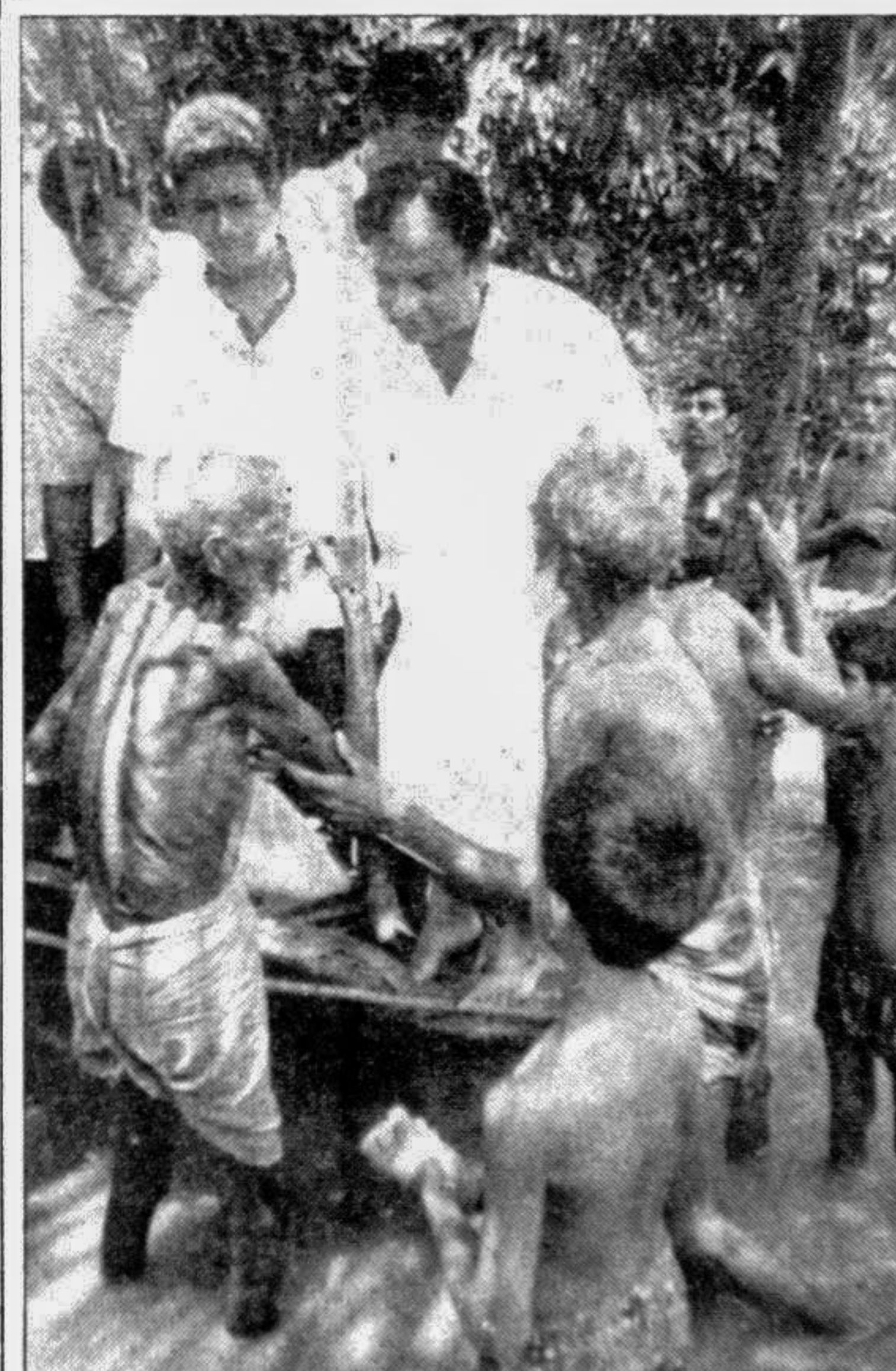
BRAHMANBARIA: Awami Jubo League leaders distributing relief goods among the flood victims in the district.

A large number of shelterless people have been passing their in sub-human condition since long. At present the erosion has taken a serious turn with the recession of river water.