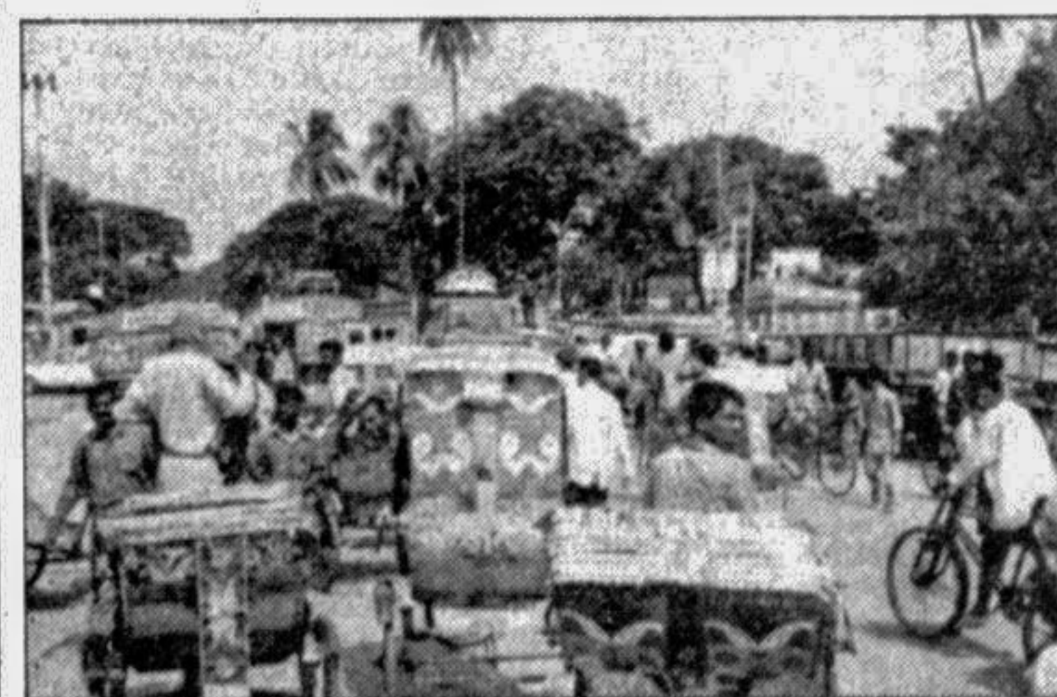
JHENIDAH: Rickshaws are creating a chronic traffic jam in the district.

They also gave relief to the flood victims in the areas affected by the erosion of Sureshwar river.