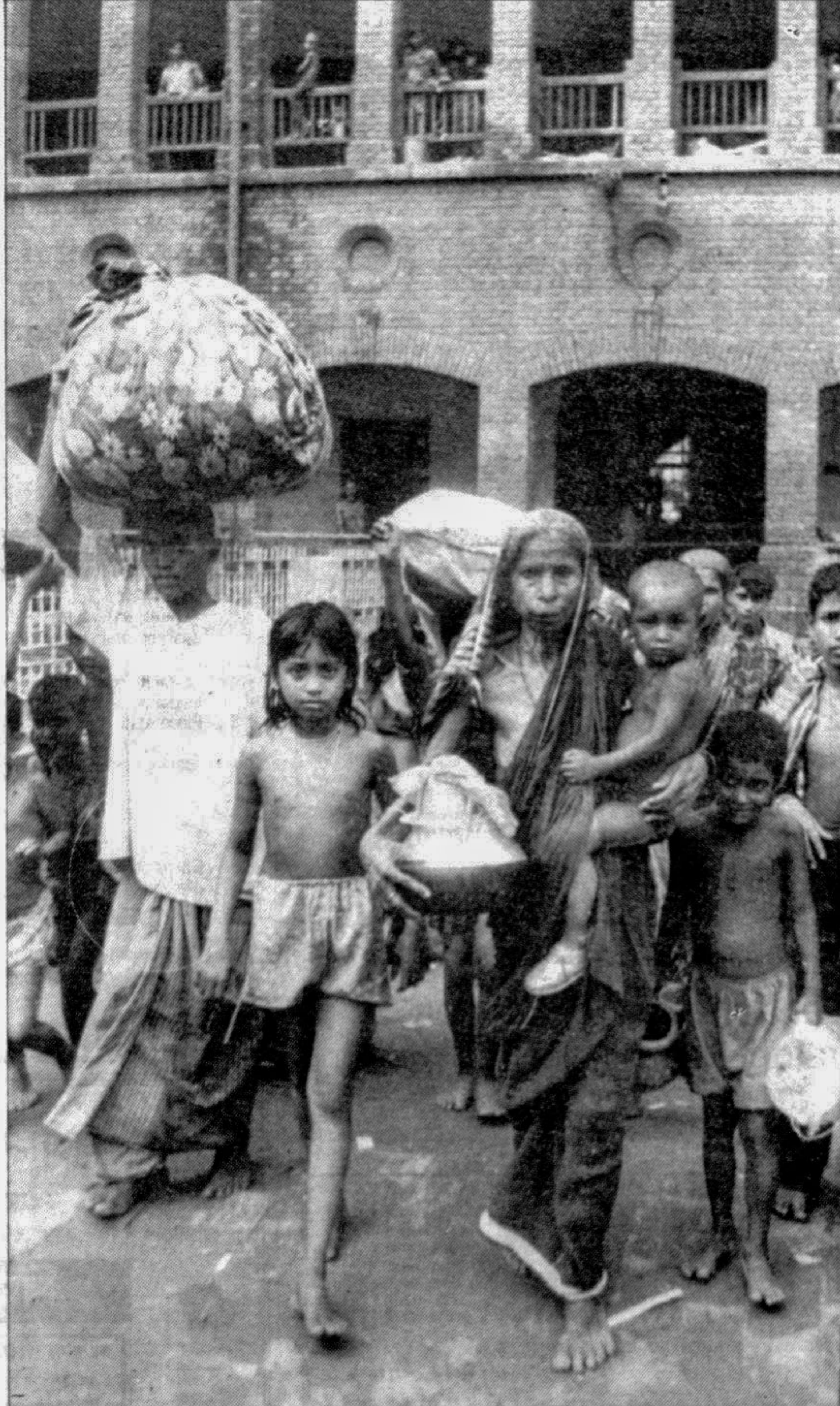
Flood victims at a shelter at the city's Armanitola High School returning home yesterday.

A roadside gas pipeline of Titas Gas Company in the city's Bashabo area caught fire yesterday due to a leak. Police and Fire Brigade sources said the fire died down after about half-an-hour when Titas Gas authorities cut off gas supply in the area.