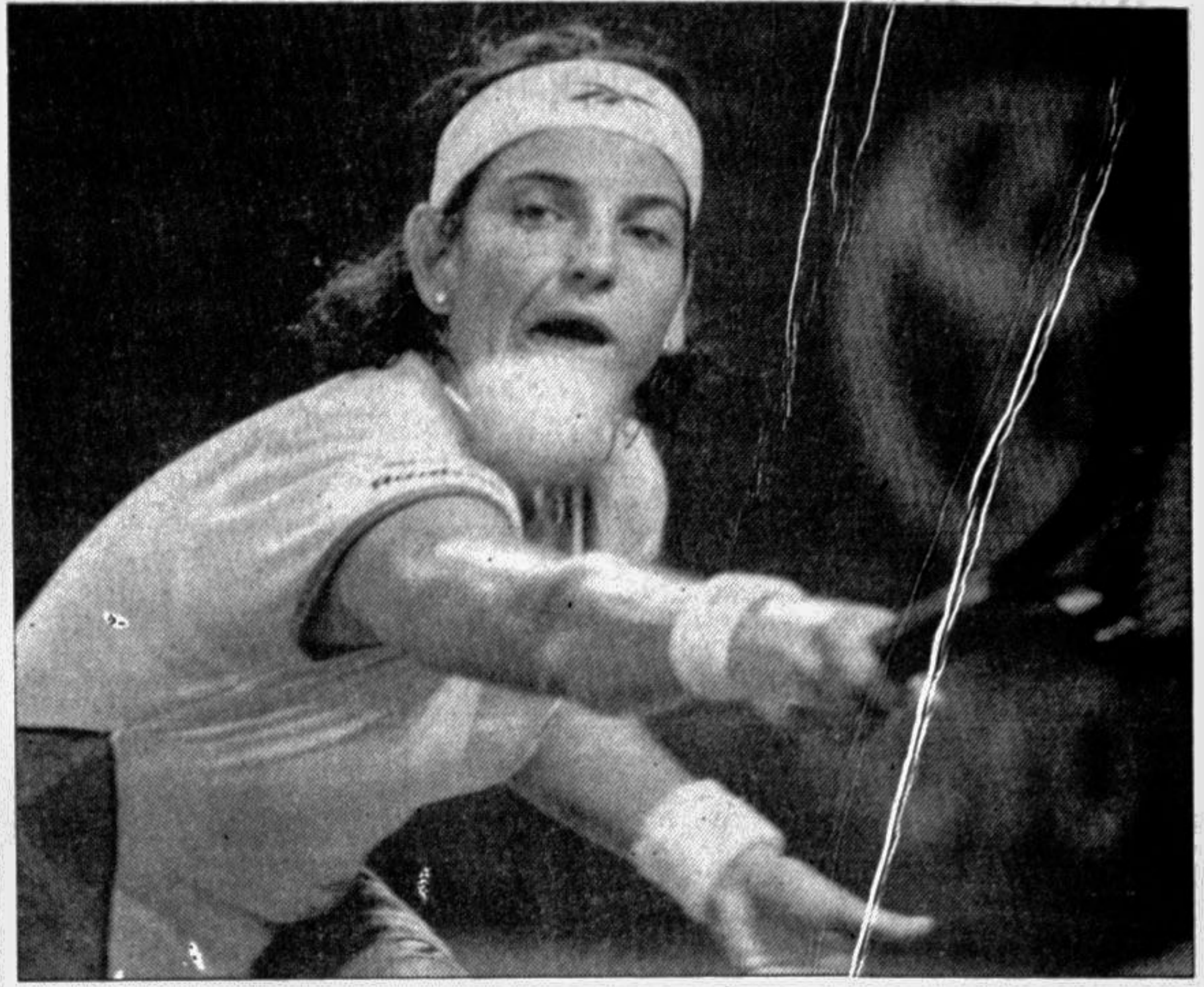
Spaniard Arantxa Sanchez-Vicario plays a backhand against Elena Likhovtseva of Russia during their Princess Cup tournament match at Tokyo yesterday. Sanchez-Vicario won 6-0, 6-4.

Kournikova, who needed only 16 minutes to take the top-set first set, failed to hold her serve to go down 0-2 in the second set.