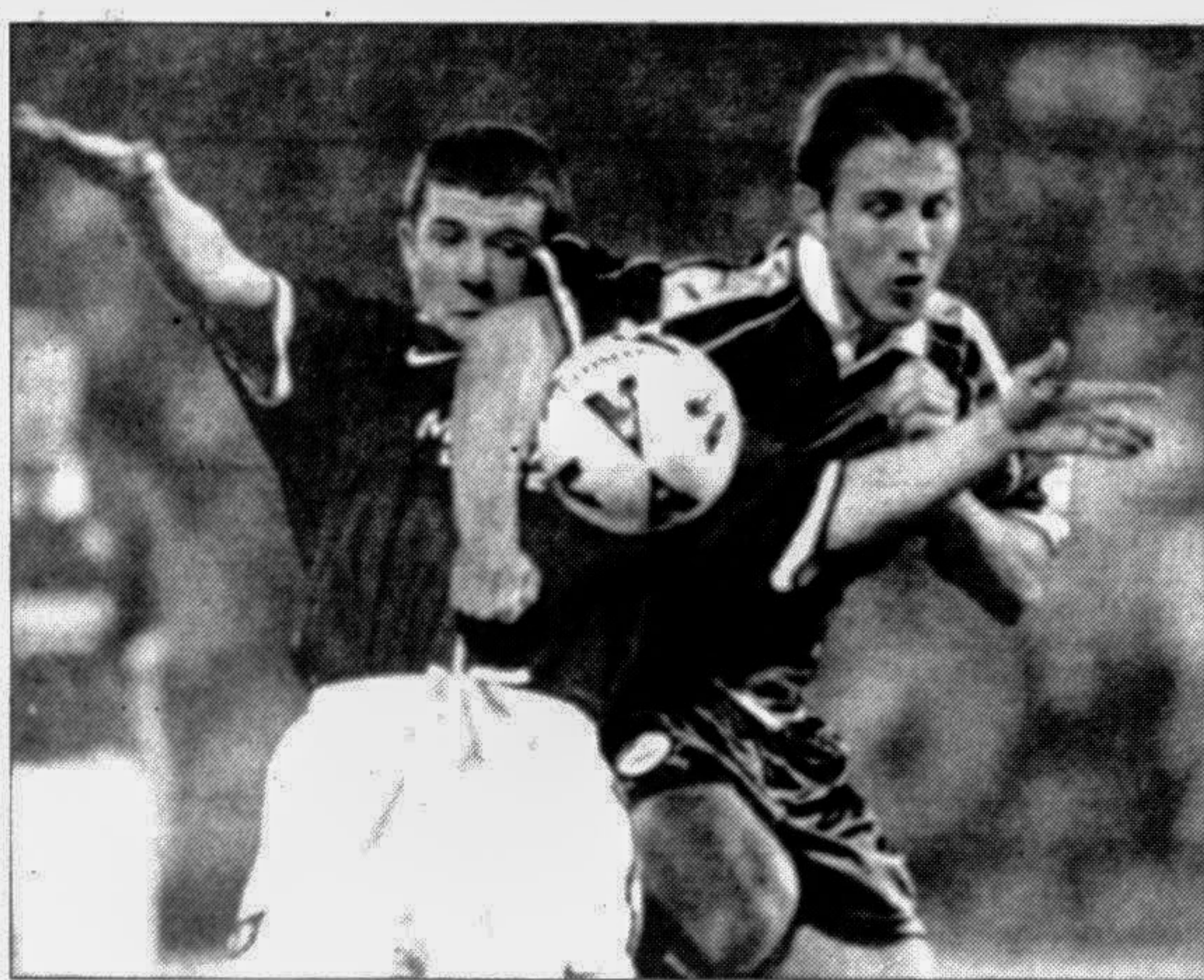
Action from the Scottish Premiership clash between Rangers and Aberdeen at Aberdeen on September 23. The match finished 1-1.

BONN, Sept 24: Holders Bayern Munich stumbled into the third round of the German Cup on Wednesday by beating Second Division Greuther Fuerth 4-3 on penalties following a goalless draw after extra time. After a miss apiece by both teams in the penalty shoot-out, which had both teams level at 3-3, Bayern's Stefan Effenberg coolly slotted the ball home from a short run-up. Fuerth's Czech defender Petr Skarabela, knowing that a miss would end the match in Bayern's favour, followed up by putting the ball in Oliver Kahn's safe hands. Fuerth put up brave resistance during the game in Nuremberg's Franken Stadium and played above the sixth position they currently hold in the German Second Division. Bundesliga side Freiburg were unexpected casualties, losing 1-0 to the amateurs of SF Seigen 1. Woldfaburg defeated fellow Bundesliga club Nuremberg 3-0 with all the goals coming in extra time. An extra time goal in the 98th minute gave a dominant Borussia Dortmund a 1-0 win in their derby against Schalke. Dortmund's Togolese striker Bachirou Salou muscled his way through Schalke's defence and converted from close in. Andreas Moller squandered a chance to extend his side's lead when he missed an extra-time penalty. Urdingen won their battle with fellow Second Division club Sankt Pauli Hamburg with a 5-4 result on penalties after being tied 1-1 following extra time.