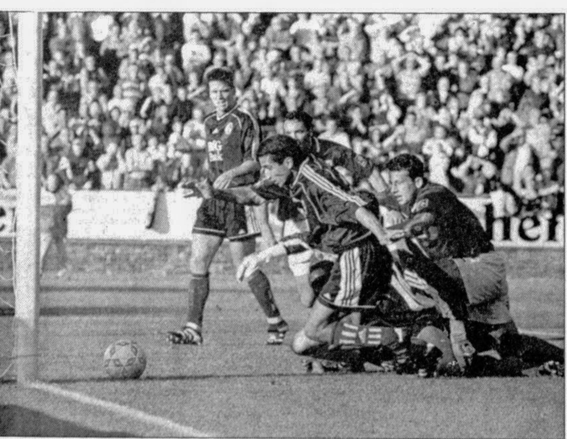
An anxious moment in front of the Sportfreunde Siegen goal during their German Cup match against SC Freiburg at Siegen on September 23. Siegen won 1-0.