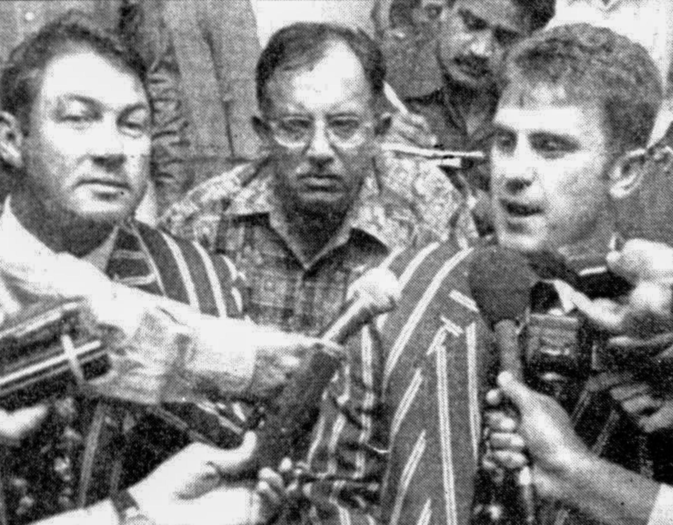
Australian captain Mark Taylor (R) talking to the media on arrival in Karachi on Wednesday for the series against Pakistan.

(The author is a Bangladesh national cricketer, currently vice-president, Bangladesh Cricket Board and was Manager, Bangladesh cricket team to the 1998 Commonwealth Games).