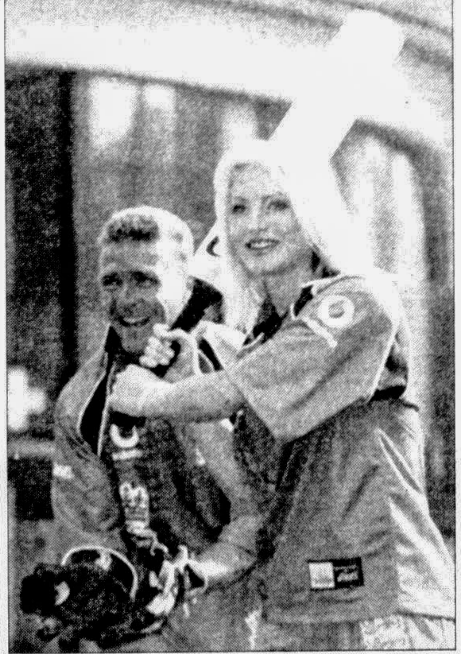
A model bats while England skipper Alec Stewart waits with wicketkeeping gloves during a promotional event for England's World Cup '99 uniform at London yesterday.

Coach Zaccheroni could not help admitting being pleased with his side. "The team showed a lot of character. A club like Milan, simply can't exist without character, pride and commitment".