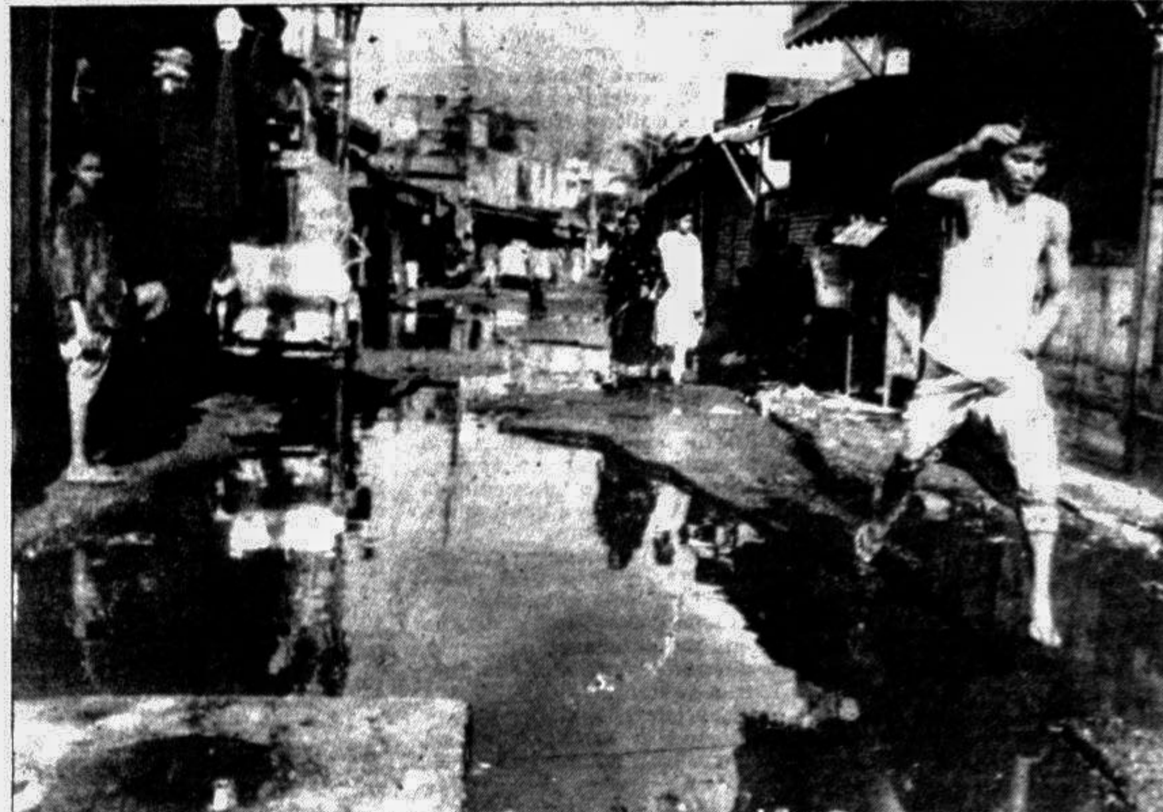
Pitiable condition of a city road after recession of flood water. The picture was taken from Maniknagar at Sabujbagh.

Editor: Mahfuz Anam. Published by the Editor from City Publishing House Ltd., 90 Kakrail, Dhaka-1000 on behalf of Mediaword Ltd., 52 Motijheel C.A., Dhaka-1000. Editorial, News & Commercial Offices: House No. 11, Road No. 3, Dhanmandi I/A, Dhaka-1205. PABX: 866772-4, Commercial: 866771, Fax No: 88-02-869035, GPO Box No: 3257, Cable: DAILYSTAR, DHAKA. Internet edition address: http://www.dailystarnews.com and Email address: dstar@bangla.net