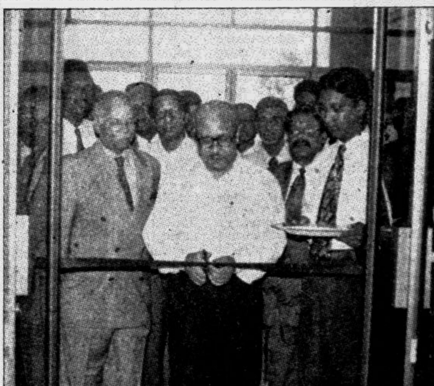
Khondker Ibrahim Khalid, Deputy Governor of Bangladesh Bank, inaugurated the first collection booth of Al-Baraka Bank Bangladesh Ltd...