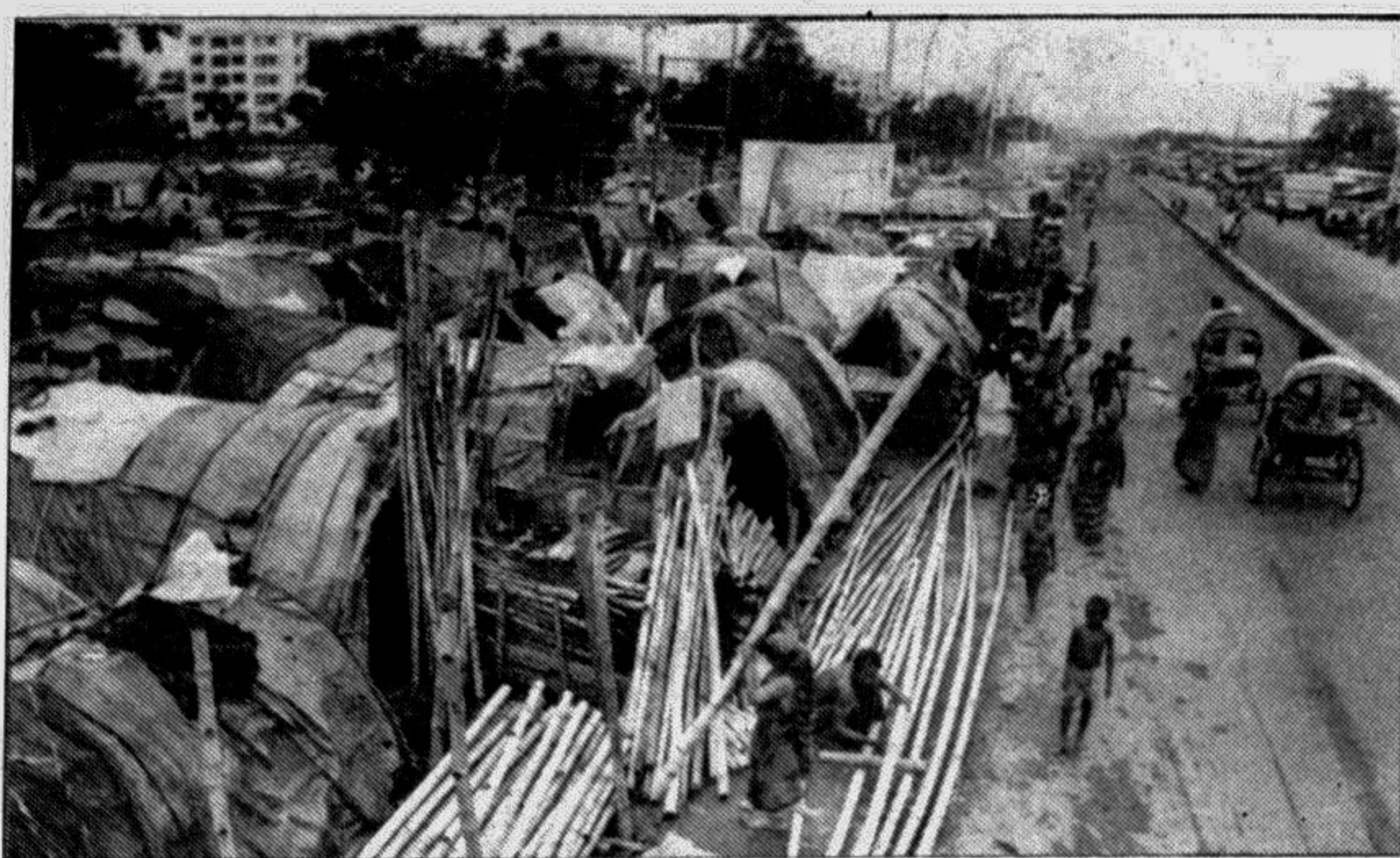
Almost the entire highway at Baridhara is occupied by the helpless flood affected people.