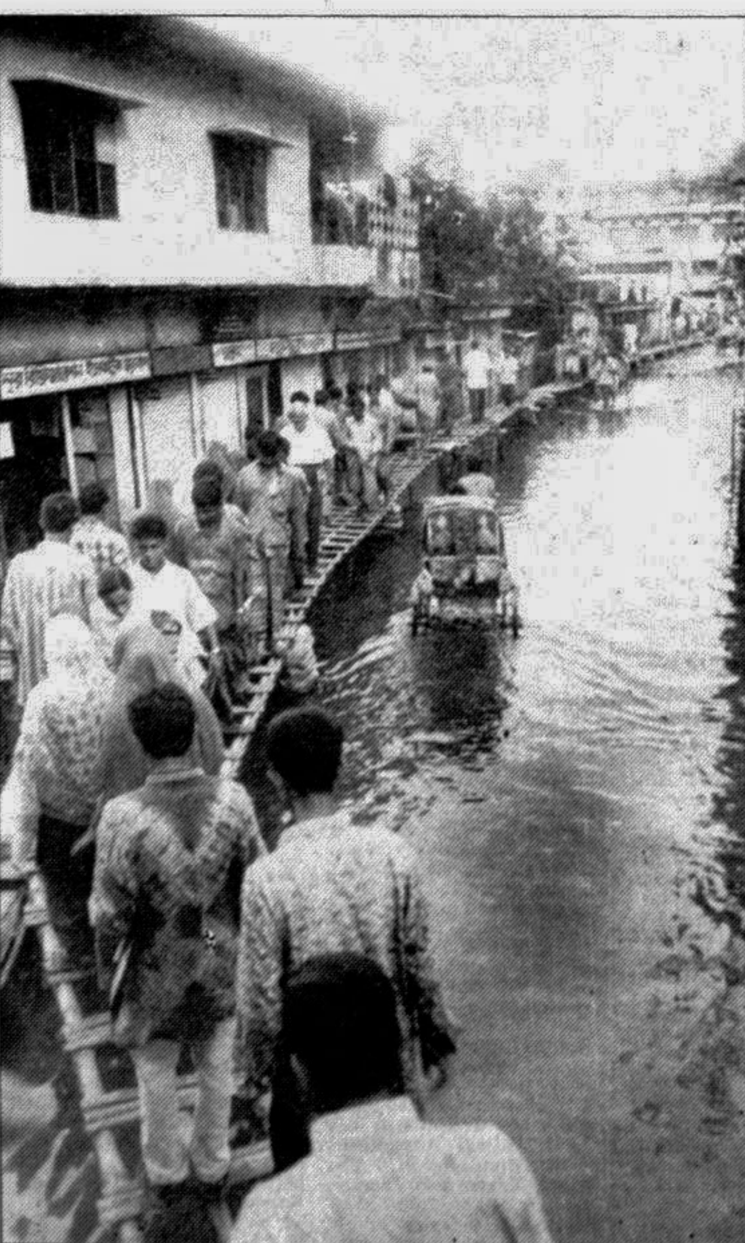
Stench from stagnant flood water at Rampura Chowdhuripara is polluting the environment.

Meanwhile, relief operation that started since last week of July, is also going on.