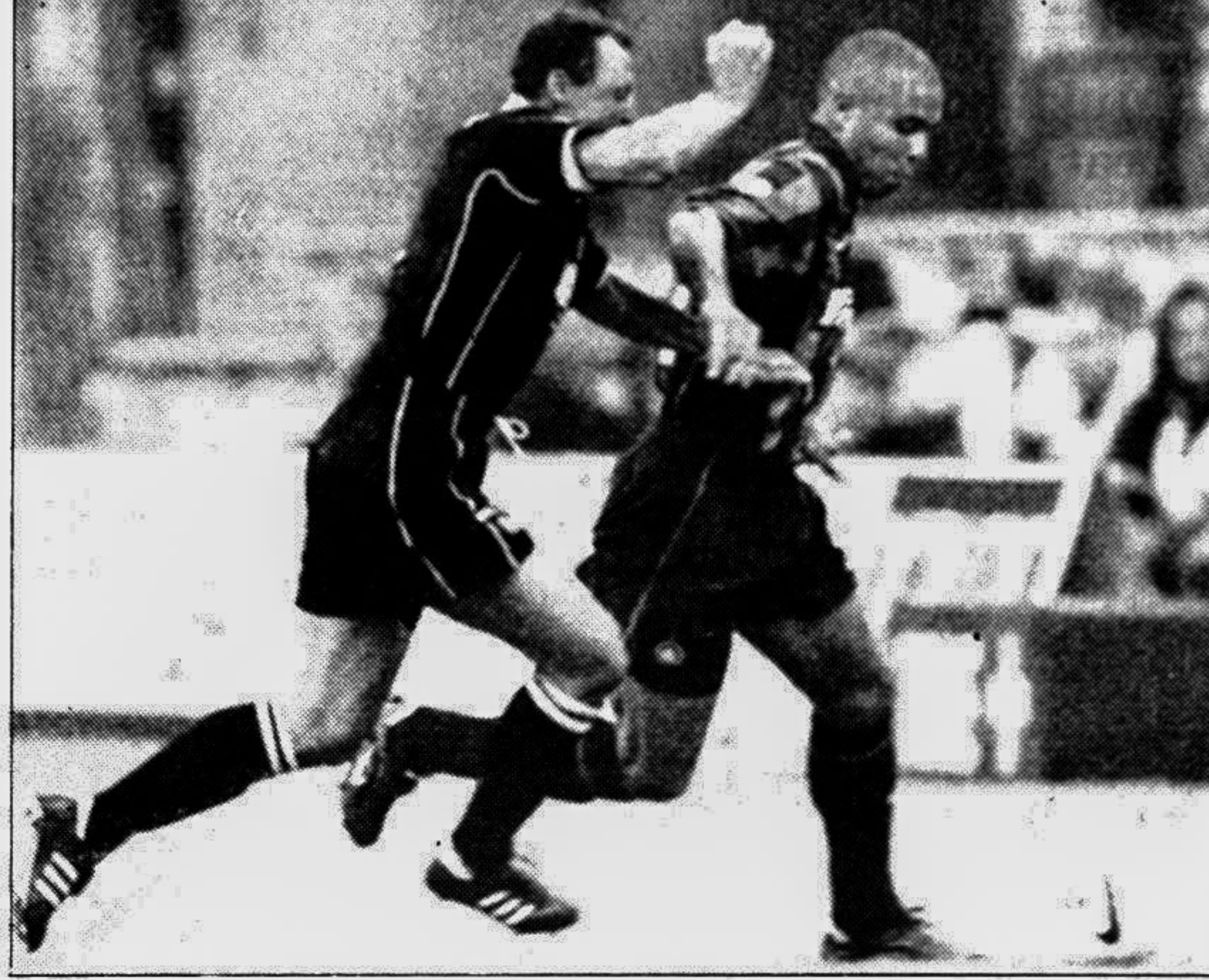
FINDING HIS FEET: Ronaldo of Inter Milan going past Pietro Vierchowood, Piacenza's former Italy international defender, during their Serie A match at the San Siro Stadium on September 20. Inter prevailed 1-0.

In San Sebastian, Mallorca's defender Marcelino Elena made it 1-0 in the 16th minute, giving the visiting team a needed victory against middle-ranked Real Sociedad.