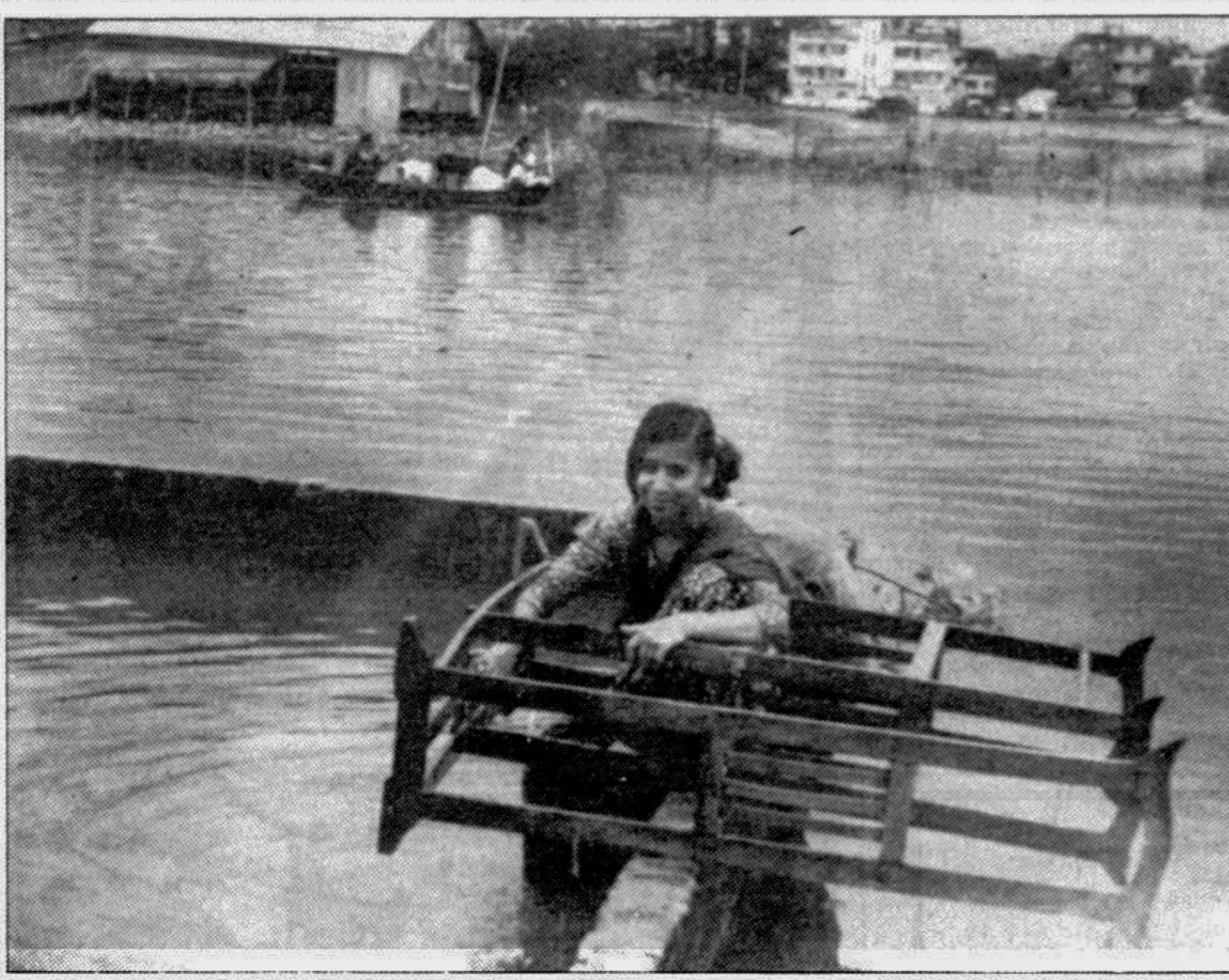
With the recession of flood waters, some are cleaning the households, some bringing their cattlehead home. The photo was taken from Meradia in the city yesterday.

From Page 1 nagar, Saidabad, North Jatrahari, parts of Gulshan and Baridhara, Khilkhet, Joar Sahara, Faridabad, Gendaria, Juarain, Lalbag, Bashabo, Khilgaon, Mugga, and Goran where the flood waters are receding. The heavy showers left many roads in Dhanmandi, Azimpur, Kalabagan, Motijheel and Sangsad Bhaban areas unusable till evening due to water-logging. The Met office forecast that in the next 24 hours beginning from 6 am today, light to moderate rain or thundershower accompanied by gusty wind may take place in many areas of Dhaka, Chittagong, Barisal and Sylhet divisions. Some areas of Rajshahi and Khulna divisions may also experience rain. There are chances of 'moderately heavy' rainfall in some places of Dhaka, Rajshahi and Sylhet division, it said. The day temperature may rise by one to two degree Celsius today. The maximum temperature recorded in Dhaka yesterday was 32.5 degree Celsius and the minimum was 25.9 degree. The country's highest temperature of 34.6 degree was recorded in Cox's Bazar and the lowest 23.5 in Sylhet. The sun sets today at 5.55 pm and rises tomorrow at 5.56 am tomorrow.