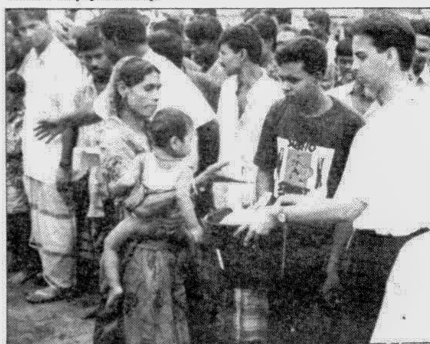
City Cell distributing relief materials among the flood victims of Nayarhat. City Cell has also distributed relief goods at Sirajganj, Savar and Banani.