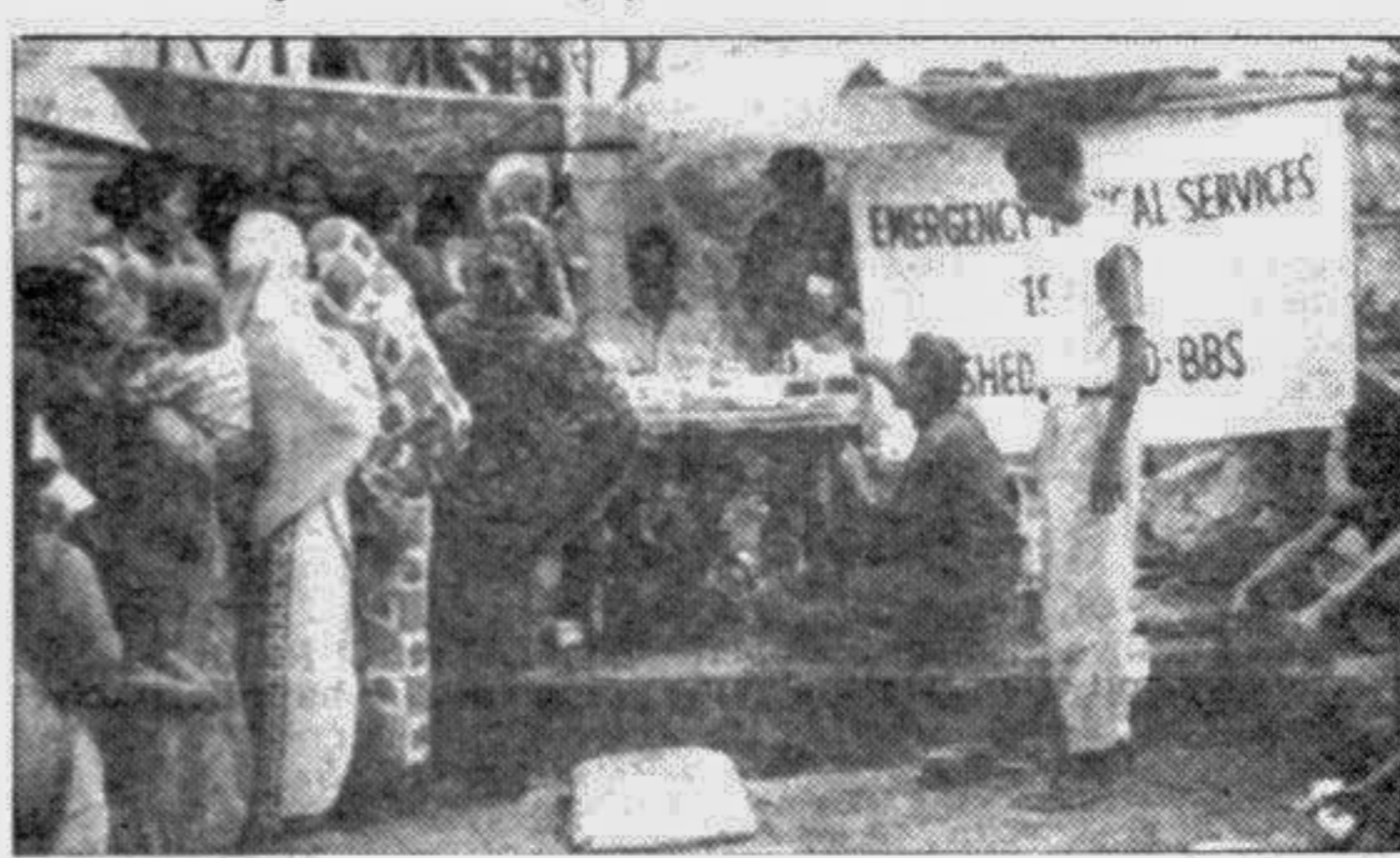
Social Health and Education Development (SHED) Board providing emergency medical services to the flood victims in the city yesterday.