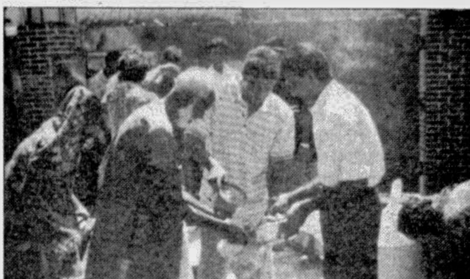
Samata, an NGO funded by the British High Commission, distributed relief goods among flood affected people in Pabna, Natore and Sirajganj districts.

All universities/colleges are requested to contact NSU for further information. E-mail: contest@nsu.agni.com Website: http://northsouth.edu