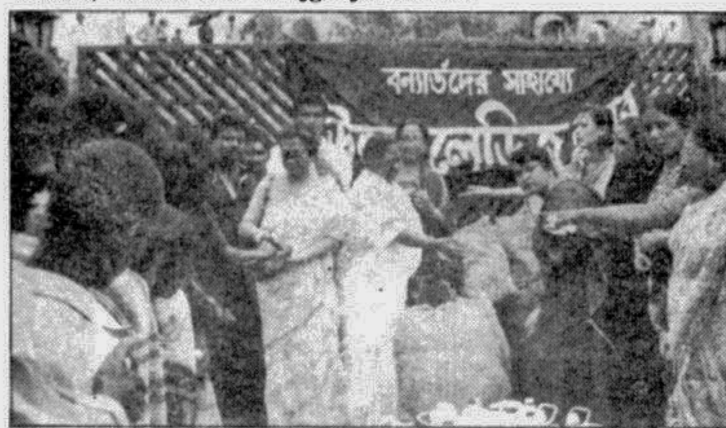
Uttara Ladies Club distributing relief goods among flood affected people of Faiddabad village, Abdullahpur dam and Azampur village.