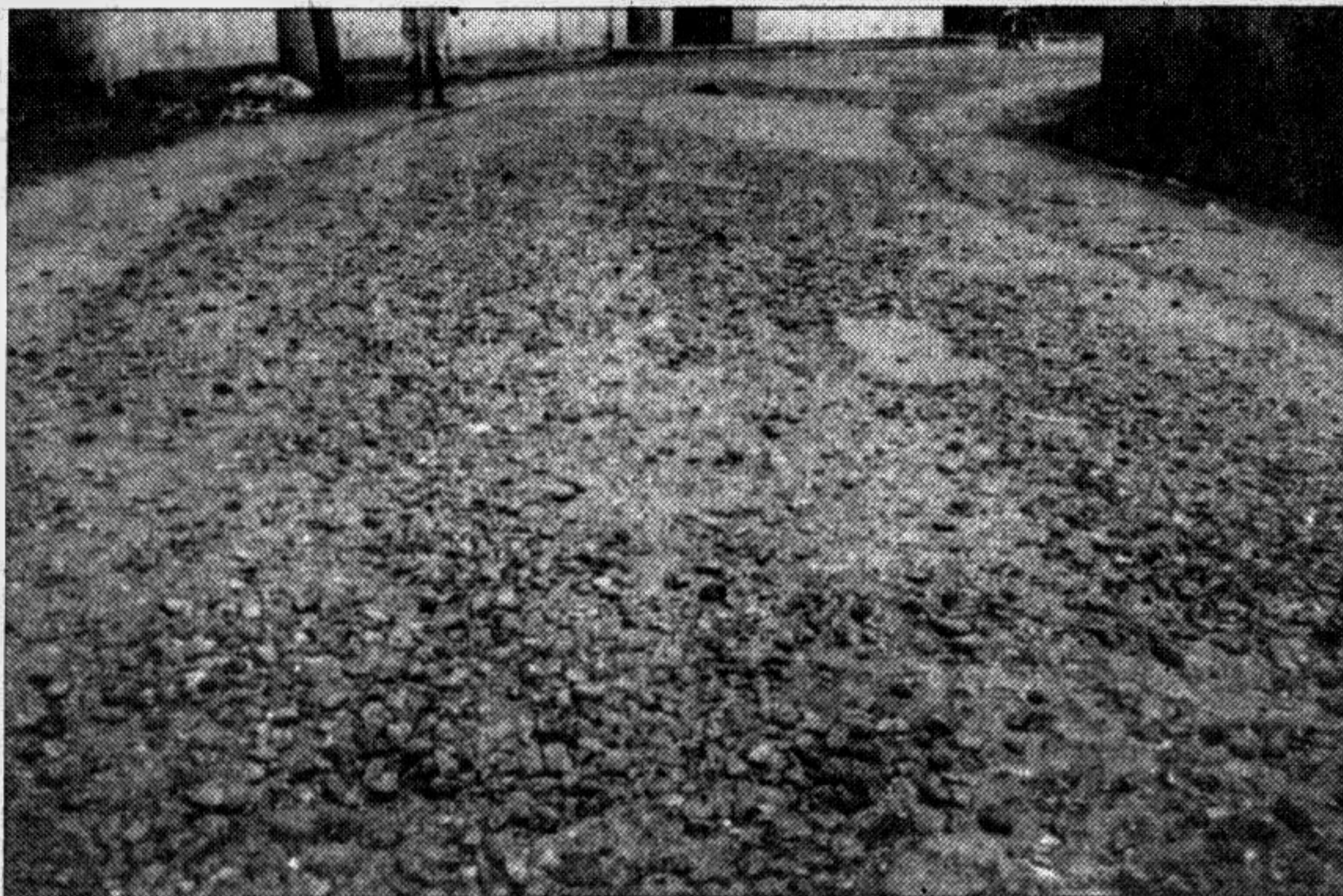
PABNA: (L) Dilapidated condition of a busy road from Pabna Bazar to Ananta Cinema Hall via Kalachandpara. (R) Pitiable condition of Pabna-Hemayetpur Road.

FENI, Sept 21: A devastating fire gutted five dwelling houses in village Matua in sadar thana Saturday night, reports UNB. Witnesses said the fire originated from kitchen quickly engulfed tin shed houses. The fire rendered two families homeless. Fire Brigade men brought the fire under control.