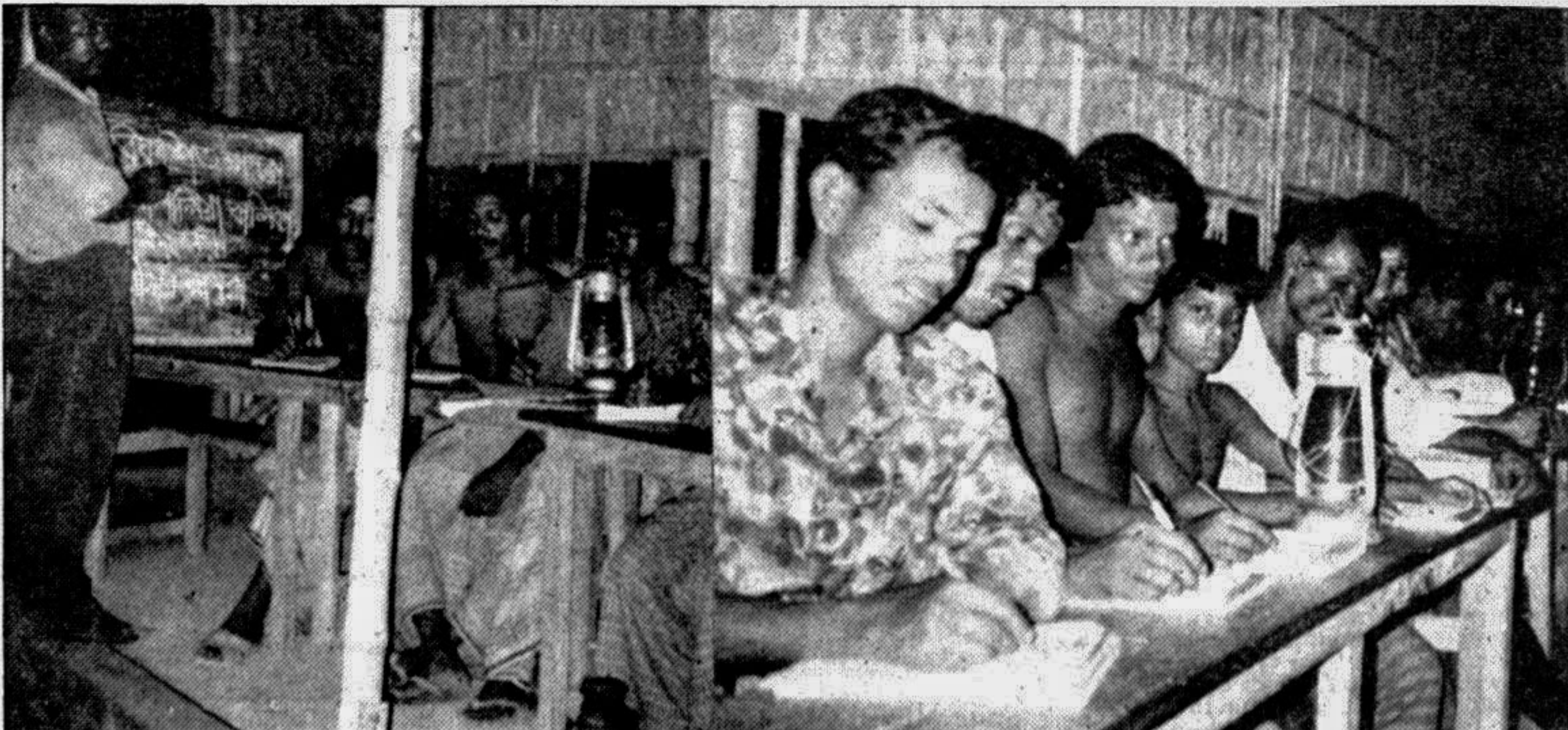
MAGURA: A total of 2 lakh people aged between 11 and 45 years recently took part in a final examination under Total Literacy Movement (TLM) of 'Bikoshito Magura', a socio-economic development programme at a remote village in the district. The people who were illiterate a few months ago learnt to read and write through 6,700 mass education centres in four thanas of the district under the programme.