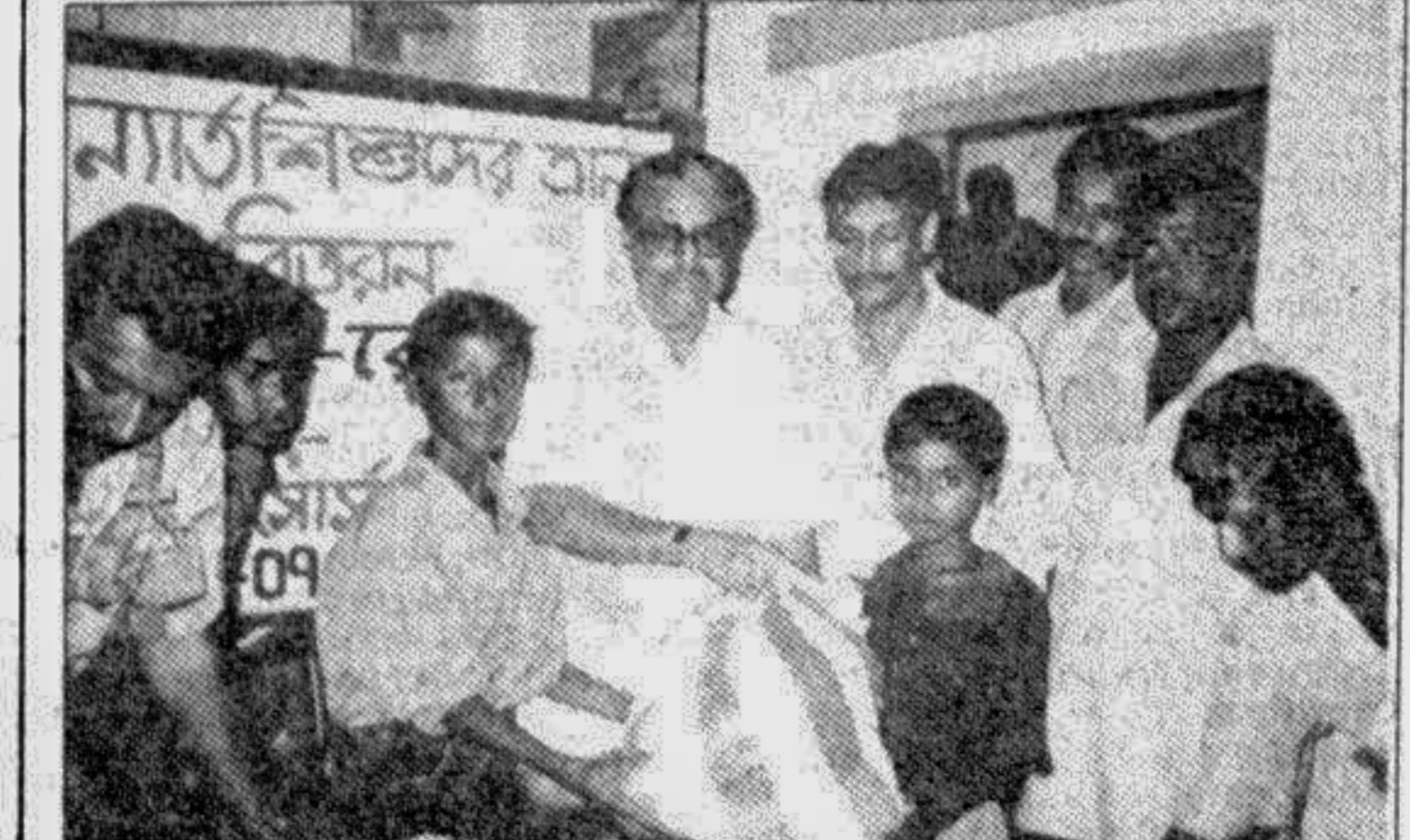
Resource Bangladesh distributing relief goods among the flood-affected children in city.

SAVAR, Sept 20: Water Resources Minister Abdur Razzak today asked the officials concerned to take necessary preparations so that the farmers can get seeds, fertilizer and other agri-inputs in time, reports UNB. Addressing separate review meetings with thana level officials and Union Parishad chairmen of Savar and Dhamrai thanas, he called for strengthening the post-flood rehabilitation programmes, specially agricultural rehabilitation. Emphasising on proper distribution of relief materials among the flood-hit people, the minister said any misappropriation in this regard will not be tolerated and stern measures will be taken against the culprits. He also stressed the need for ward-wise relief distribution in the affected unions. The government will continue its Vulnerable Group Feeding (VGF) and Vulnerable Group Development (VGD) programmes for the next three months to feed the flood affected people, Razzak said. Marium Begum, MP, Dhaka district Awami League president Shamsuddin Khan Majlis and general secretary Benazir Ahmed were present.