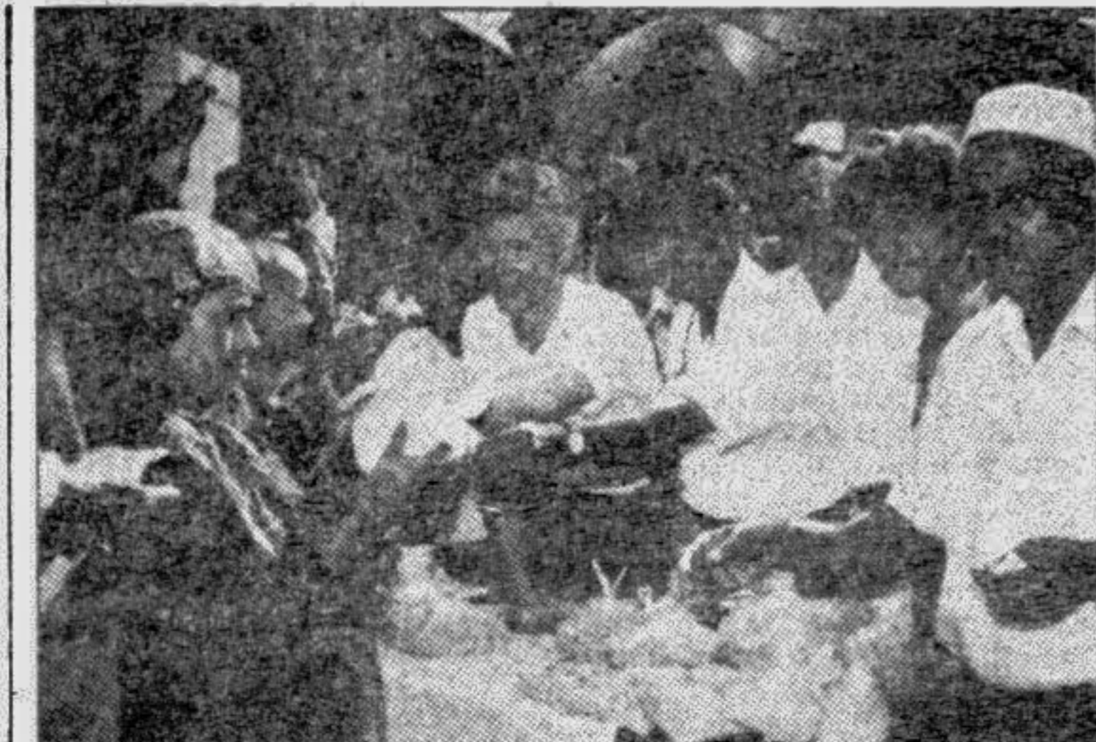
Dhaka Sheraton Hotel management distributing relief materials among the flood-affected people sheltered at Shahjapur govt primary school and Maddha Badda primary school on Friday.