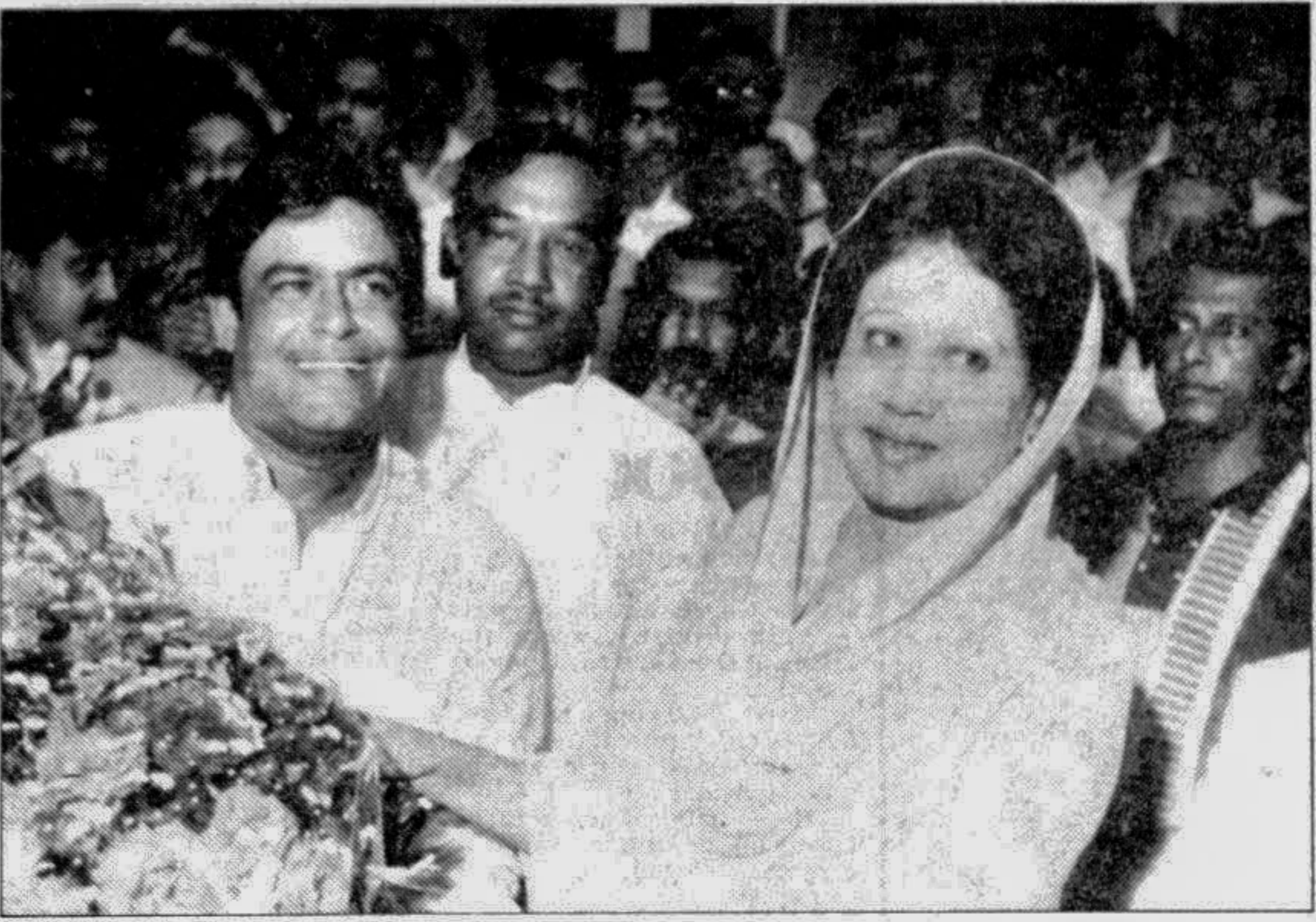
Leader of the Opposition and BNP Chairperson Begum Khaleda Zia welcoming the JP leaders and activists from Tongi thana at her Minto Road residence yesterday who joined her party.