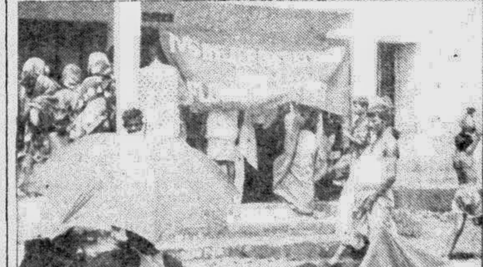
International Voluntary Services (IVS) distributing relief to flood victims at Ford Nagar of Singair thana under Manikganj district recently from two-day salary contributions of the staff members.