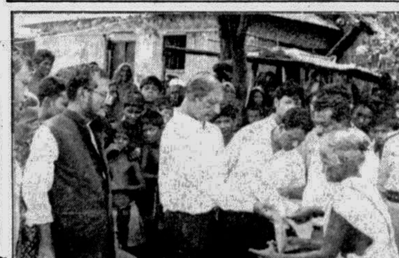
BRAHMANBARIA: Divisional Commissioner Shakawat Hussain recently distributed relief materials among the flood affected people of the district.

The local leaders urged the higher authorities to implement the project immediately for making and district self-reliant in food production.