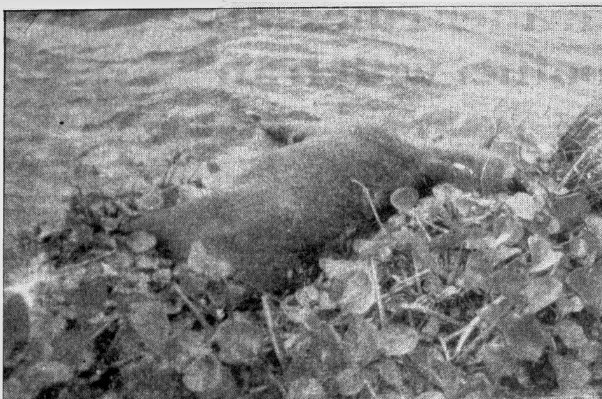
SHERPUR: As flood water starts receding bodies of dead animals are seen floating here and there throughout the district. This picture was taken from a road near Noodirbazar.

SYLHET, Sept 20: Bangladesh Rifles (BDR) in separate drives seized a huge quantity of smuggled goods worth Tk 28.5 lakh in last month, reports UNB. The goods included valuable timbers, sugar, bidi, medicine and hemp. The smuggled goods were handed over to the Customs Office and Forest Department. Separate cases were filed with the police.