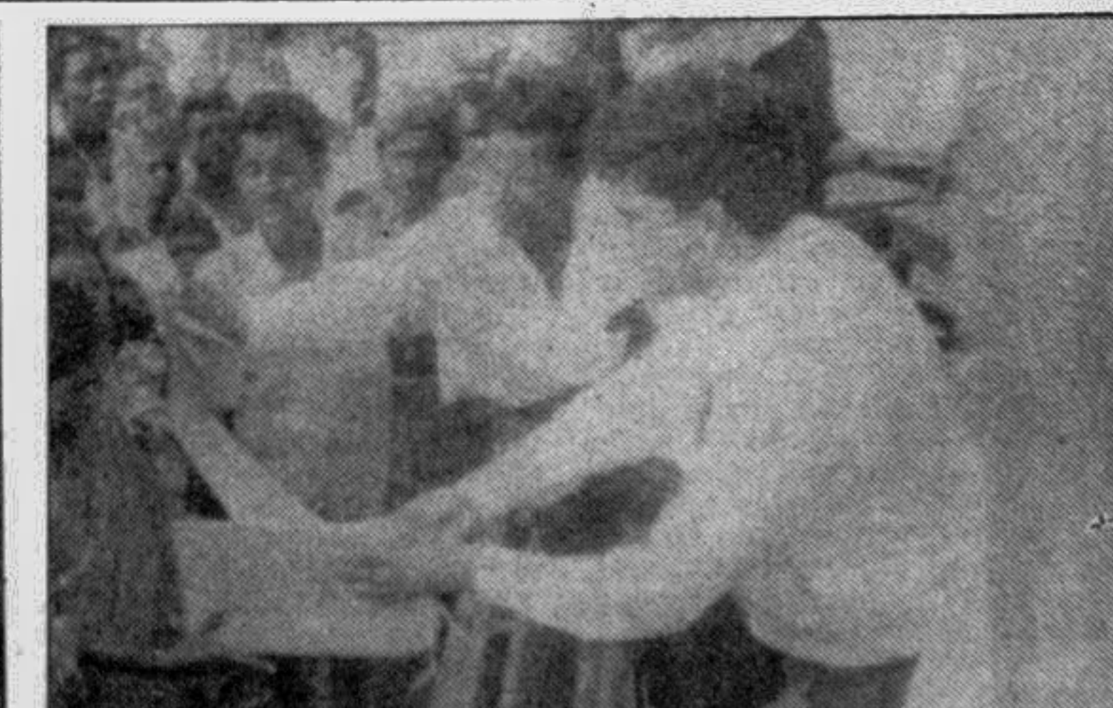
RANGPUR: Local NGO workers are engaged in distributing relief goods among the flood victims of Chilmari.