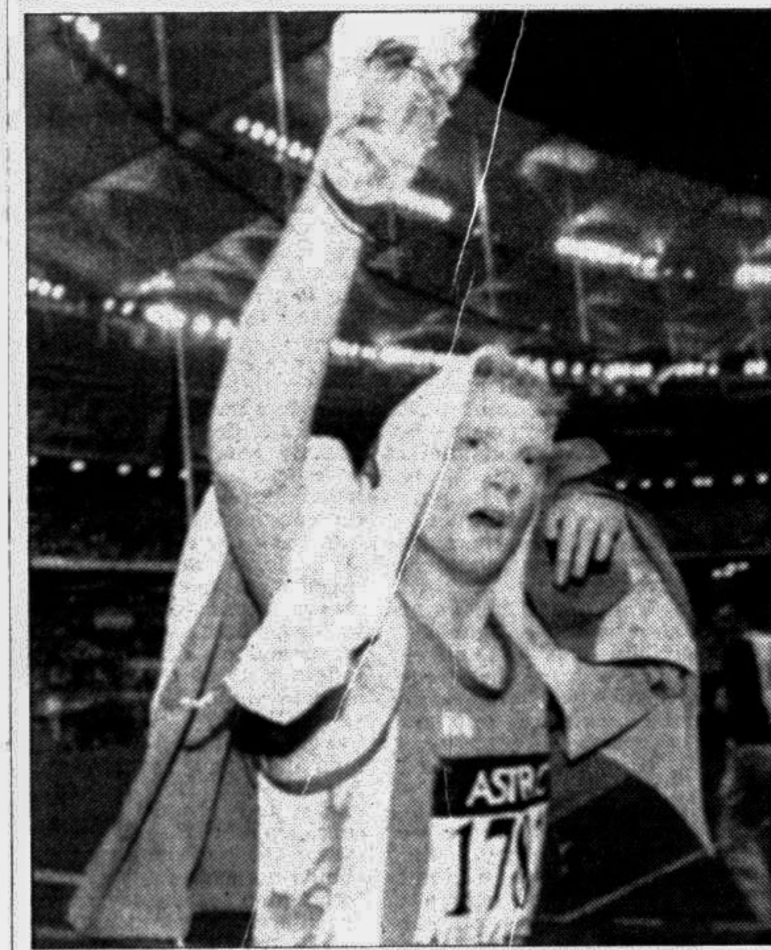
Iwan Thomas of Wales who captured the 400 metres title in Kuala Lumpur on Friday.