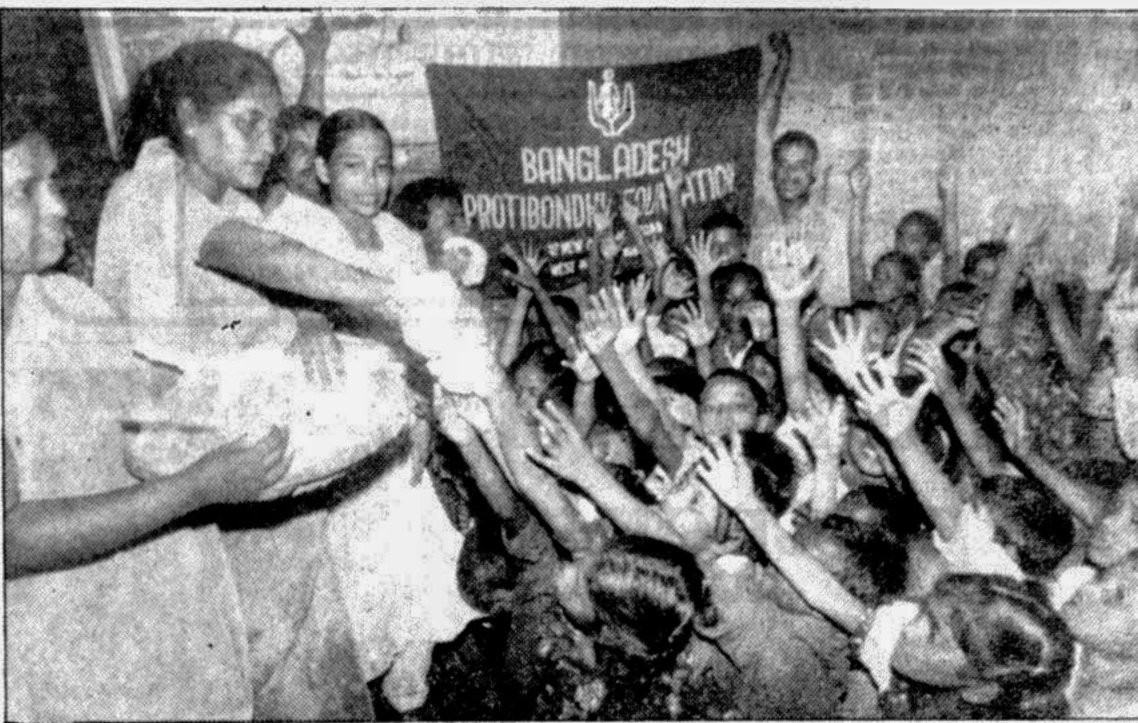
Bangladesh Protibondhi Foundation distributed dry food among the flood-hit children. The foundation has been providing healthcare services to children and distributing relief materials for a month.