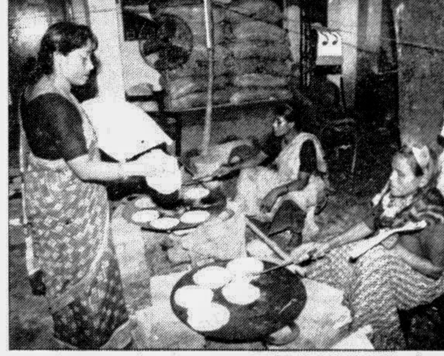
Ruti (bread) making programme for the flood-affected people organised by the Mukhtijodha Sangsad.