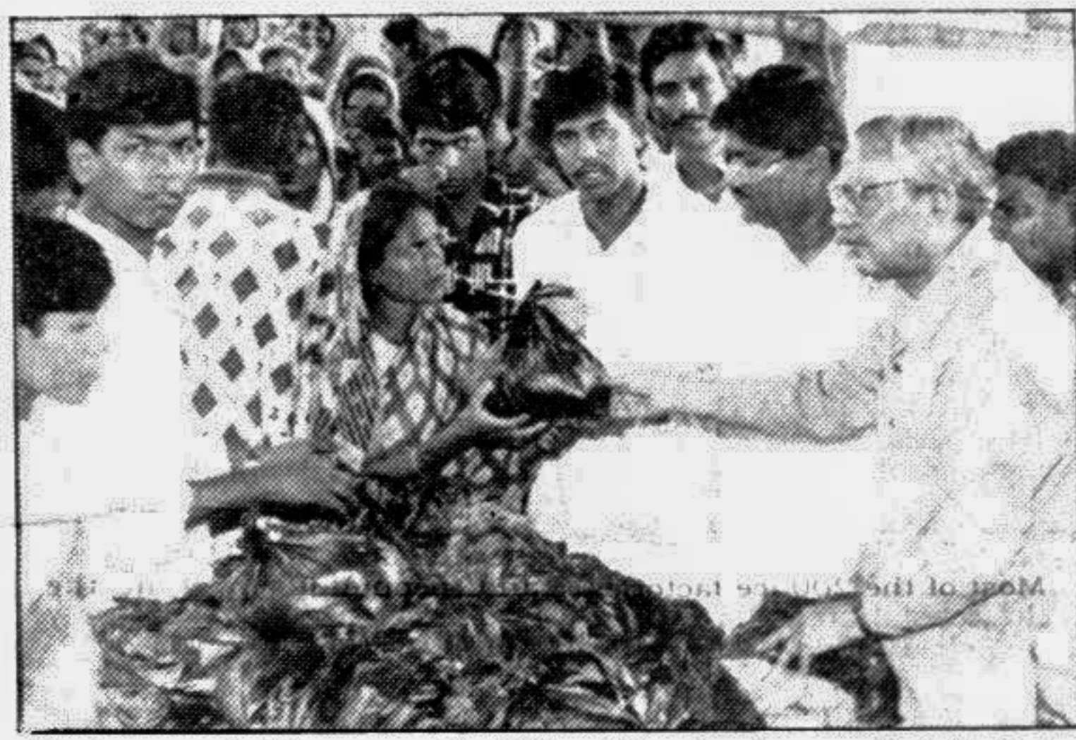
Cantonment thana unit of the Zia Academy distributed relief materials among the flood-hit people of Khilkhet Khapara. Former DU VC Emajuddin Ahmed is seen distributing relief yesterday.