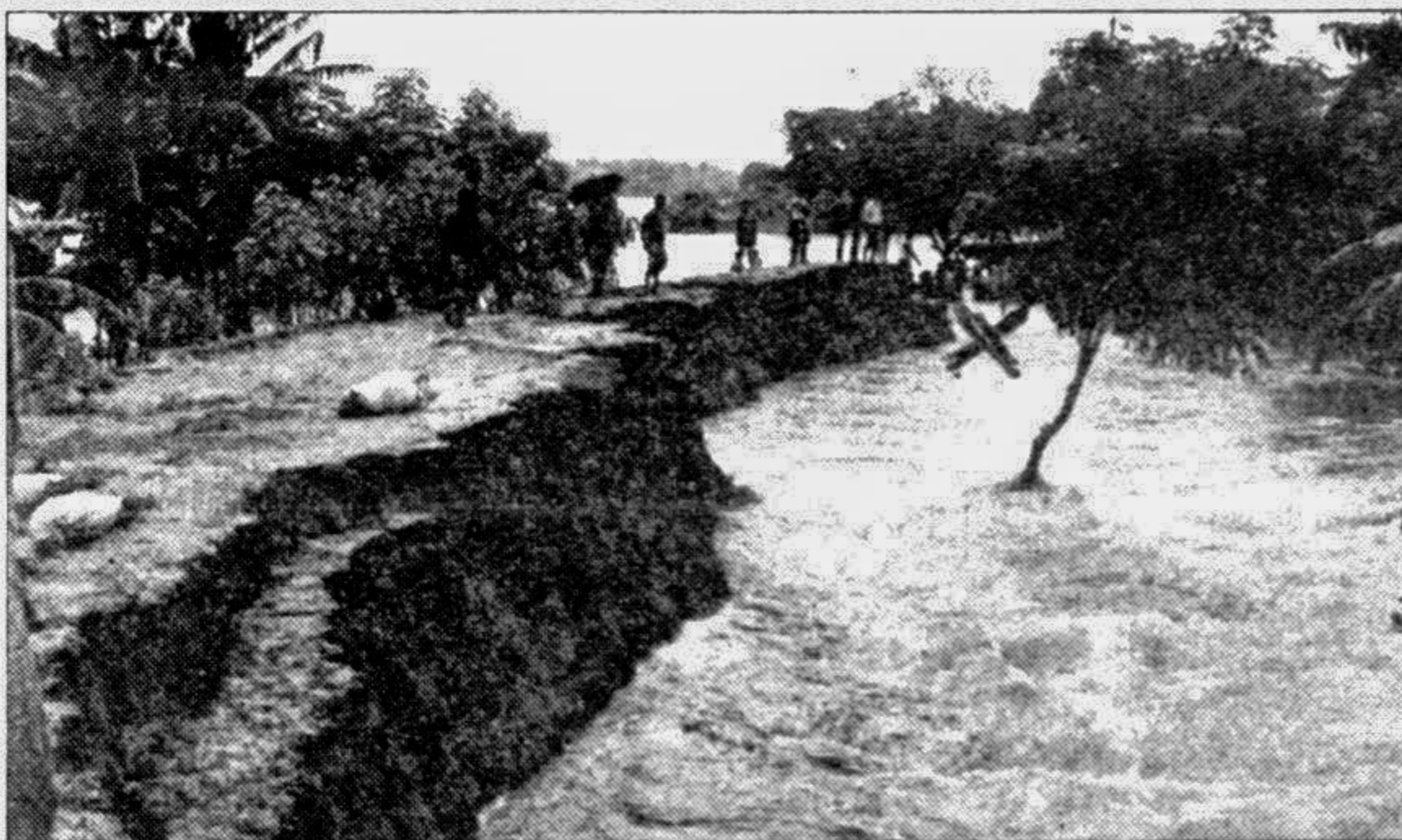
DINAJPUR: Flood water entered into Dinajpur town as a portion of the town protection embankment is yet to be constructed.

Another reports says: The government has taken up a rehabilitation programme of Taka 25 lakh, district officials informed. Of the total amount, Taka 9,39,600 would be spent for buying DAP fertilisers and the rest Taka, 15,60,520 would be spent for buying different other inputs.