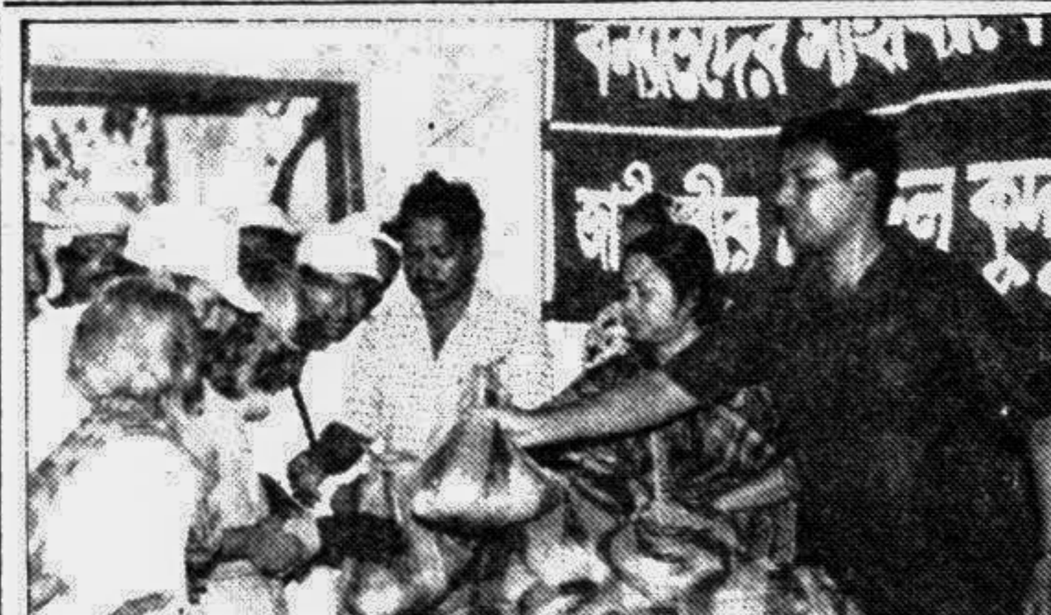
BRAHMANBARIA: Abdul Quddus Makhon Smriti Parihad distributed relief materials among the flood-hit people of the district.