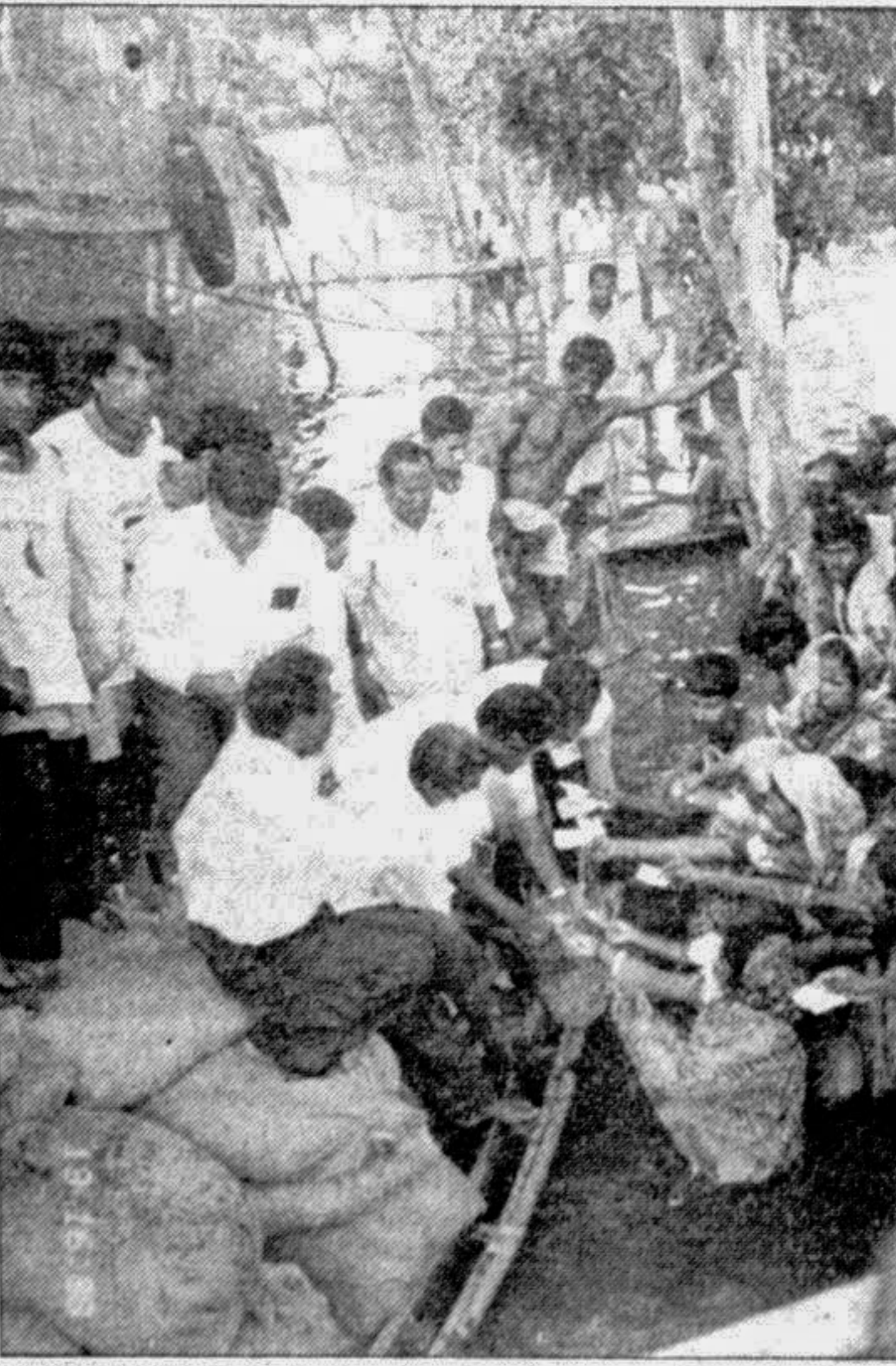
CHANDPUR: Relief activity of Bangladesh Red Crescent Society in the remote areas of Matlab thana.