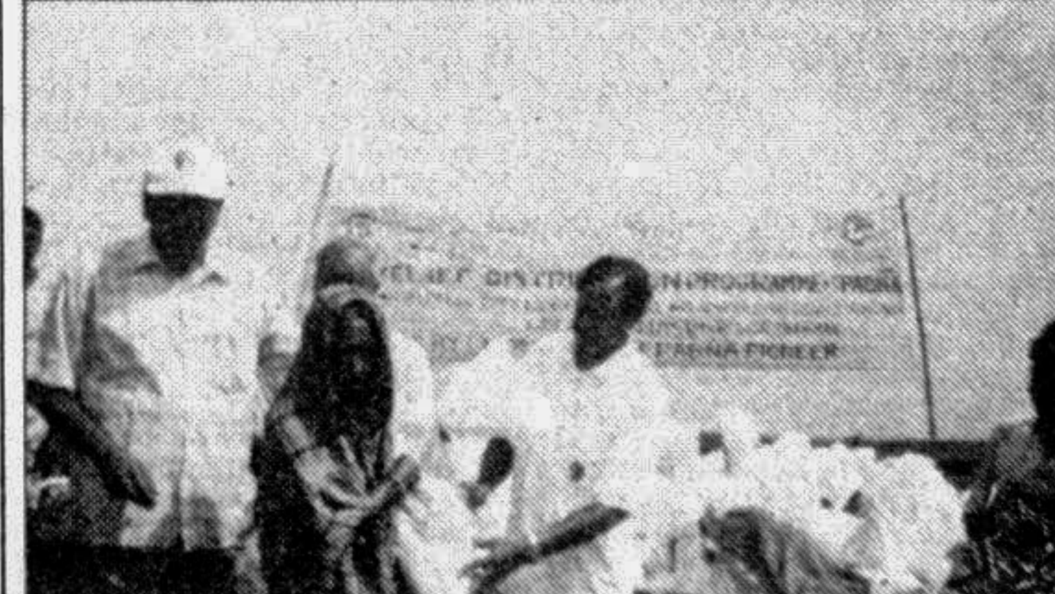
PABNA: Pabna Pioneer Lions Club recently distributed relief goods among the flood victims of the sadar thana.