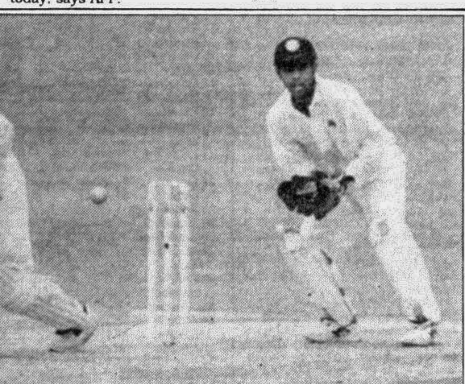
New Zealand's Nathan Astle sets off for a quick single nudging the ball to the outside during the bronze medal match against Sri Lanka in Kuala Lumpur yesterday.