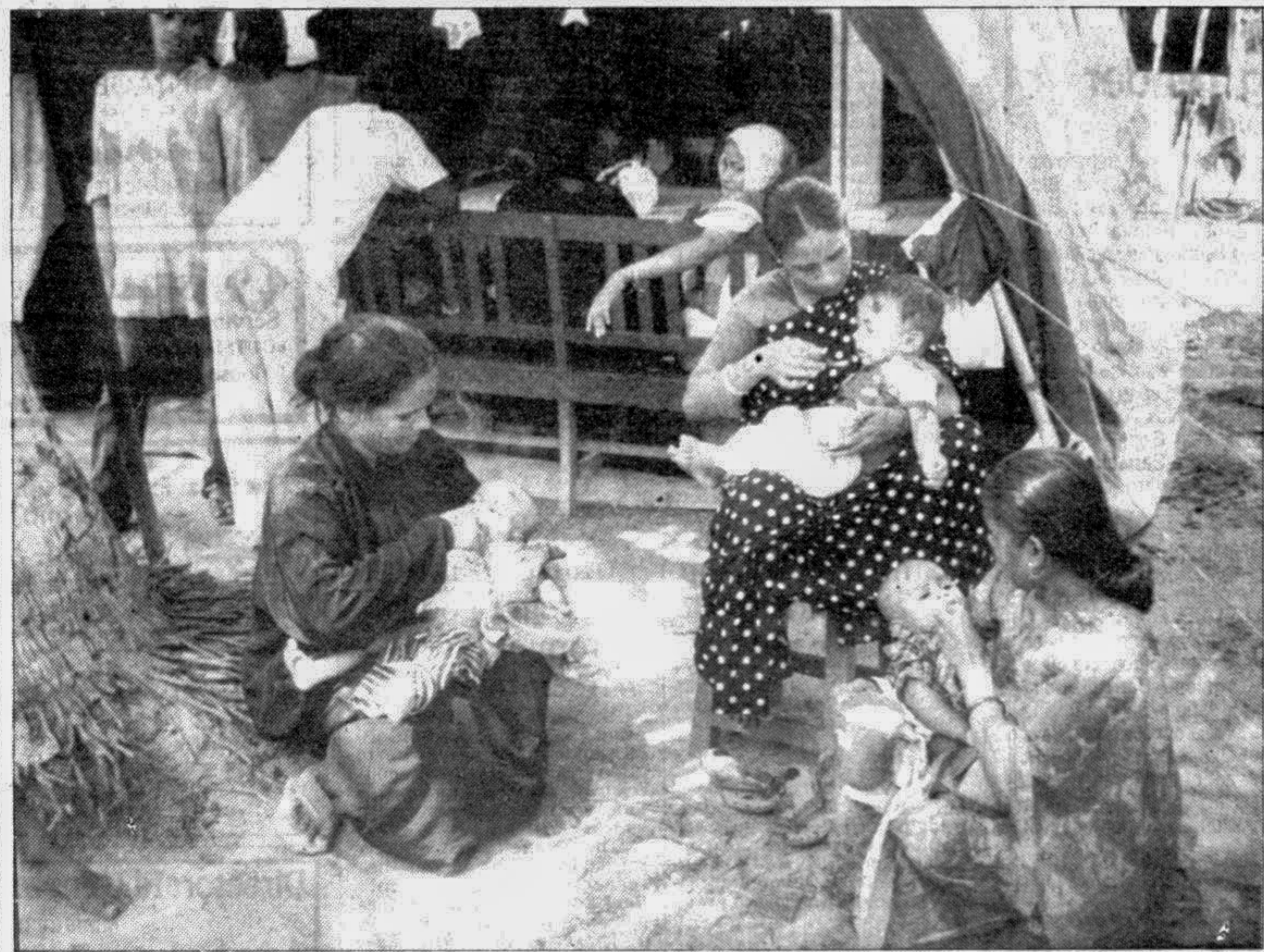
More tents have been pitched on the ICDDR,B premises but those cannot accommodate the increasing number of diarrhoea patients. Photo shows three mothers feeding saline to their babies outside the tents.

BNP Secretary General Abdul Mannan Bhuiyan MP has blamed the government for not yet undertaking any effective post-flood rehabilitation programme although the flood water is receding. "Lakhs of affected people may die of starvation and lack of medical treatment if the government fails to face the post-flood situation satisfactorily," he told a press conference at the Naya Paltan central office of the party yesterday. "We demand that the gov- See Page 12 Col 1