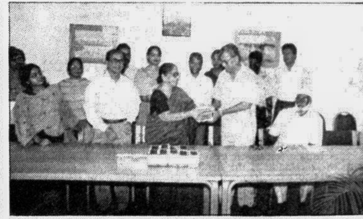
UNICEF assisted LGED's Urban Basic Service Delivery Project has donated some essential medicine to the Kumudini Welfare Trust of Bengal yesterday.