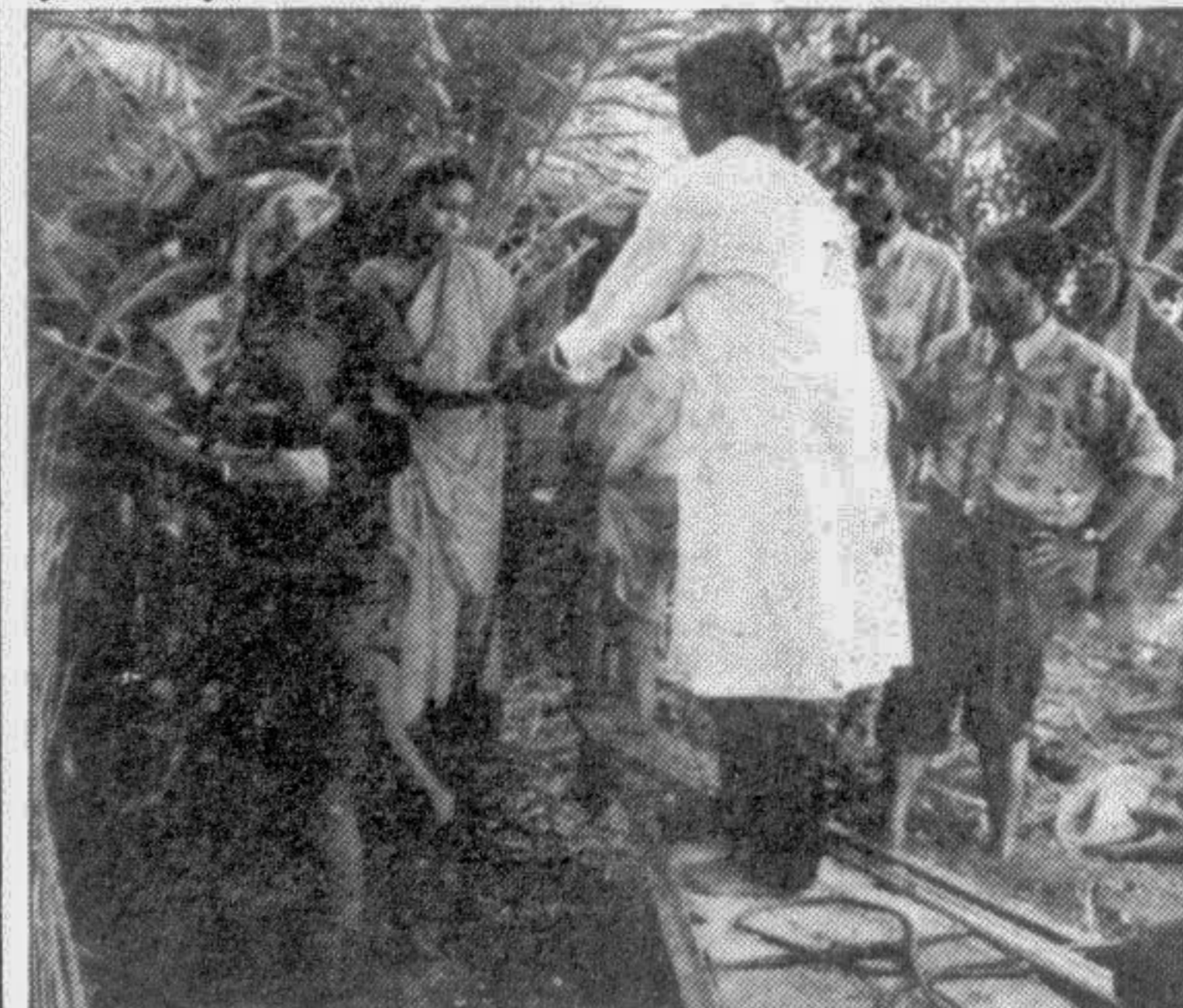
BRAC distributing dry food, medicine and water among the flood-hit people in and outside the city.