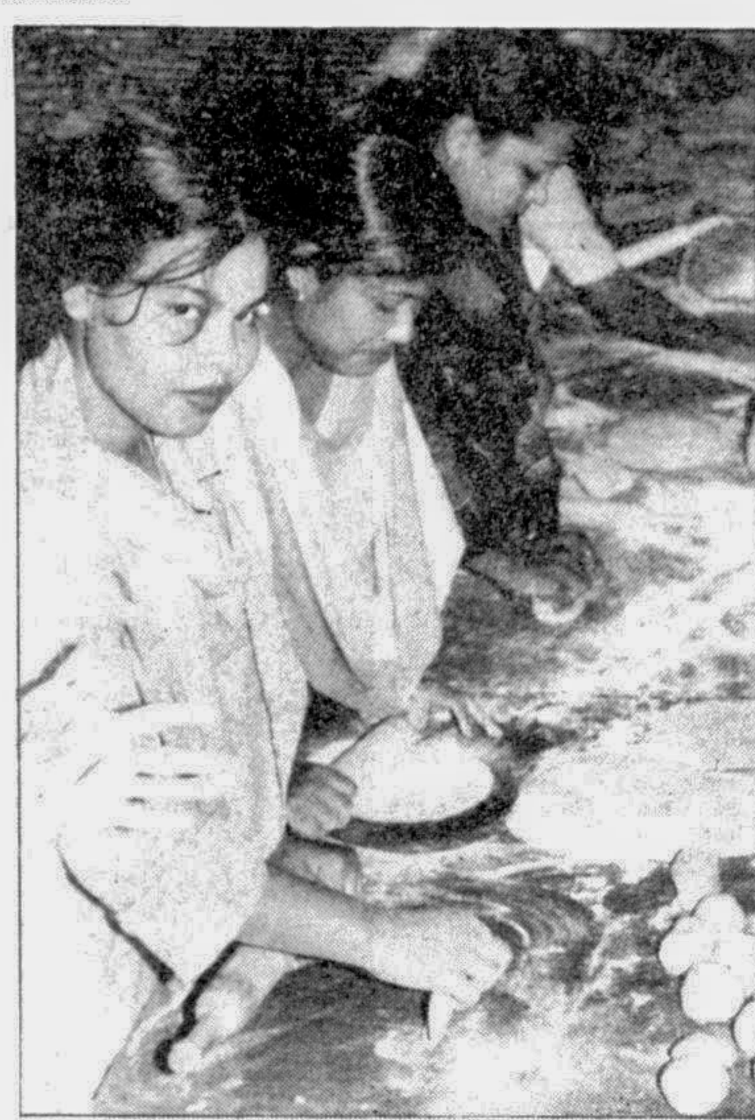
A ruti -making project at DUCSU Bhaban.

Samajtantrik Chhatra Front has started a pure drinking water and oral saline project at the Curzon Hall of the university.