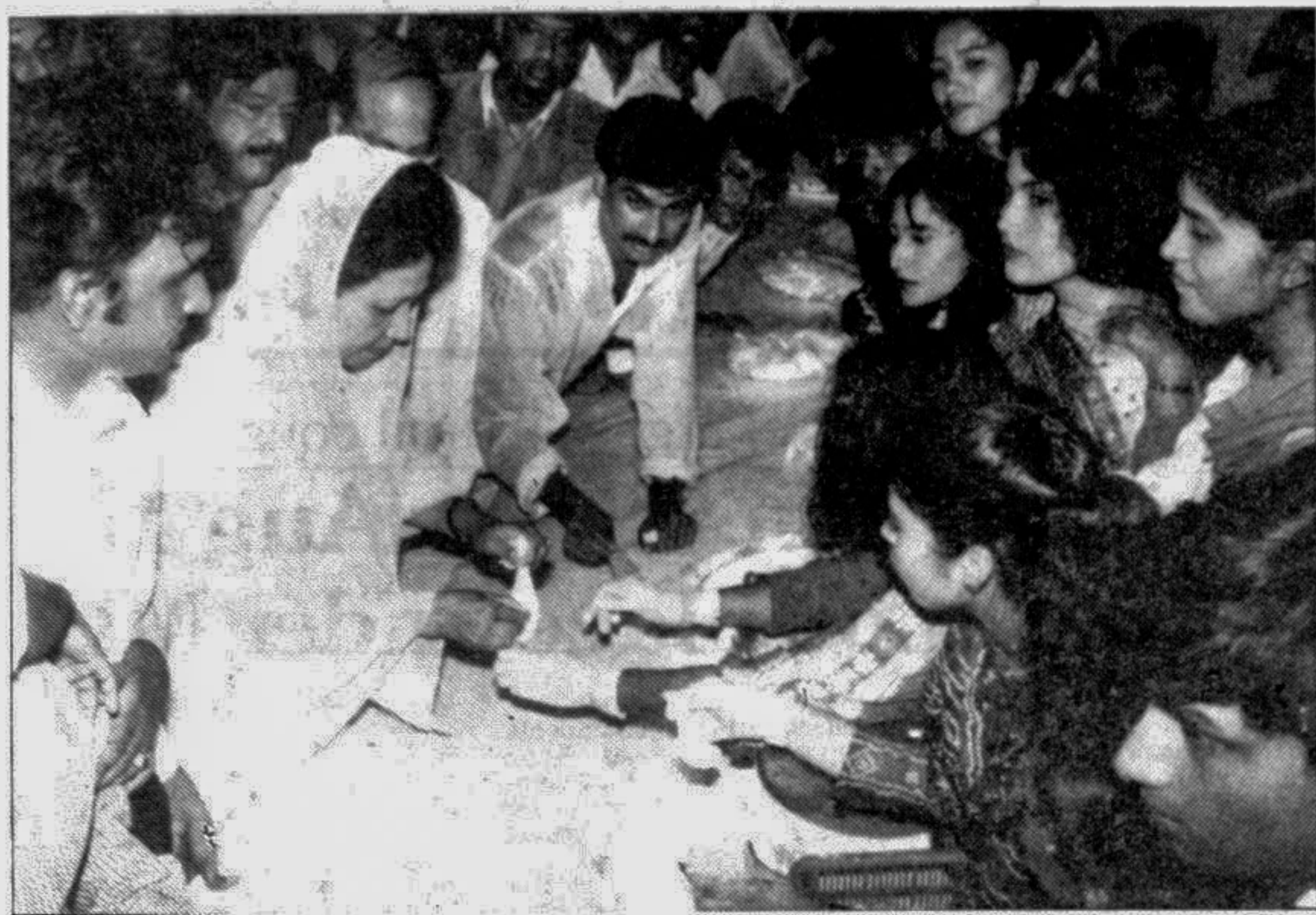
BNP chairperson Begum Khaleda Zia visited the oral saline making project run by Jatityatabadi Chhatra Dal on the DU campus yesterday.