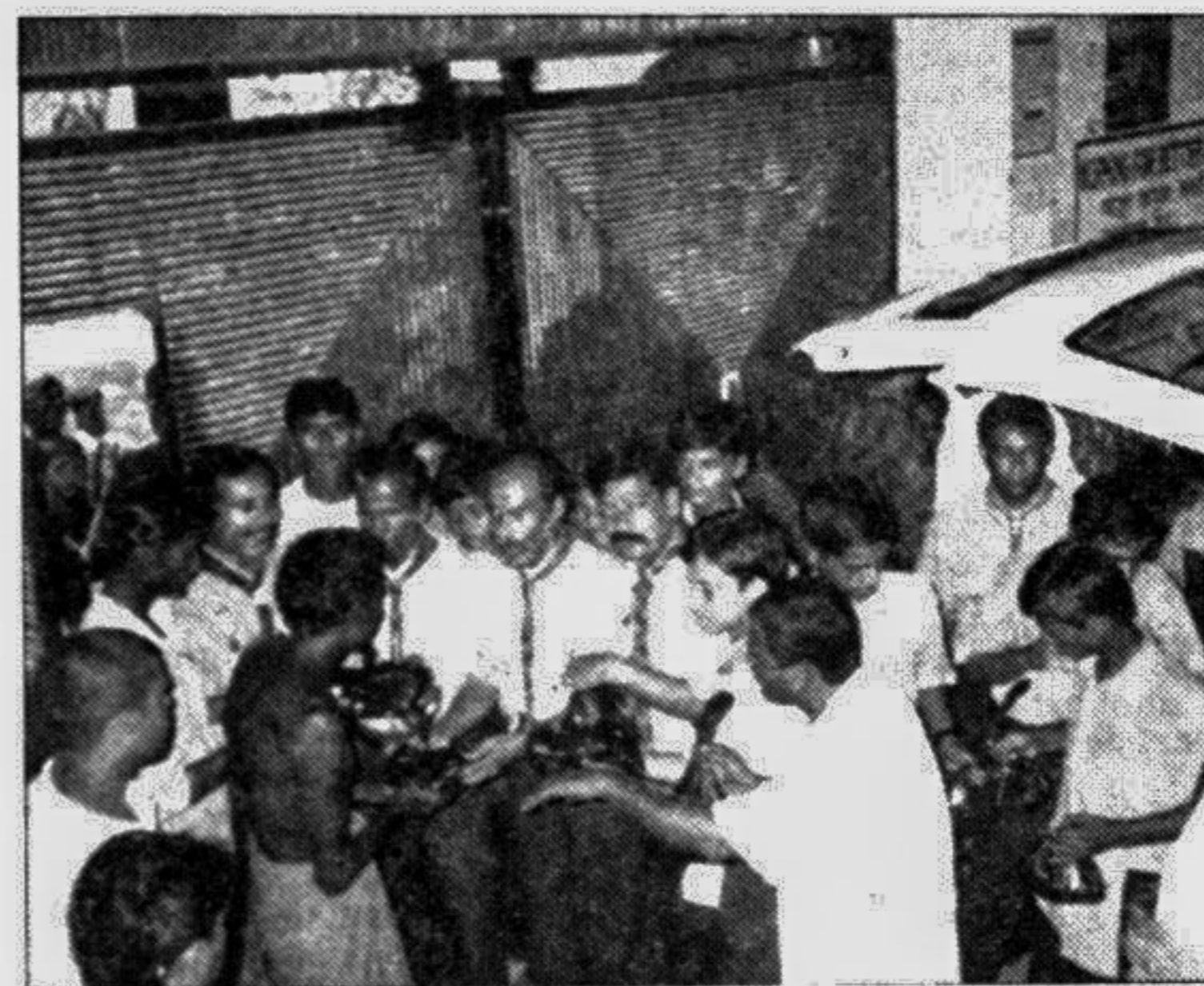
Bangladesh Scouts Dhaka Metropolitan yesterday distributed 500 kg of rice, 500 pieces of clothes, and 300 ORS packets among 325 affected families who have taken shelter at a flood centre at Badda in the city.

The Commerce Minister assured the "genuine" businessmen of continued cooperation by the government. But he reminded that they can never be genuine businessmen those try to make their fortune by hoarding, spreading rumours and at the cost of people's miseries. The government is very alert about the hoarders and the quarter spreading rumours," Tofail said.