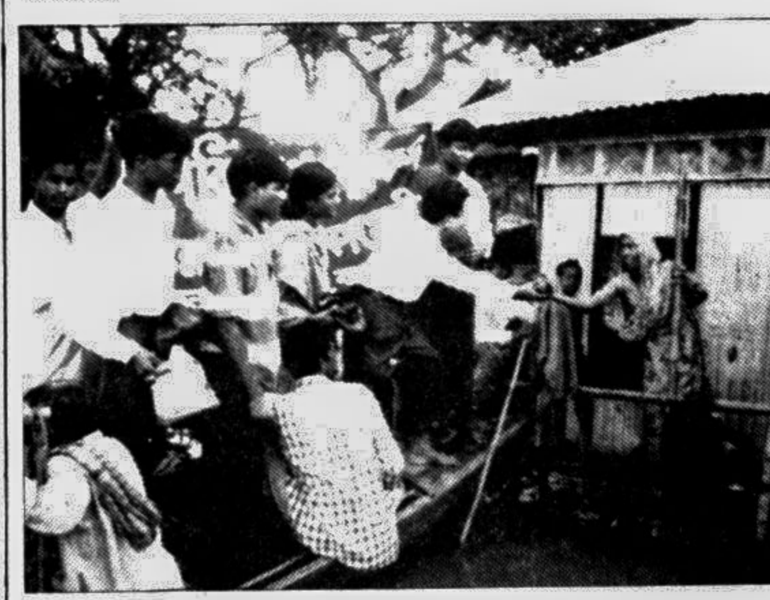
Leo Club of Dhaka Glory distributed relief goods among flood affected people in Munshiganj recently.