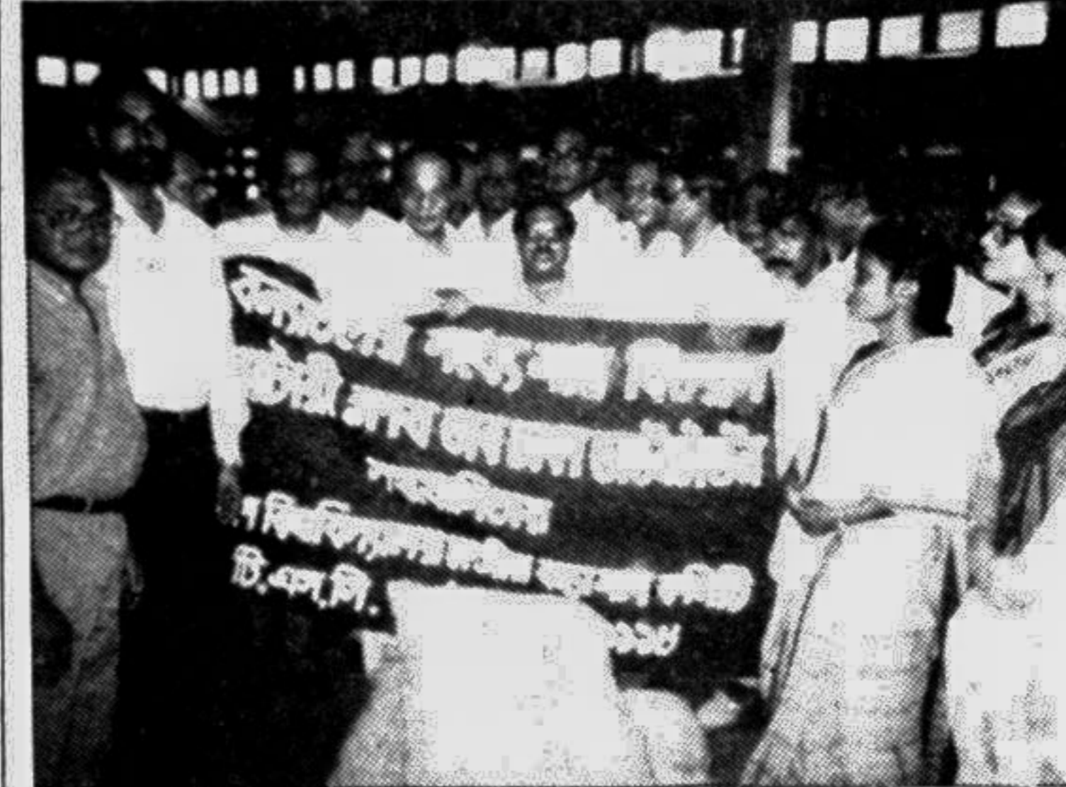
Rotary Club of Dhaka Downtown handed over relief materials to the Dhaka University Central Relief Committee on Tuesday for distribution among the flood victims.