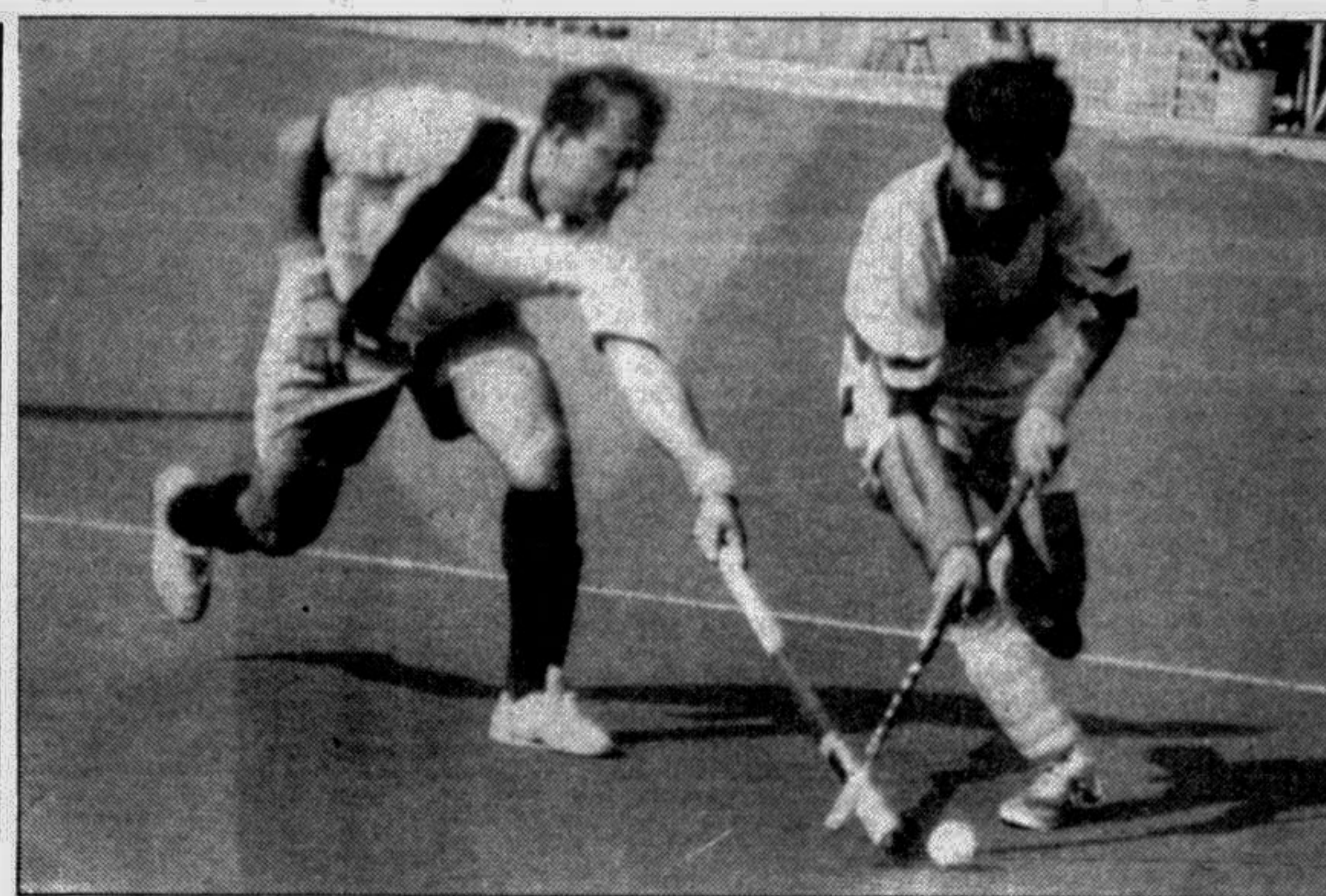
Action from yesterday's First Division hockey league match between Bangladesh Railway and Bachelors' Club at the Moulana Bhasani Stadium. The encounter ended in a 3-3 draw.