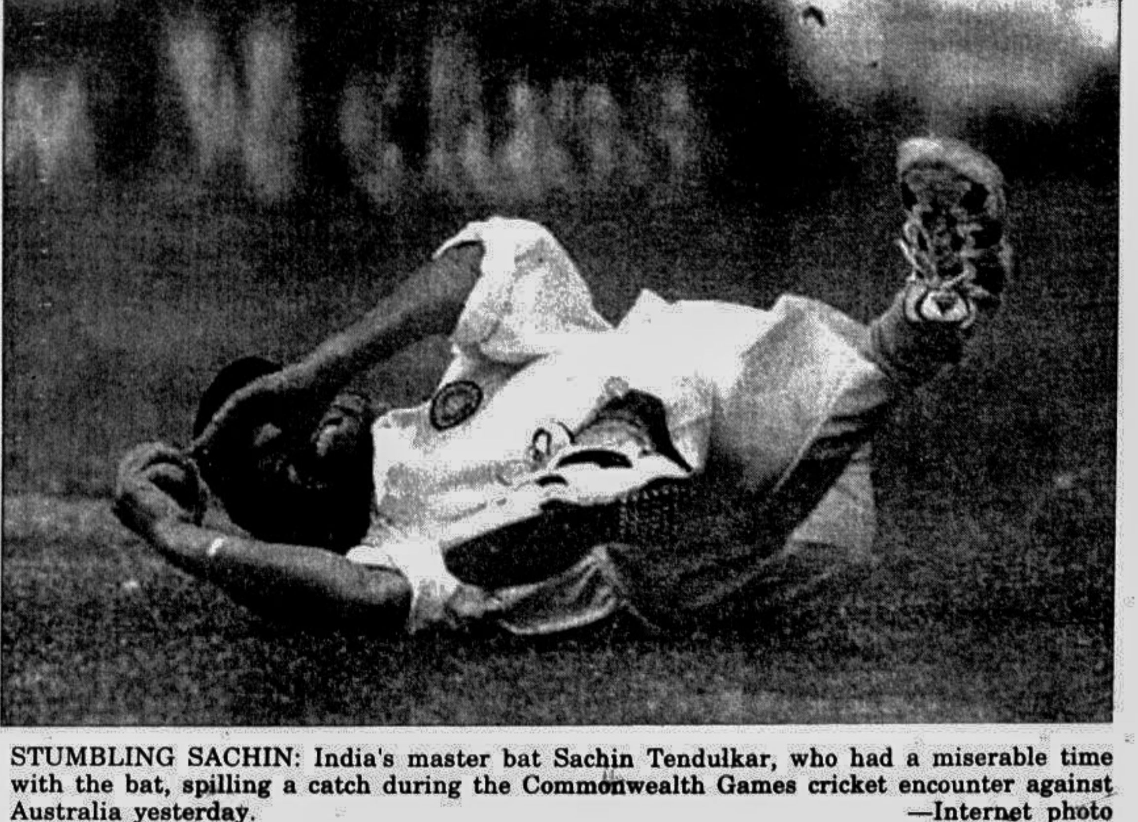
STUMBLING SACHIN: India's master bat Sachin Tendulkar, who had a miserable time with the bat, spilling a catch during the Commonwealth Games cricket encounter against Australia yesterday.

India is the only Asian country, who got two gold medals in shooting.