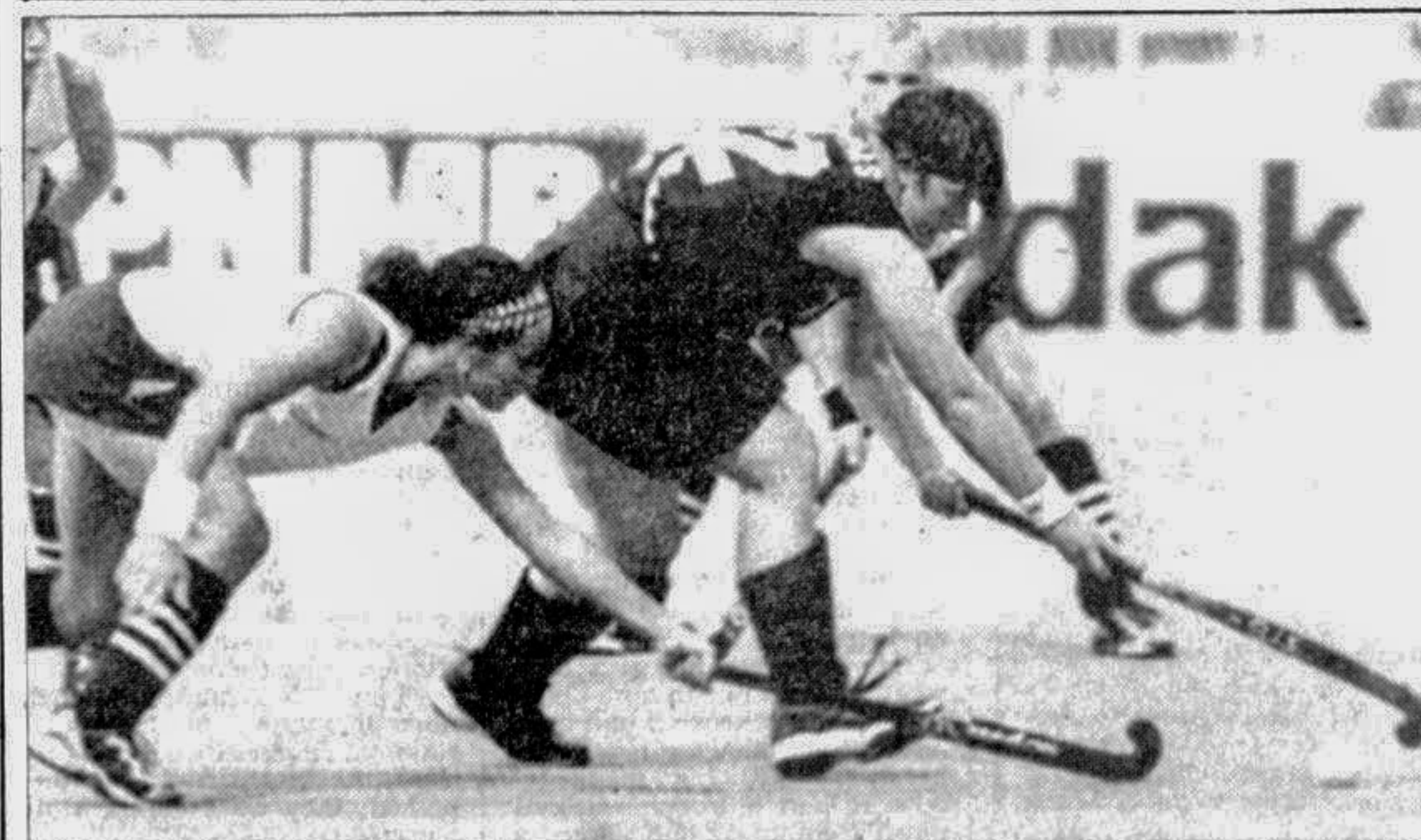
Action from the Commonwealth Games ladies' hockey match between New Zealand and Wales at Kuala Lumpur on September 13. New Zealand won 5-1.

West opened a small Heart, the unbid suit, the Ten was played from dummy, East won the trick with the Jack. He returned a small Heart. West took his King and played back his last Heart. Thus, the defence scored three Heart tricks for down one. In the post-mortem it was found that North South could have made three No Trump as the defence could score four Heart tricks only. North was the culprit, as on South's Club bid North should have bid three No Trumps, instead of showing his 4-card Spades. Obviously South did not have four cards in Spades since he bid Clubs. Thus, a Spade bid was useless as it was difficult to play 4-3 in a suit in the combined hands.