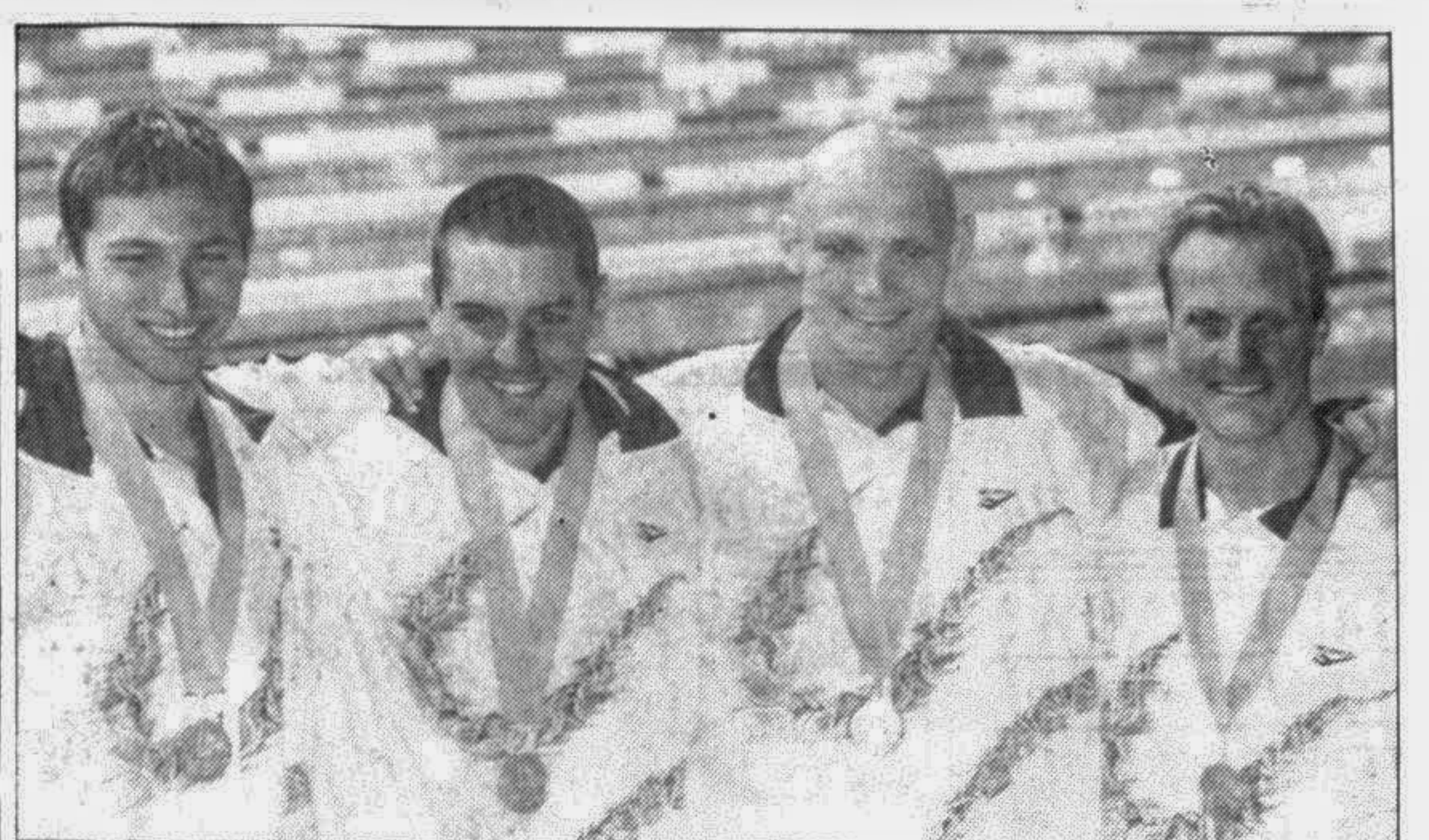
The Australian Commonwealth Games 4x200 metres freestyle relay team of (L-R) Ian Thorpe, Matthew Dunn, Michael Klim and Daniel Kowalski sporting their gold medals at Kuala Lumpur yesterday.

NEW DELHI, Sept 13: Former all-rounder Manoj Prabhakar, whose match-fixing charges had raised a hue and cry in Indian cricket, has fired another bouncer by threatening to sue cricket board for non-release of his benevolent fund, reports PTI.