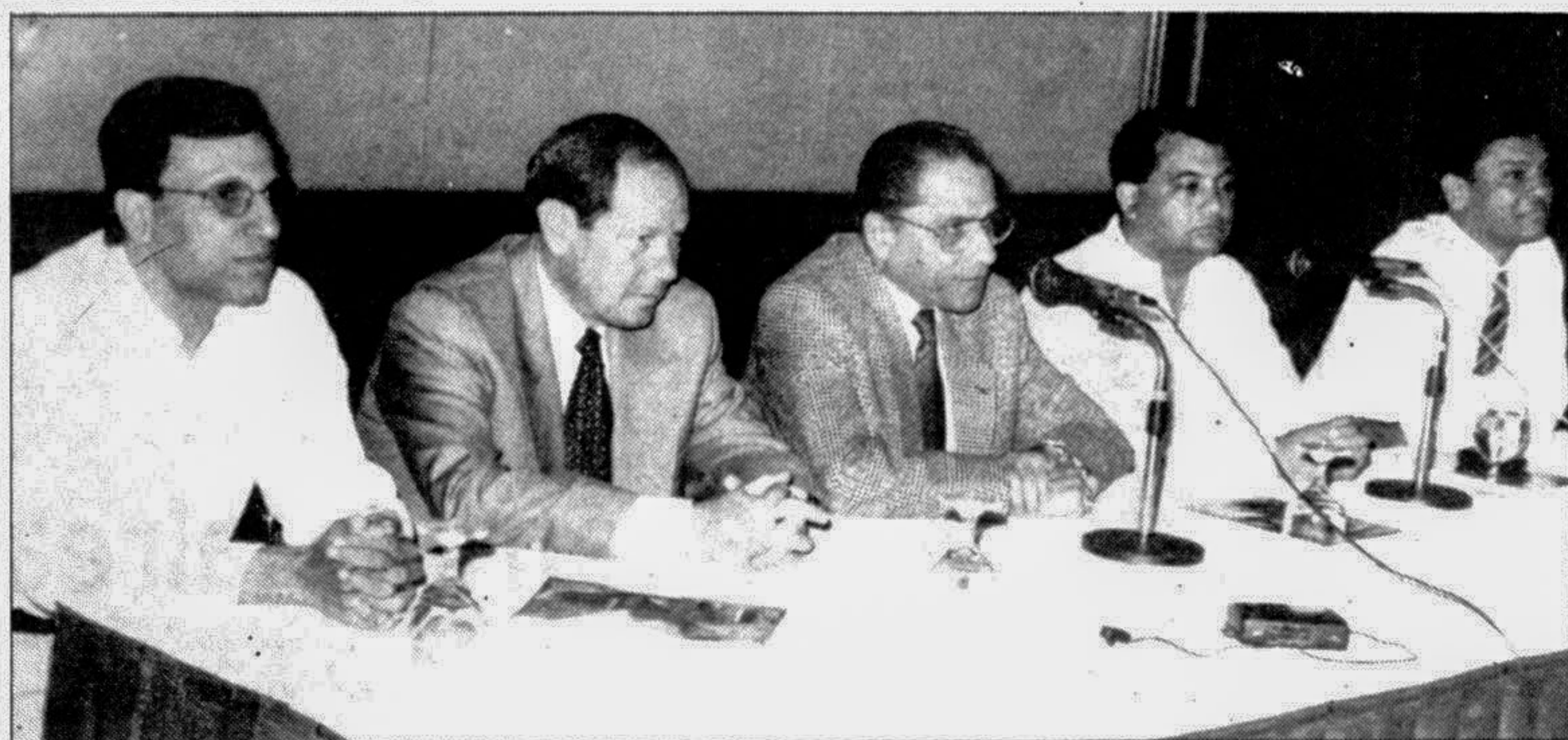
International Cricket Council president Jagmohan Dalmiya (C) addressing a press conference on the forthcoming Wills International Trophy at a city hotel yesterday. Accompanying him are (L-R) the event manager Asif Iqbal, ICC chief executive David Richards, Bangladesh Cricket Board president Saber Hossain Chowdhury and BCB general secretary Syed Ashrafal Haq.