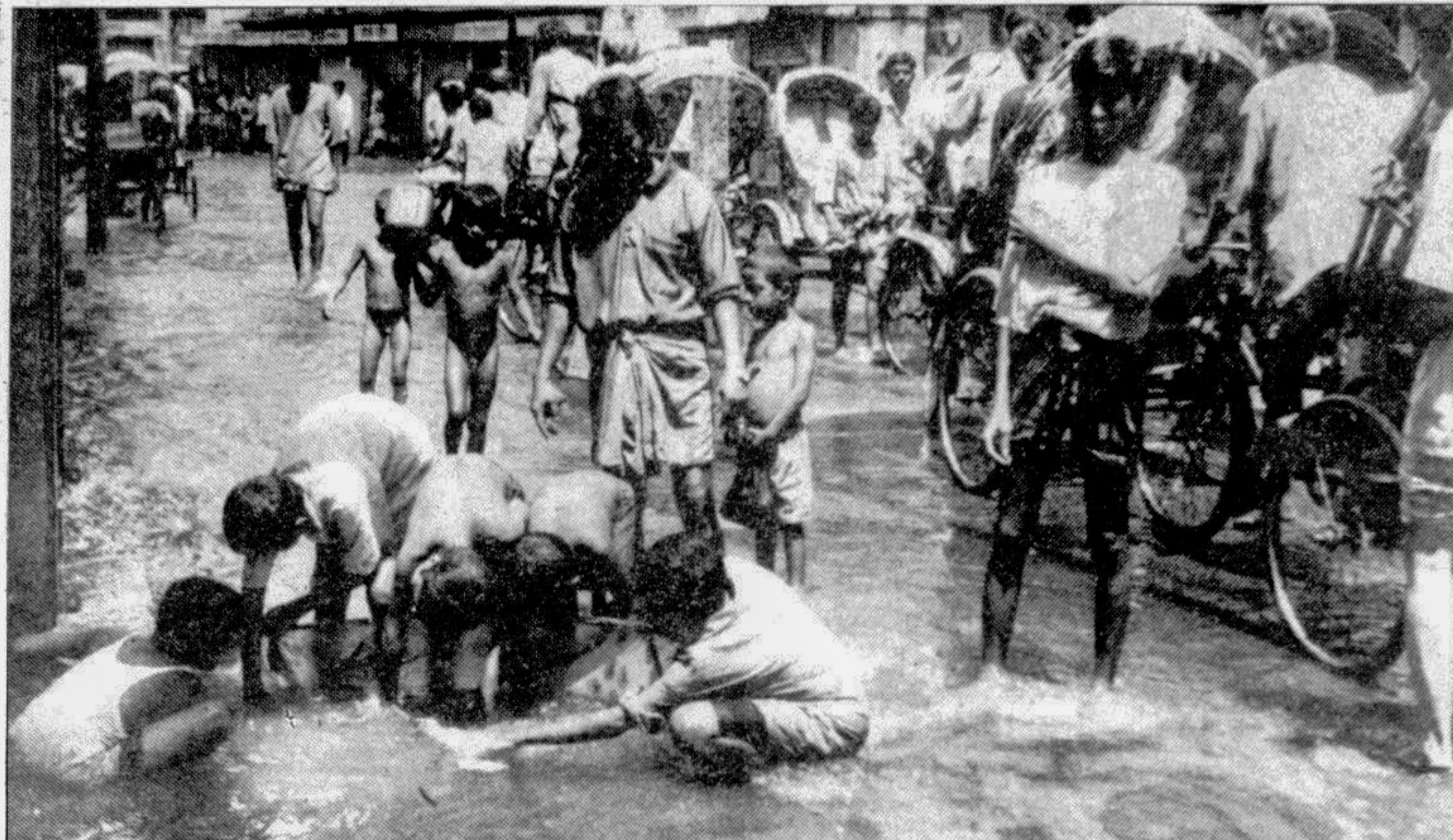
THE OTHER SIDE OF LIFE: Fishing is fun for them anyway. On Haricharan Roy Road in the old part of the city, these children try to find some pleasure in their otherwise difficult times.