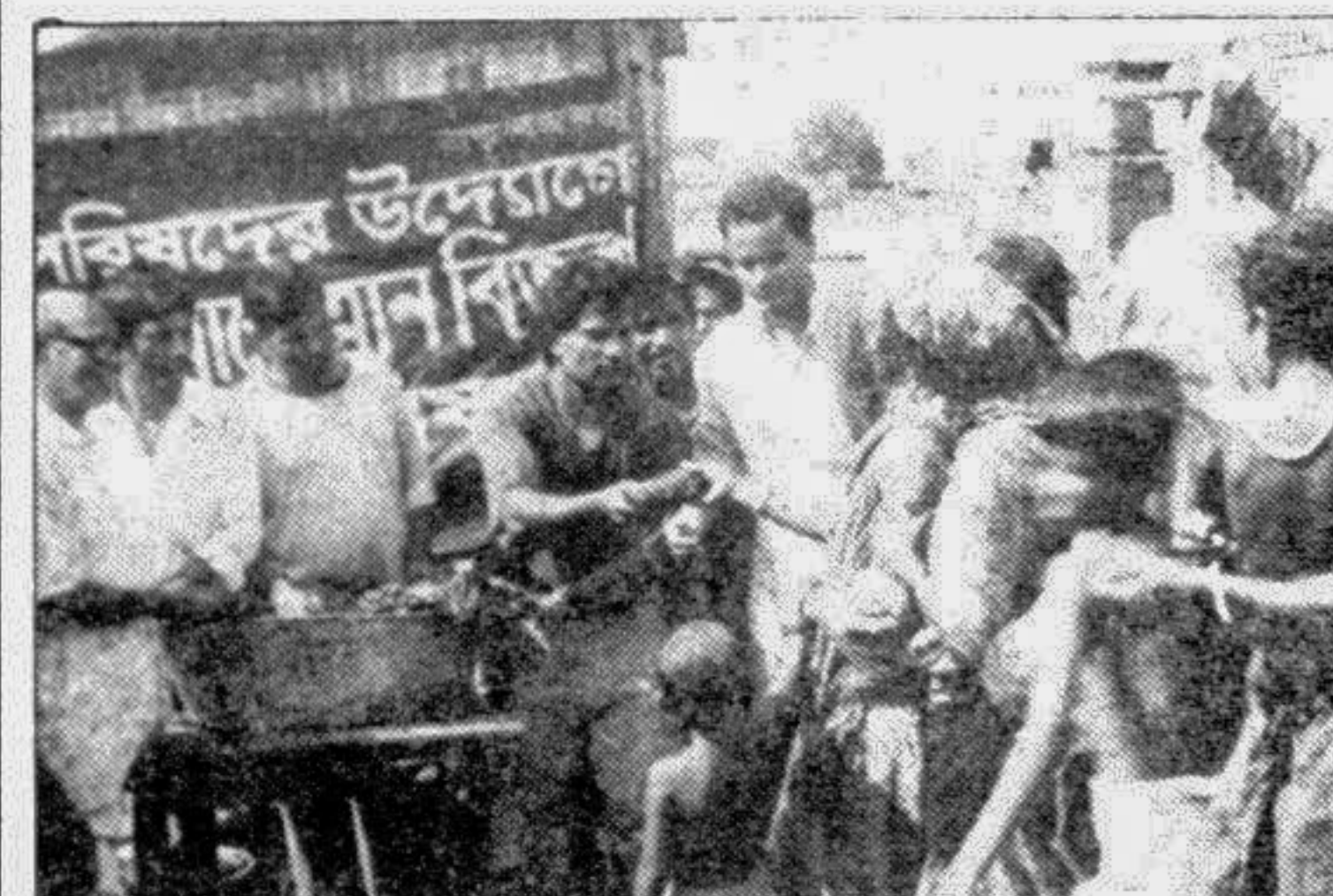
Savar Thana Bangabandhu Parishad distributed relief goods in different flood-hit areas of Savar on Friday.