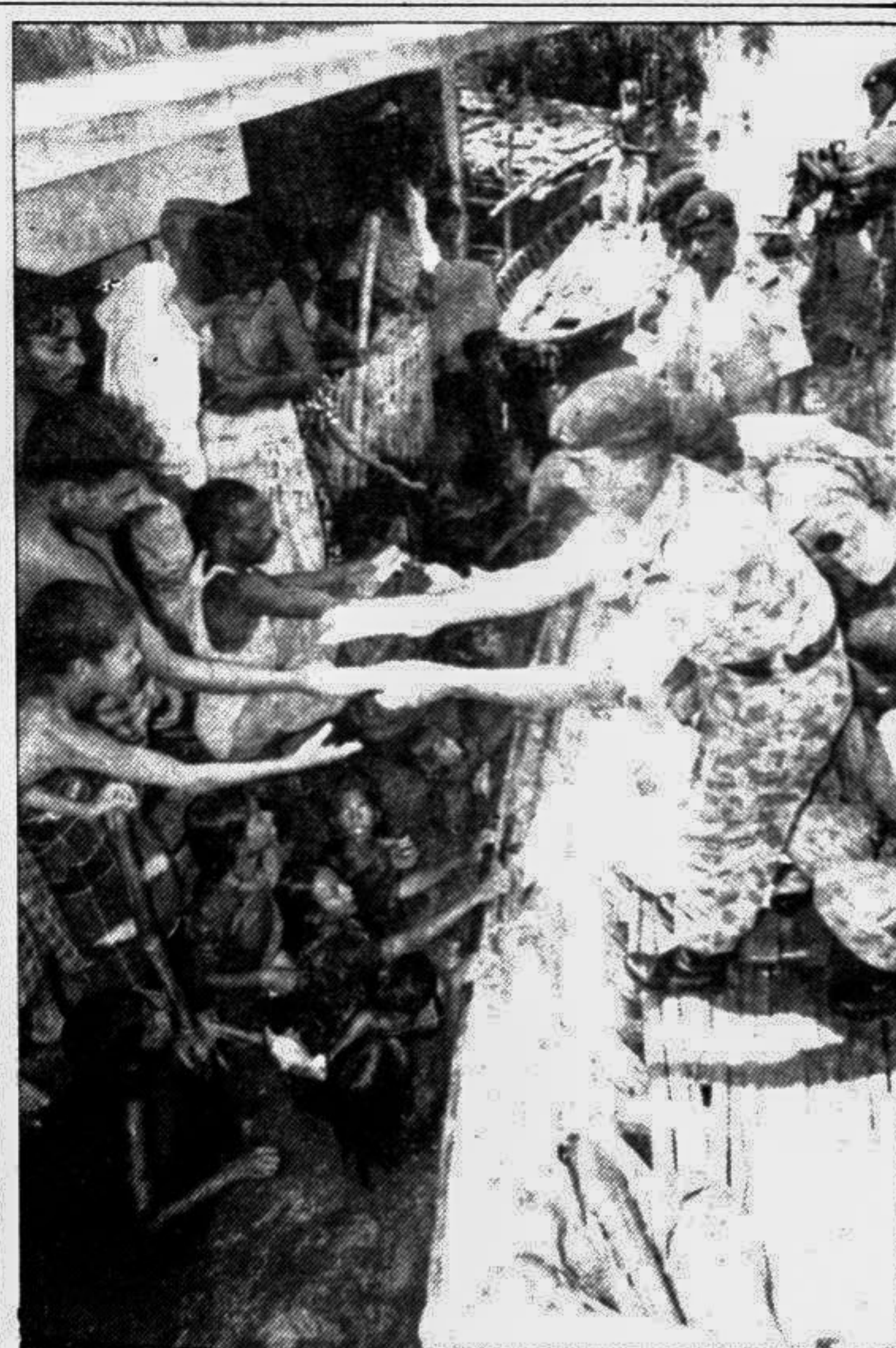
BDR personnel distributed cooked food among the flood-affected people of Kamrangir Char yesterday.

Besides food assistance, she also stressed the need for building multi-purpose shelters.