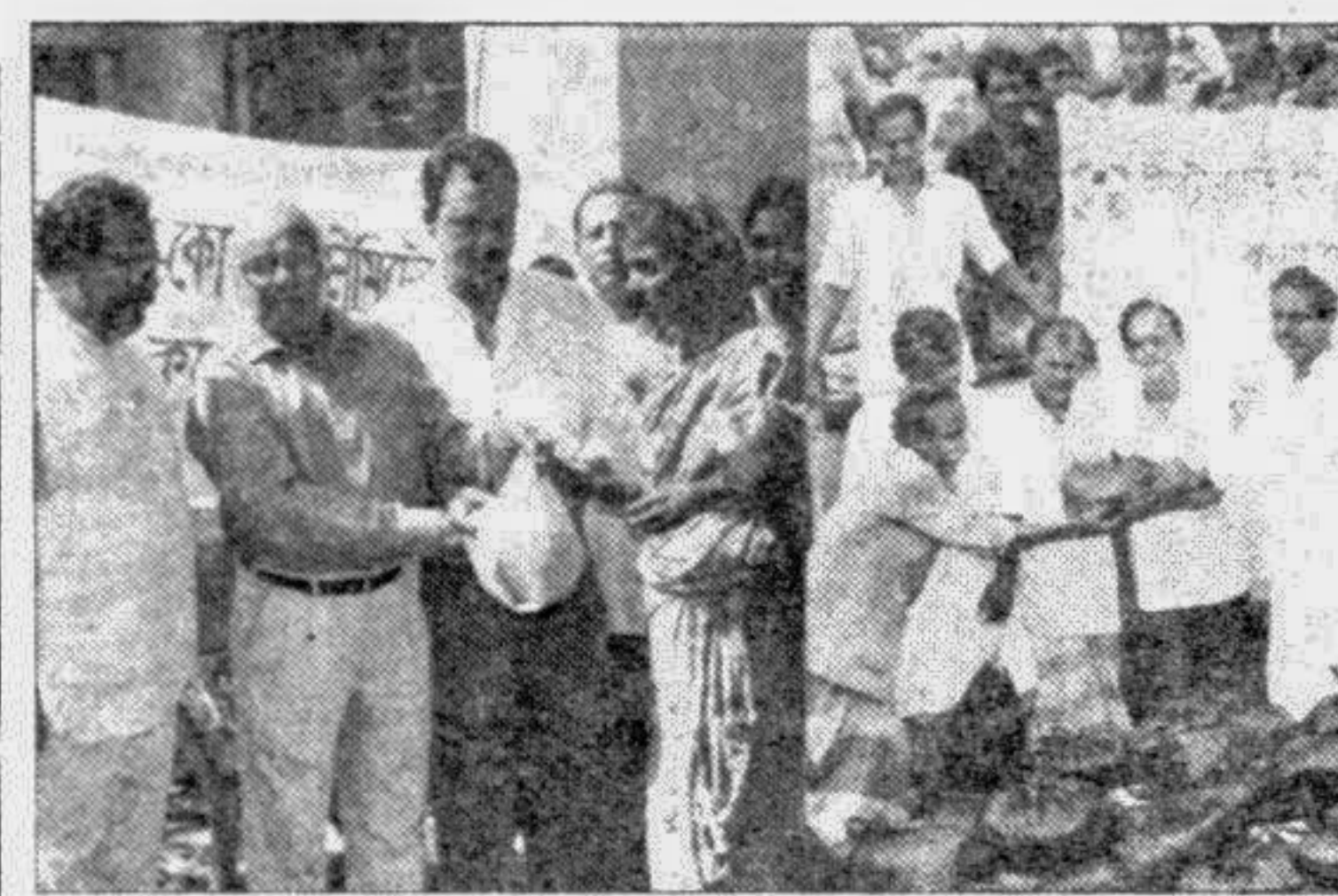
Eastland Insurance Company Ltd distributed relief goods among flood-affected people of Dhaka and Munshiganj districts recently.