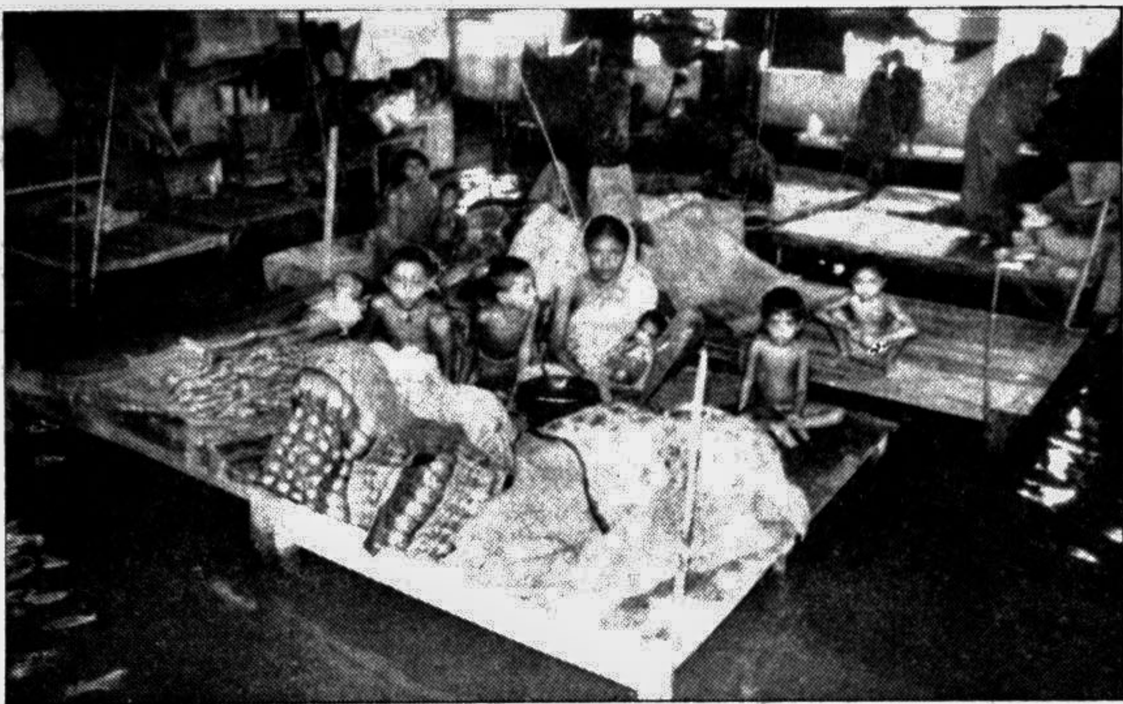
A flooded flood shelter in the city. This picture was taken at Mugda Para Community Centre yesterday.