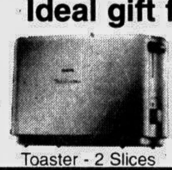
Toaster - 2 Slices