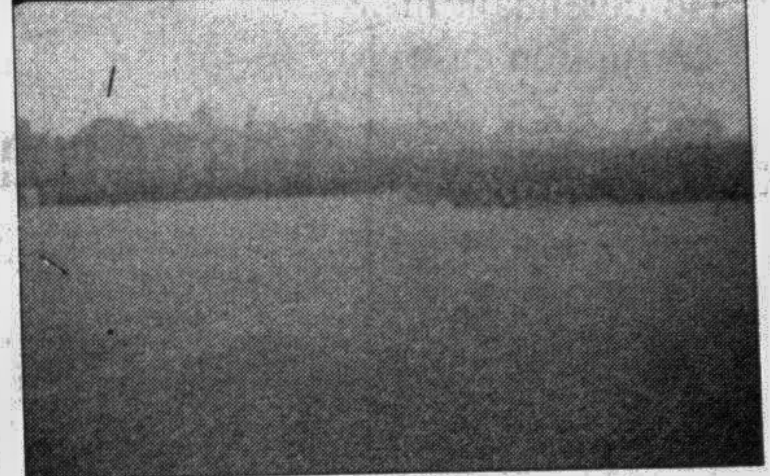
MAGURA: Standing sugarcane have been inundated by flood water in Sripur thana of the district.