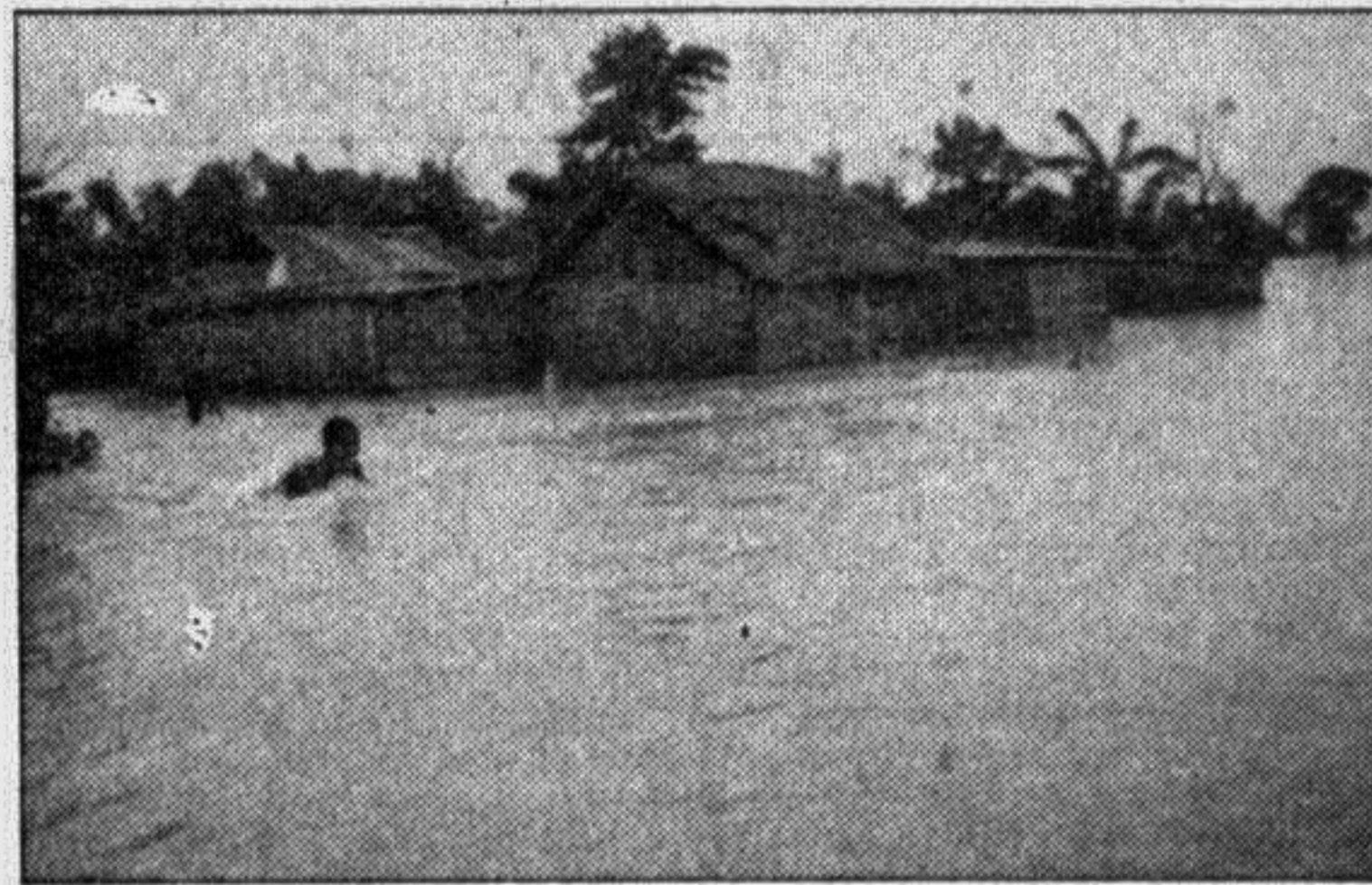
RANGPUR: Flood water has totally engulfed the Uttar Majhipara area in Chilmari thana of Kurigram district.