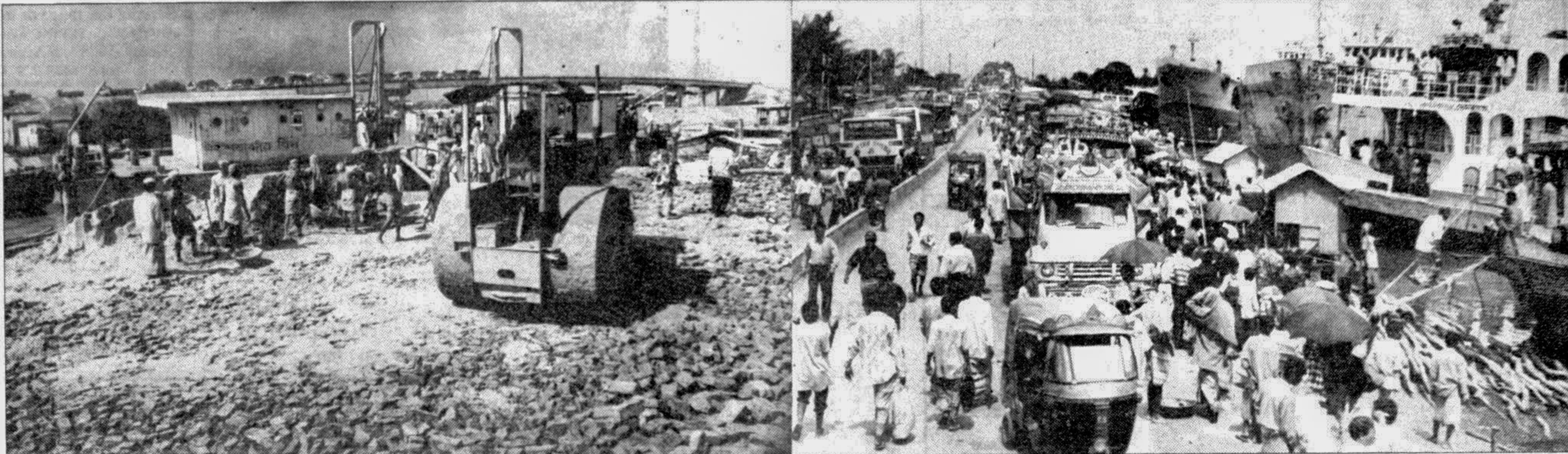
ALTERNATIVES: Man has always found ways in his perennial fight against cruel nature. (Left) A bulldozer levels the approach road to the newly-installed ferry terminal near the Kanchpur Bridge to facilitate movement of export cargo to Chittagong bypassing the flooded portion of the Dhaka-Chittagong Highway. (Right) Giant trawlers now ferry travellers between Kanchpur and Daudkandi from the same point.

Business Floods take their toll on production, manufacturing: Export target looks too tall to reach Ministers visit flood-hit industrial belt of Narayanganj: Donors promise financial support for reconstruction plan Both DSE and CSE indices rise Pages 6, 7, 8