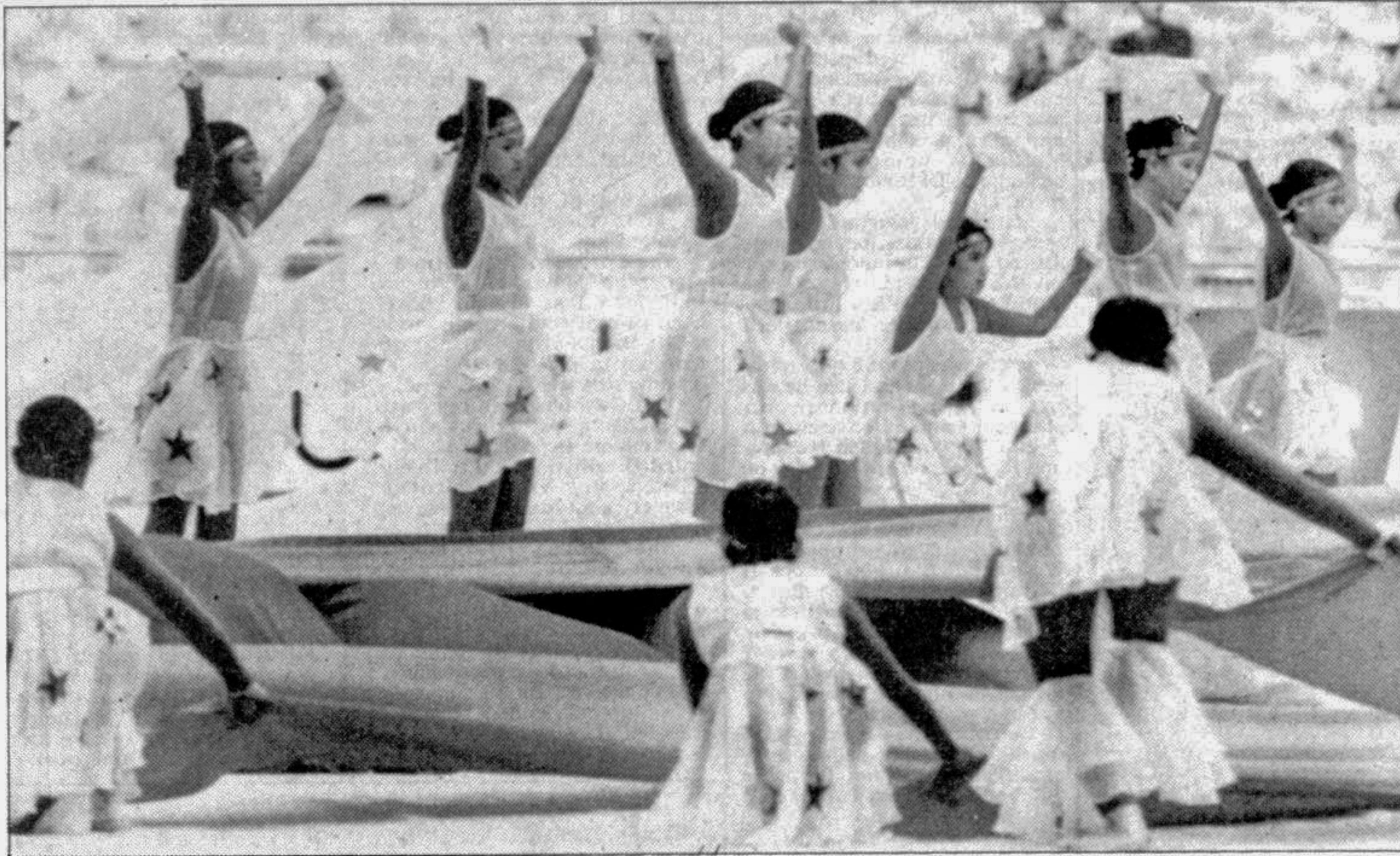
DANCING QUEENS: Malaysian girls performing the coloured ribbons dance during the opening ceremony of the 16th Commonwealth Games at Kuala Lumpur yesterday.

Now she wants to beat her and win the gold.