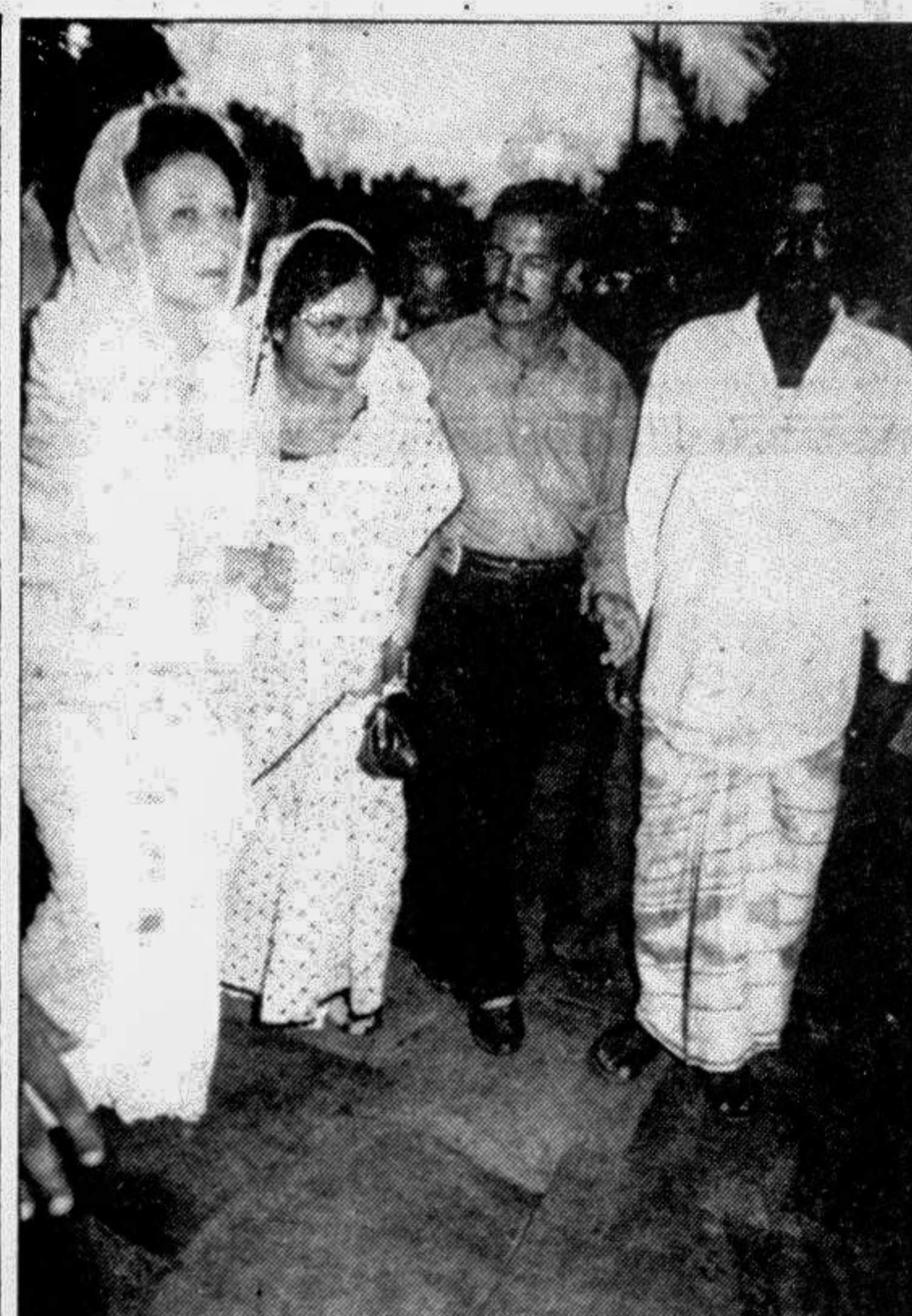
BNP Chairperson Begum Khaleda Zia visited the DND embankment at Sarulia, Demra, yesterday.

National Project Director, Project - BGD/97/043